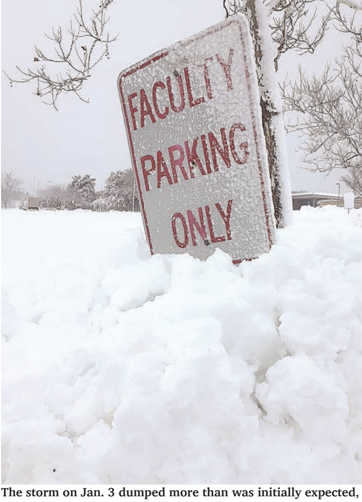
as much as a foot of snow. Franconia had 11.8 inches; Rose Hill measured 10 inches; Fairfax Station measured 8.2 inches, according to the National Weather Service.

"Please be aware that the goal is to provide food to students wherever possible during inclement weather days," FCPS said. Weekly meal kit distribution will be done at the regular locations from 10:30 - 11:30 a.m. on Thursday, Jan. 6.