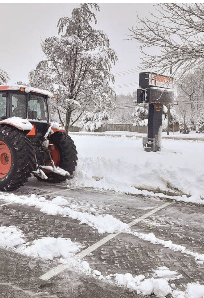
At Hayfield Secondary, the plow was operating while flakes continued to come down.

At one time, families would gather around the radio and television to hear the status of schools for the coming day, but it's now online. The word goes out through social media and the FCPS website. The school system hashed out the snow day plan in October this year and posted it on the website. "The first five inclement weather days will be traditional inclement weather days.