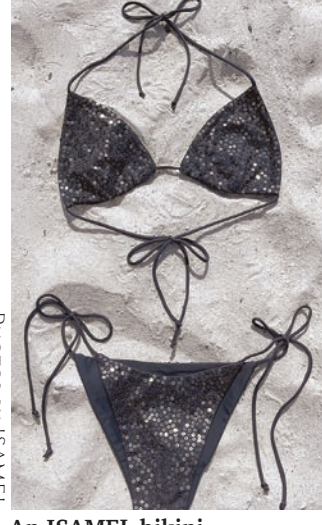
An ISAMEL bikini.