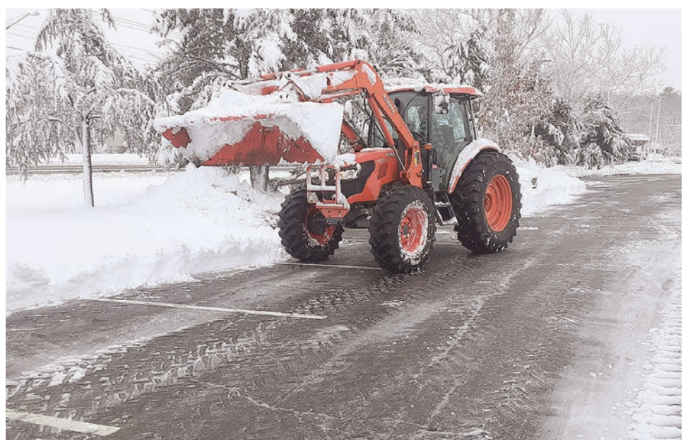
The lots are cleared for incoming students and staff, or for people to pick up food or devices to take class online.