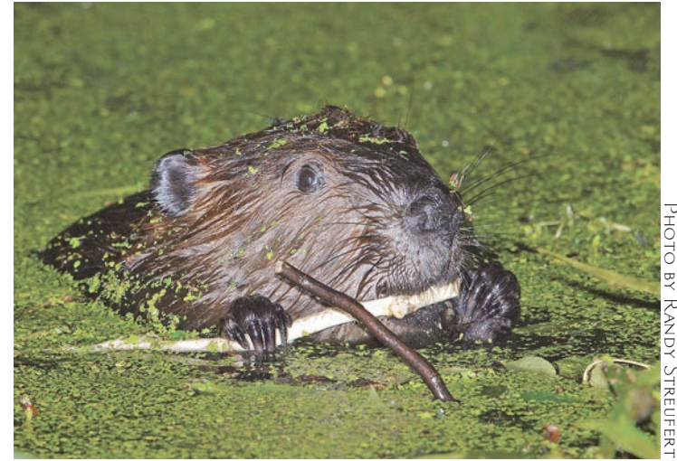
A beaver eating the bark off a tree branch.

At Huntley Meadows Park, "We do not know how many beavers or lodges are withwww.ConnectionNewspapers.com