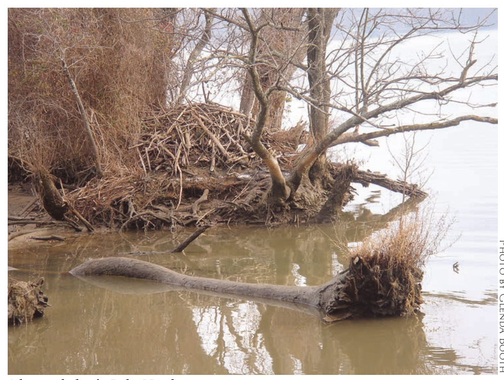
A beaver lodge in Dyke Marsh.