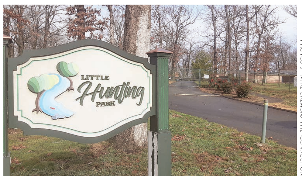
The Virginia Department of Historic Resources is placing a sign soon though the exact location has not been determined yet.