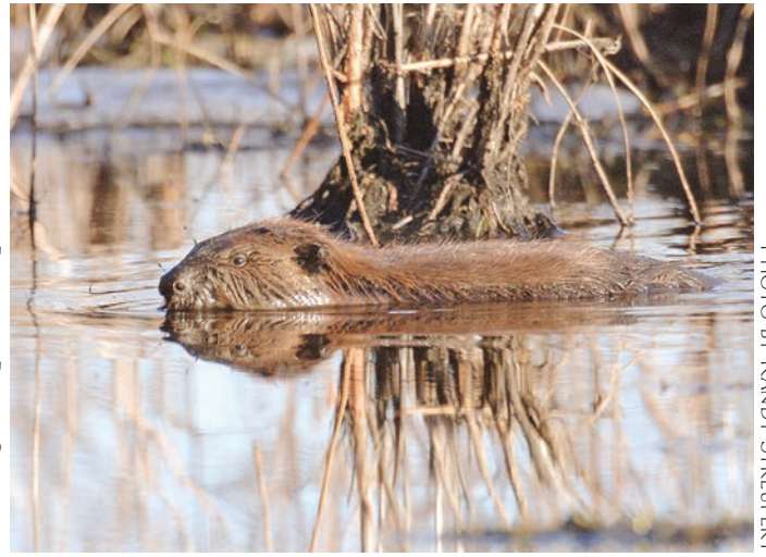
A beaver swimming.