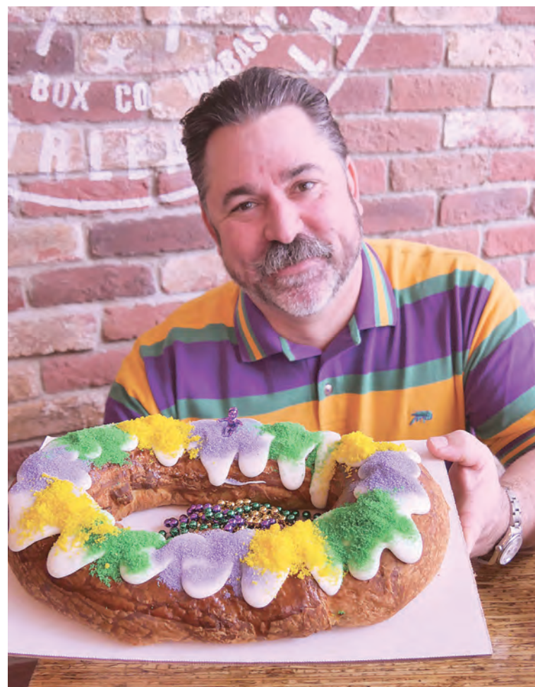
Bayou Bakery King Cake ready for the first party of the Mardi Gras season.