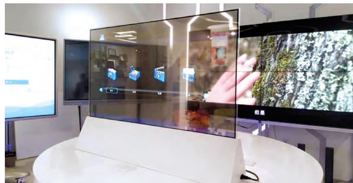
LG Electronics, maker of a transparent OLED concept display, was one of several major exhibitors to pull out of CES 2022 at the last minute due to coronavirus concerns.

Organizers announced that anyone unable to attend CES in person can access the show digitally through Jan. 31 at www.ces.tech .