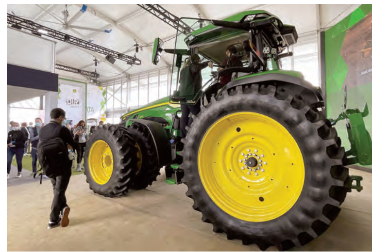
John Deere unveiled a fully autonomous tractor during CES 2022.