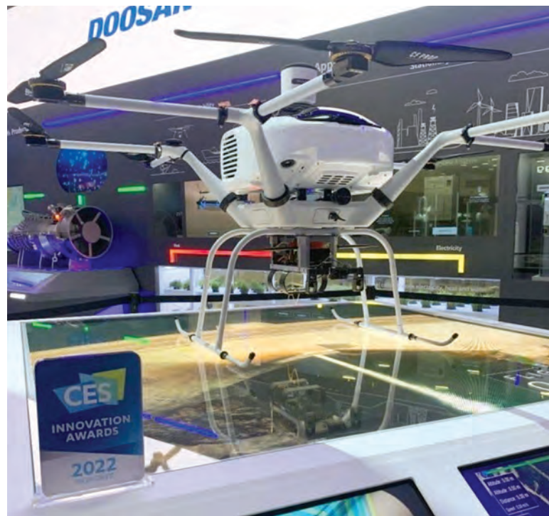
Doosan Mobility Innovation won two CES 2022 awards for its hydrogen fuel cell-powered drone systems.