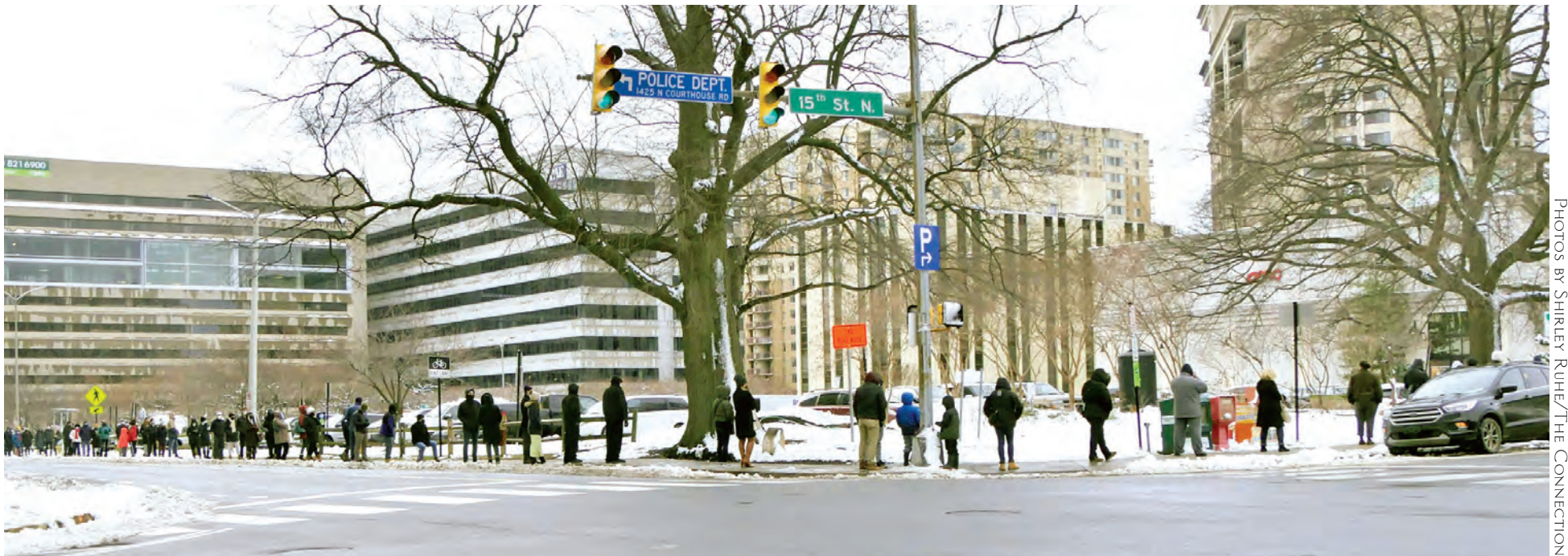
A line forms down the block and around the corner on Jan. 6 for COVID-19 tests at the County testing kiosk at Courthouse Plaza Parking Lot.