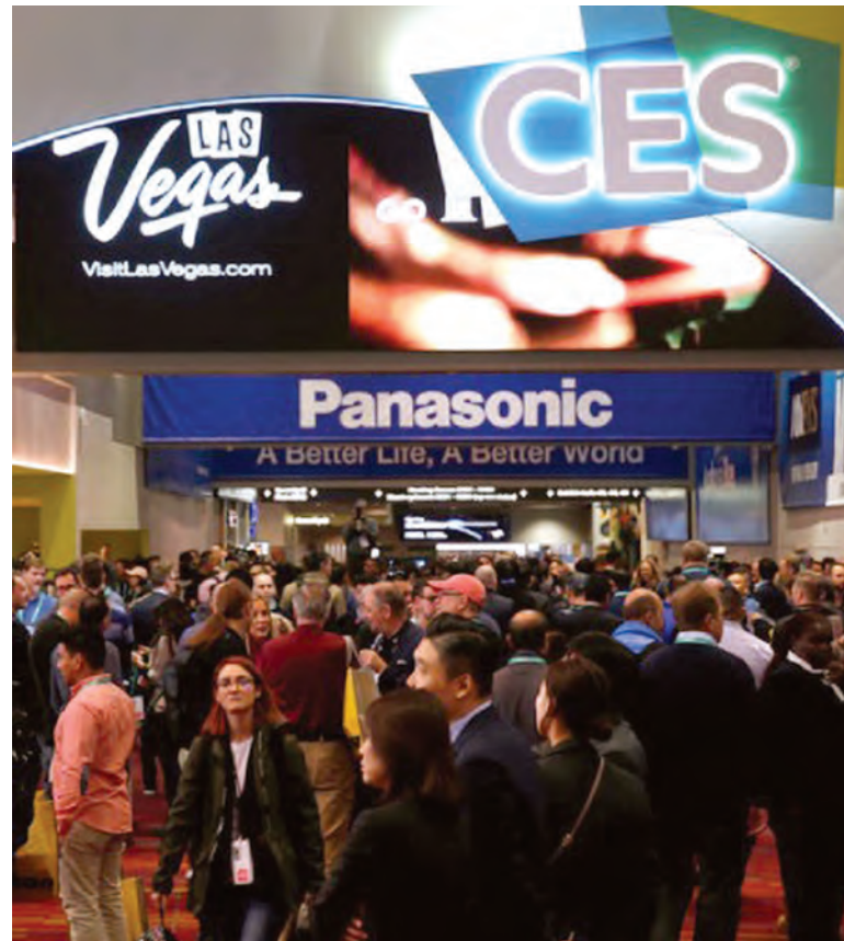
Hosted by the Arlington-based Consumer Technology Association, CES 2022 returned to Las Vegas Jan. 5-8 in the world's largest consumer technology trade show.