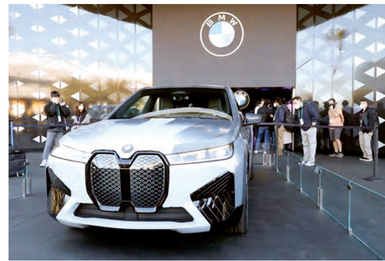
BMW debuted a color-changing electric concept car called BMW iX Flow utilizing E Ink technology. The vehicle can change its exterior color from black to white and shades of grey almost instantaneously.