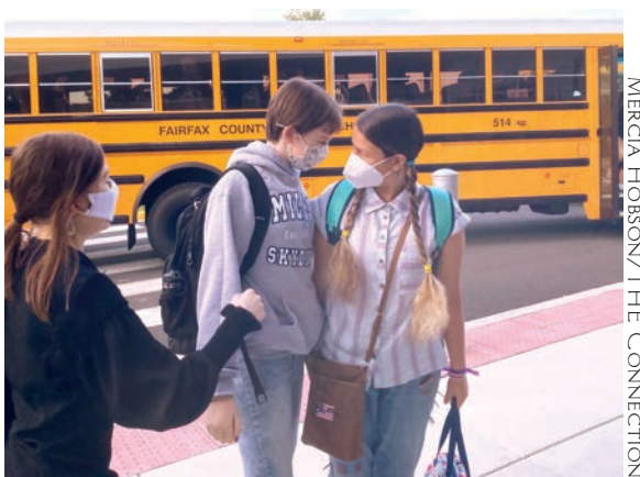
Students return to in person learning in Fairfax County Public Schools.