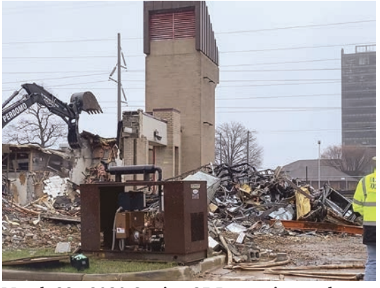
March 23, 2020-Station 25 Reston is razed.