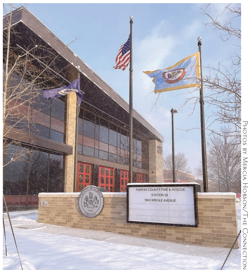
The new $15 M Fairfax County Fire & Rescue Station 25, 1820 Wiehle Ave, Reston, Va.