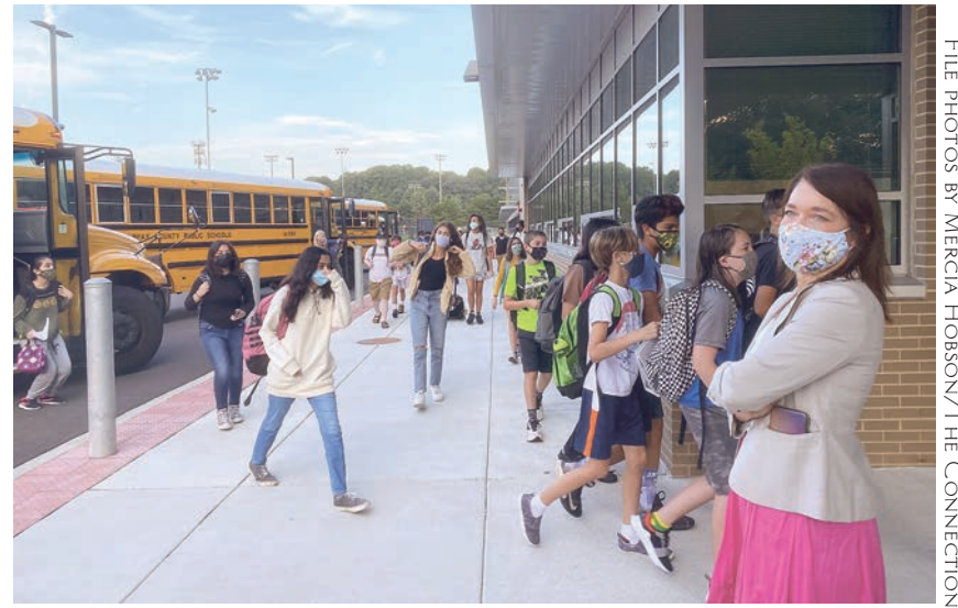
FCPS is resolved to keep schools open.