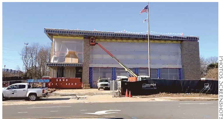
Dec. 29, 2020- Station 25 Reston taking shape.