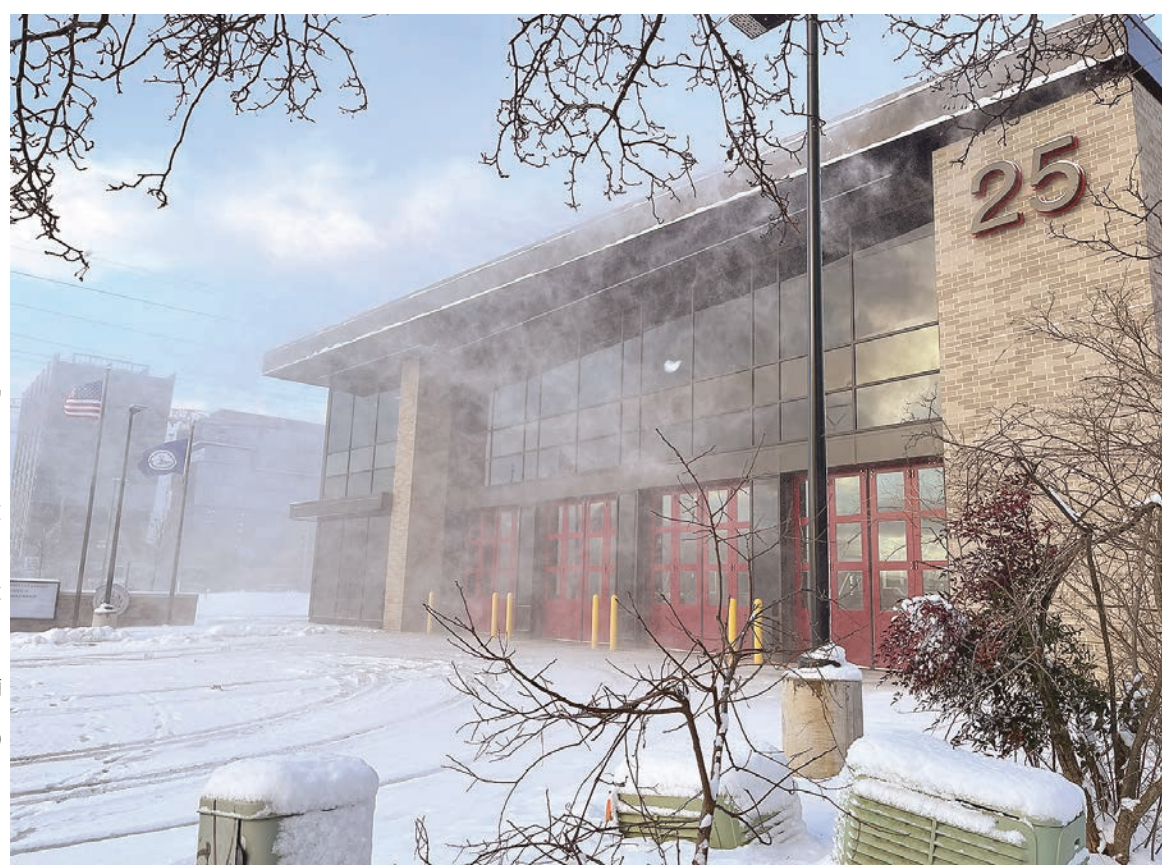
Gusty winds blow snow from the roof of Fairfax County Fire/Rescue Station 25 two days after the station's A-Shift spent the day moving from their temporary station at 1840 Cameron Glen Drive to 1820 Wiehle Ave.