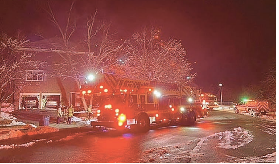
Firefighters and engines at the scene of the house fire.

In addition, a criminal investigation into the use of force is being conducted by the department's Major Crimes Bureau. Davis will release body-camera footage and audio recordings of the 911 call for service, within 30 days, or when it no longer jeopardizes the integrity of the investigation.