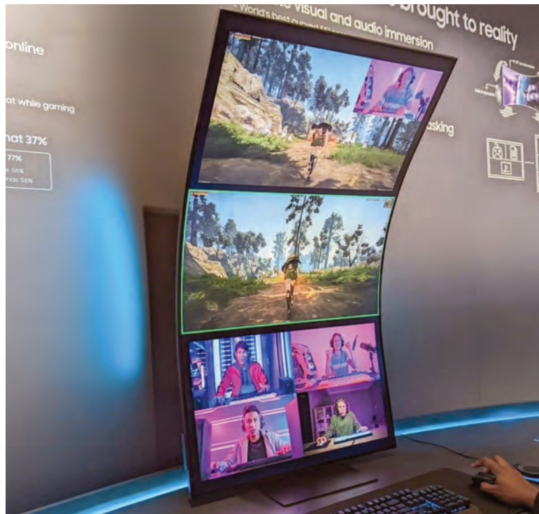
Samsung's 55" Odyssey Ark gaming monitor was unveiled during CES 2022.