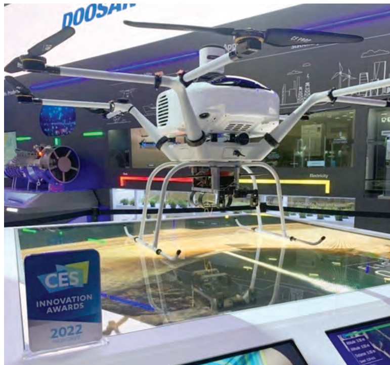
Doosan Mobility Innovation won two CES 2022 awards for its hydrogen fuel cell-powered drone systems.