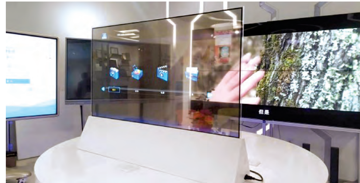
LG Electronics, maker of a transparent OLED concept display, was one of several major exhibitors to pull out of CES 2022 at the last minute due to coronavirus concerns.

According to CTA, more than 800 startups from 19 countries