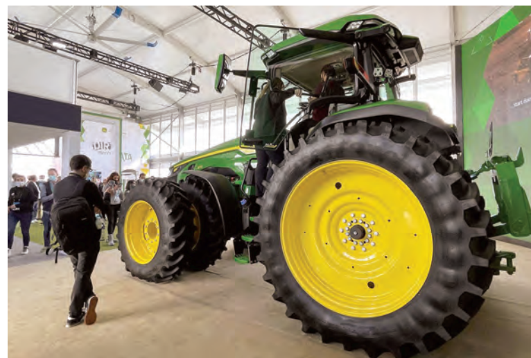
John Deere unveiled a fully autonomous tractor during CES 2022.