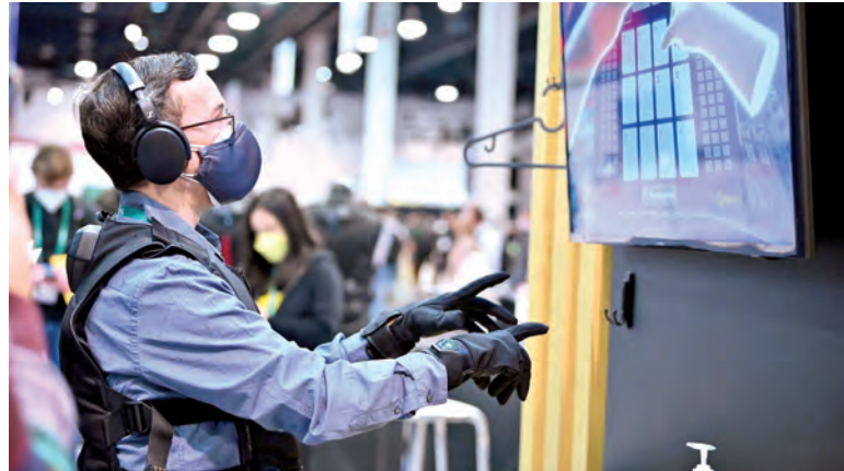
A virtual gaming display at CES 2022.