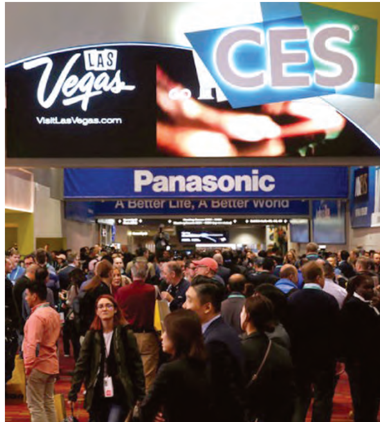
Hosted by the Arlington-based Consumer Technology Association, CES 2022 returned to Las Vegas Jan. 5-8 in the world's largest consumer technology trade show.