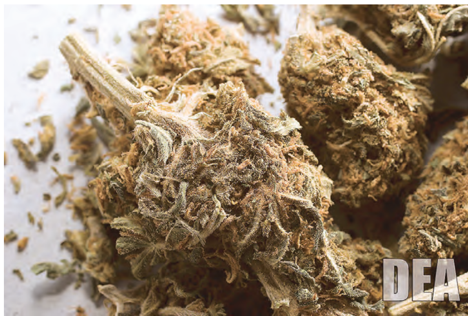
As of July 1, possession of less than an ounce of marijuana is legal in Virginia.