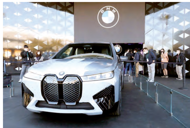
BMW debuted a color-changing electric concept car called BMW iX Flow utilizing E Ink technology. The vehicle can change its exterior color from black to white and shades of grey almost instantaneously.