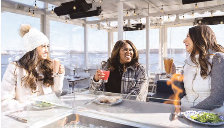
BARCA Pier and Wine Bar.

For 10 days and two weekends, nearly 70 restaurants in Alexandria, Va. will offer a $35 prix fixe dinner for one or two people during Alexandria Restaurant Week, Jan. 21 to 30, 2022. Special menus are available in-person at all participating restaurants, many with heated outdoor dining available. Fifty restaurants will also offer to-go options in addition to in-person meals. The online menu book makes it easy to browse delicious selections from dozens of Alexandria eateries and enjoy special menus at some of Alexandria's winterized dining destinations or from the comfort of your own home.