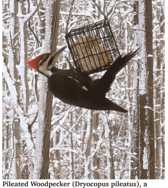
Pileated Woodpecker (Dryocopus pileatus), a large bird, 16-10 inches long, mainly eats insects, supplemented with fruit, nuts, and berries, infrequently visiting feeders.

UBILEECHRISTIANCENTER "Loving People to Life"