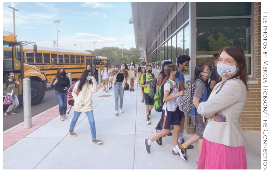
FCPS is resolved to keep schools open.