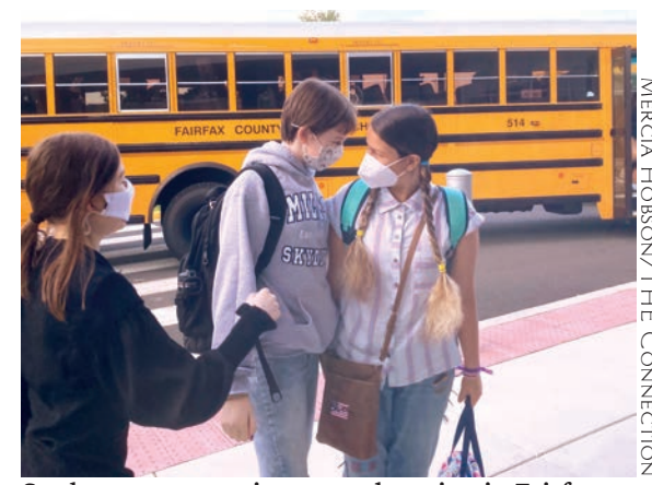
Students return to in person learning in Fairfax County Public Schools.

✤ 5–11-year-old vaccine recipients who are moderately or severely immunocompromised are eligible to receive a third dose of the Pfizer-BioNTech vaccine 28 days after the second dose.