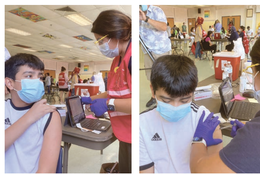
FCPS is urging families to get their children vaccinated as the best protection against Covid-19.

✤ Use FCPS' diagnostic testing if a student has symptoms.