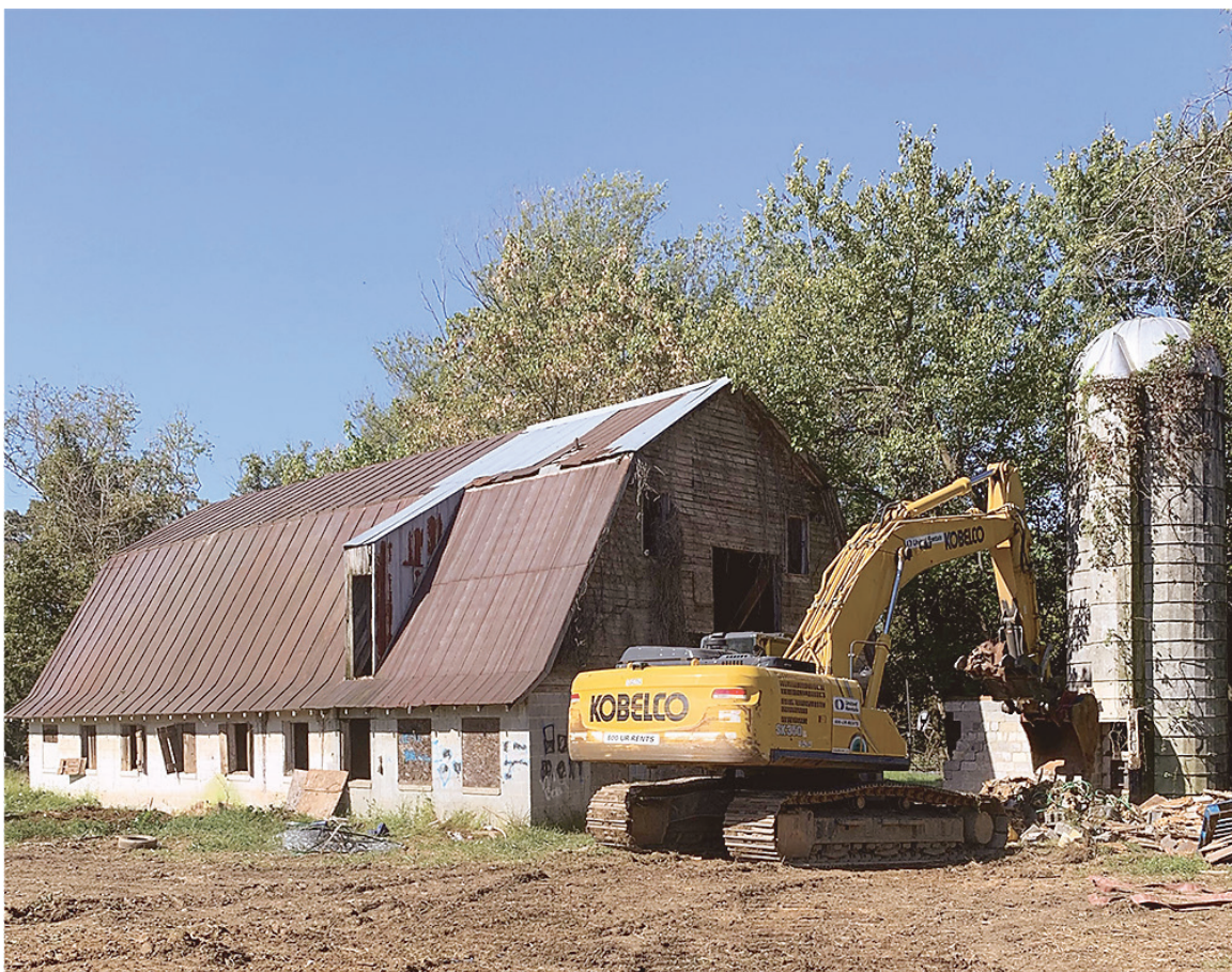
Razing the Marmota barn and silo.