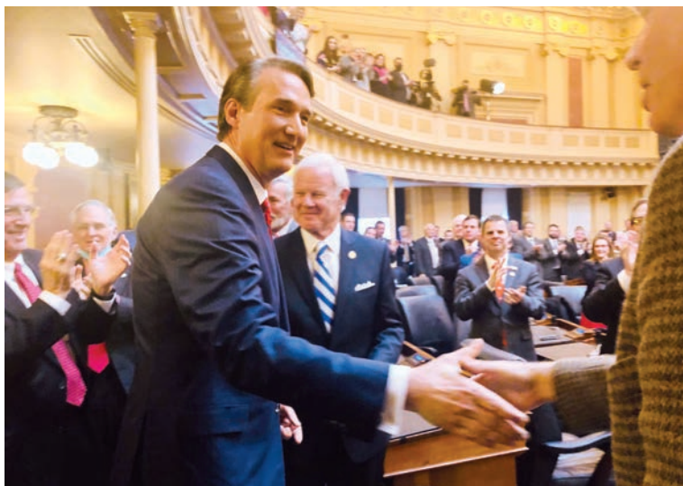
Gov. Glenn Youngkin began his day one agenda by issuing executive orders to ban critical race theory from public schools and allow parents to decide whether their children wear masks in schools.

On the campaign trail, Republican candidate Glenn Youngkin often talked about what he called his "day-one agenda," things like banning critical race theory from schools and getting rid of mask mandates. Shortly after his inauguration as governor, he signed executive orders to deliver on both of those campaign promises although the details of how that might actually work remain unclear. Critical