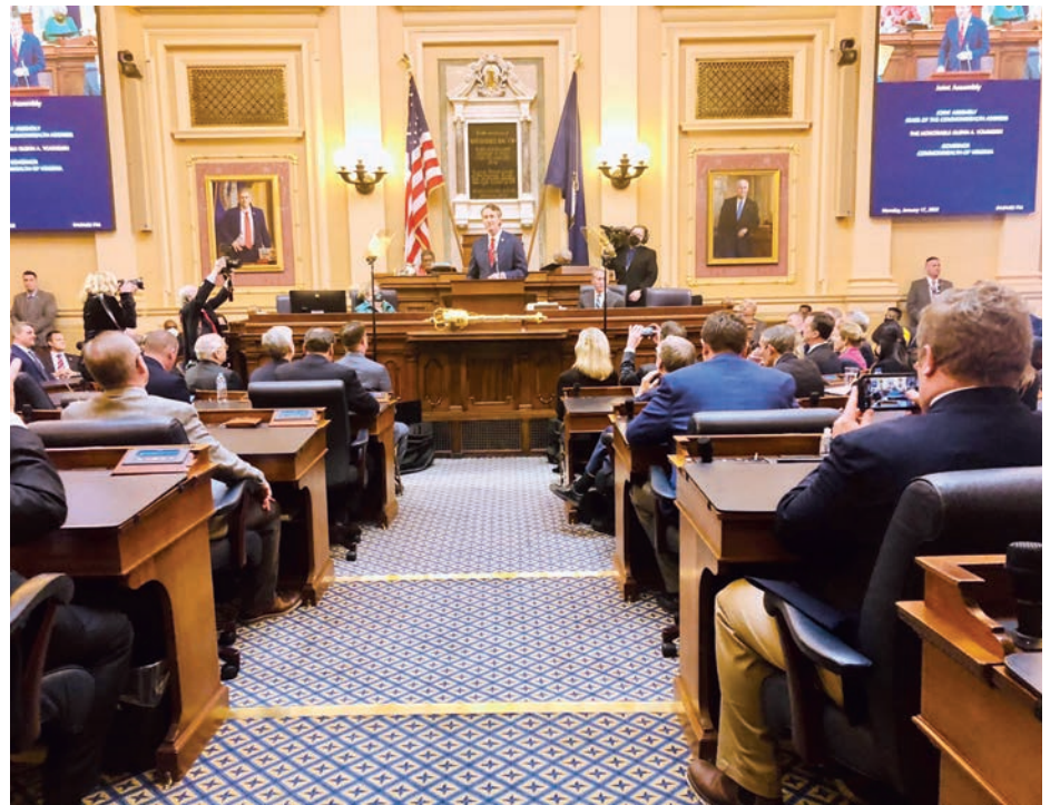
One issue where Democrats and Republicans might find common ground is banning political contributions from public utilities.