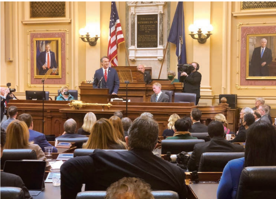
Republicans are hoping to spend $150 million to create 20 new charter schools, but they'll be facing opposition in the Senate Education Committee, which has nine Democrats and only six Republicans.