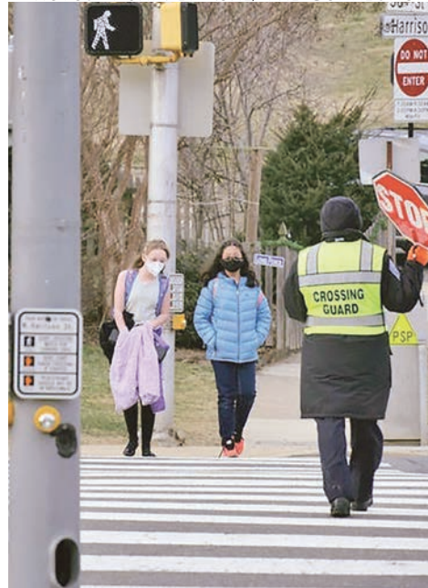
The first day of the Governor's order relaxing the school mask mandate is over but these Williamsburg Middle School students are walking home after school still wearing their masks.

buses as part of their layered approach to safety. In its online posting announcement, APS noted, "The federal requirement from Feb. 2, 2021, is still in place on all forms of public transportation. Anyone riding a school bus is therefore required to wear a mask when riding on our school buses to prevent the spread of COVID-19."