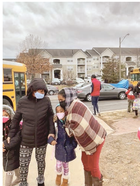
Students, parents, and guardians arrive masked at FCPS' McNair Farm Elementary School.

"I'm frustrated too. I want to see the COVID cases go down, but I also believe our responsibility is to all of our students. And