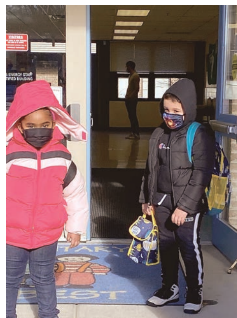
FCPS regulation requiring universal masking remains in effect in accordance with state law. Students must adhere to the requirements of Regulation 2109.2. Face masks are included in the student dress code and failure to comply remains an SR&R violation.