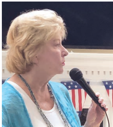
Senator Janet Howell, second most senior senator, and member of the powerful Finance and Appropriations, Privileges and Elections, and Rules Committees, is another area senator paired with another incumbent in the new redistricting map . Shown at 2019 campaign event)

Supreme Court rulings have helped to set precedent, including that "the Equal Protection Clause demands no less than substantially equal state legislative representation for all citizens, of all places as well as of all races." The Voting Rights Act of 1965 mandates that electoral district lines cannot be drawn in such a manner as to "improperly dilute minorities' voting power." In a 2019 case, the Supreme Court held that the Republican led House of Delegates did not have the legal right to challenge a lower court opinion that struck several district maps in the Commonwealth they had drawn, as an unconstitutional racial gerrymander.