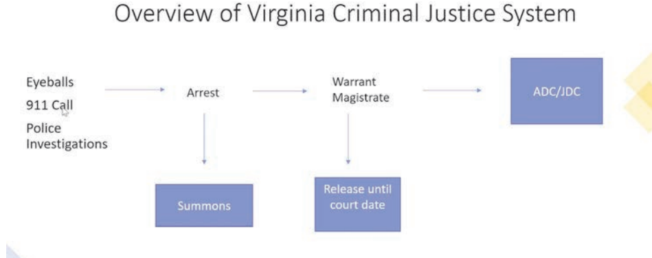
Overview of VA Criminal Justice System-Police investigate, not the Commonwealth's Attorney office.