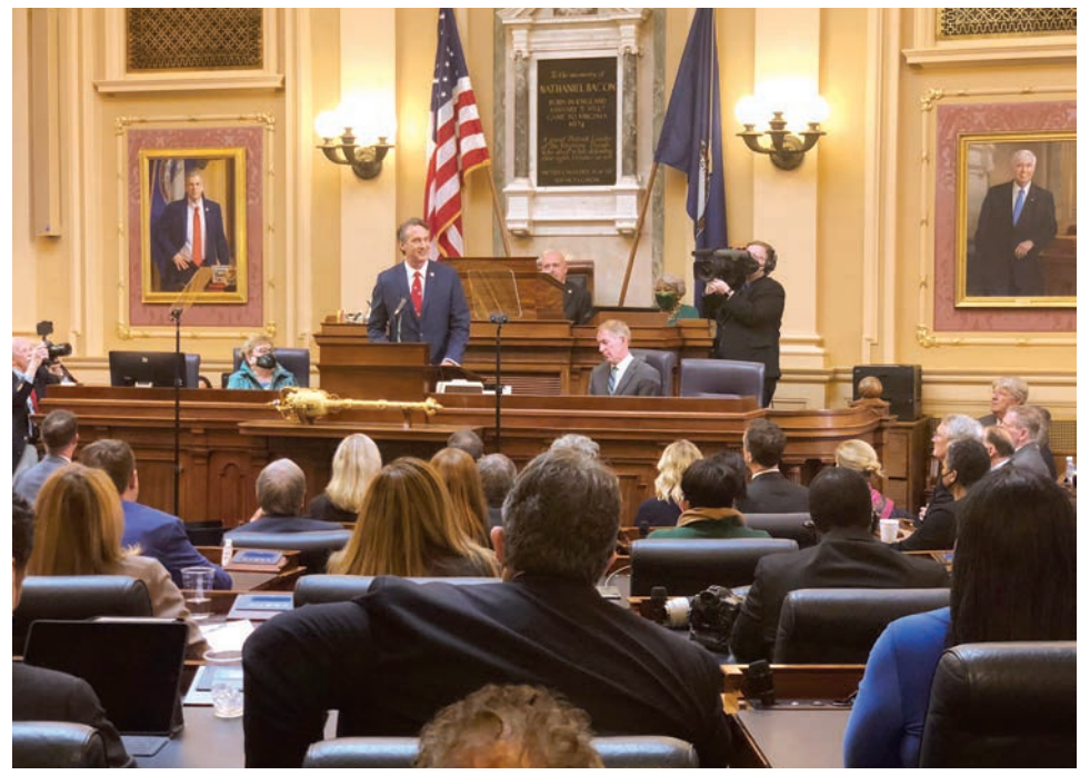
Republicans are hoping to spend $150 million to create 20 new charter schools, but they'll be facing opposition in the Senate Education Committee, which has nine Democrats and only six Republicans.