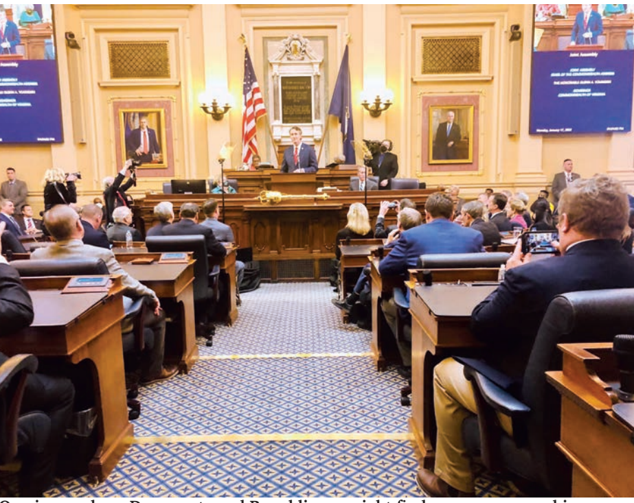
One issue where Democrats and Republicans might find common ground is banning political contributions from public utilities.