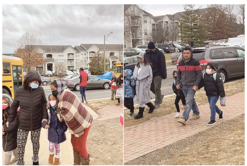
Students, parents, and guardians arrive masked at FCPS' McNair Farm Elementary School.

"I'm frustrated too. I want to see the COVID cases go down, but I also believe our responsibility is to all of our students. And