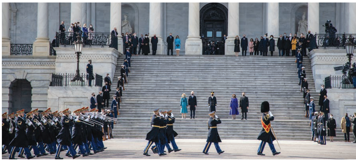
Members of the U.S. Army Band "Pershing's Own" march down Pennsylvania Avenue during the 59th Presidential Inauguration in Washington, D.C., Jan. 20, 2021. Military members from across all branches of the armed forces of the United States, including Reserve and National Guard components, provided ceremonial support and Defense Support of Civil Authorities during the inaugural period.

The band's first public performance was at an April 27, 1922 dedication of a statue of General Ulysses S. Grant at the U.S. Capitol. To travel from Fort Hunt to performance sites members had to be