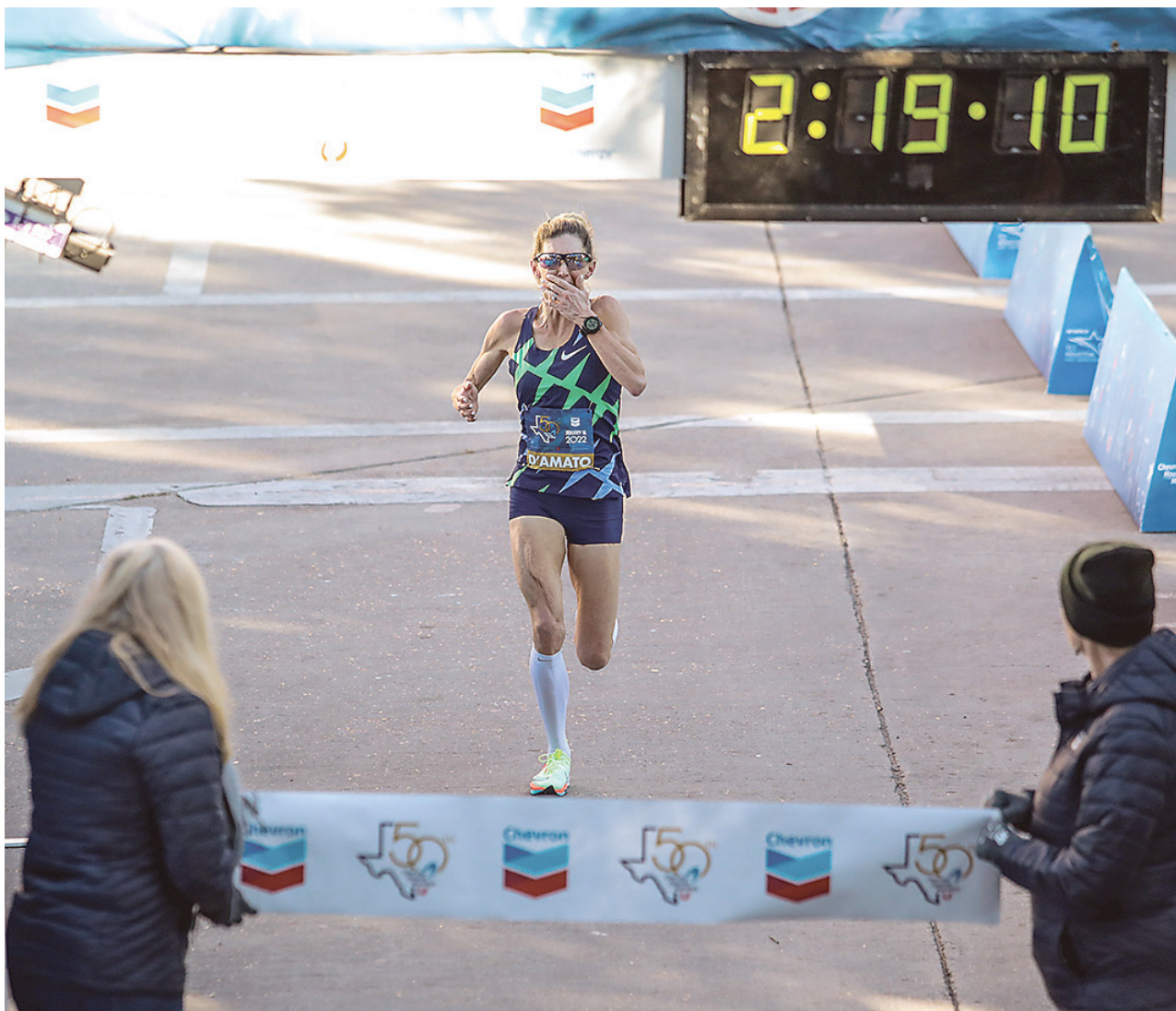
Keira (Carlstrom) D'Amato, a 37-year-old Oakton High School alumna, shattered the U.S. women's marathon record on Jan. 16 with a time of 2:19:12 at the 2022 Chevron Houston Marathon.