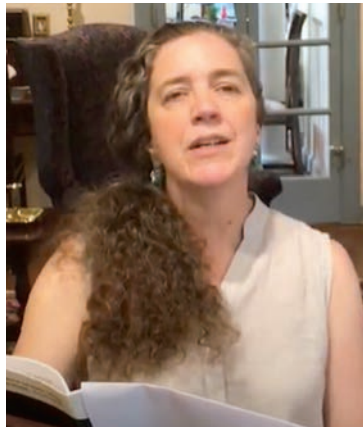
Monday Morning Music zoom classes with the focus on opera start on Jan. 31.