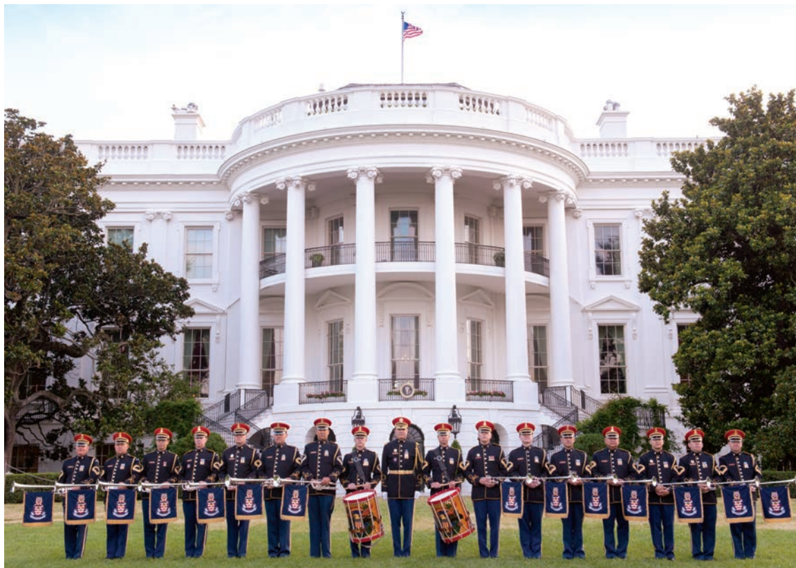
The U.S. Army Herald Trumpets pose for a photo on the White House lawn. The Herald Trumpets are The Official Fanfare Ensemble to The President of The United States.