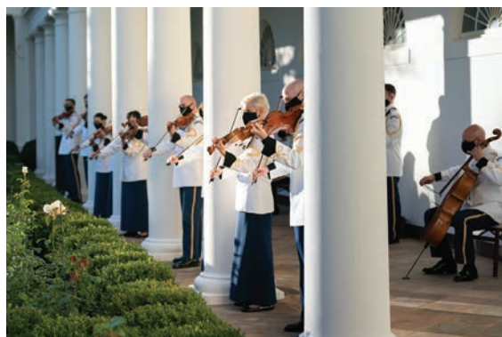
The U.S. Army Strings perform in the Rose Garden of The White House.