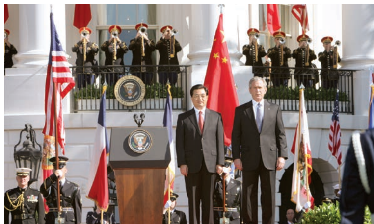
The U.S. Army Herald Trumpets for the White House arrival of Chinese President Hu Jintao with U.S. President George W. Bush.