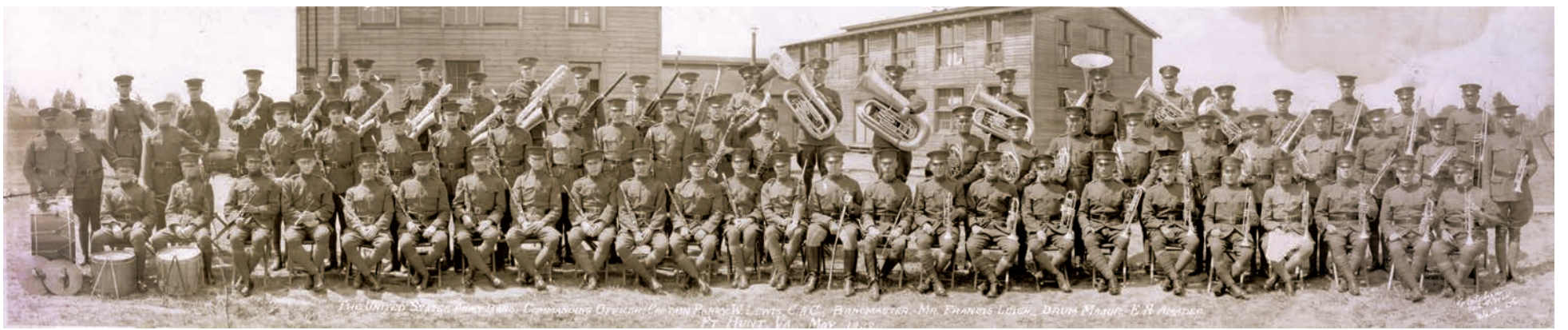
The original U.S. Army Band at Fort Hunt in 1922.