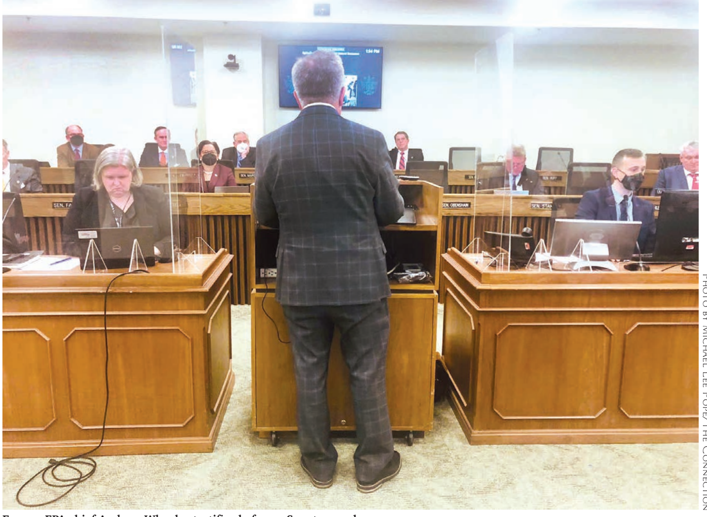
Former EPA chief Andrew Wheeler testifies before a Senate panel.

Senate Democrats are hopeful they'll be able to deny Wheeler the nomination if it gets to the Senate floor, although they have no room for error. Democrats have a one-