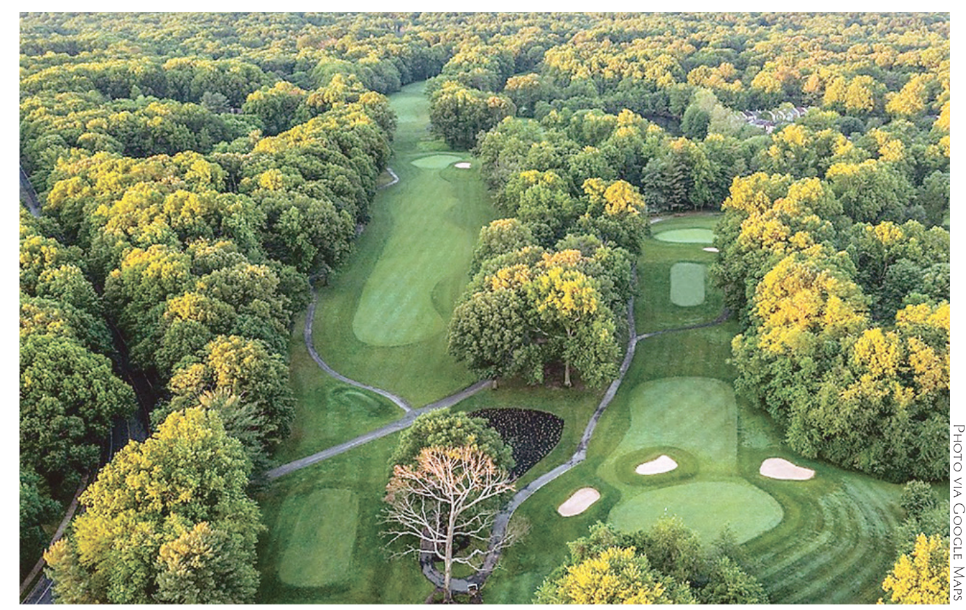
Reston National Golf Course, what will neighbors want done with it in 2022?