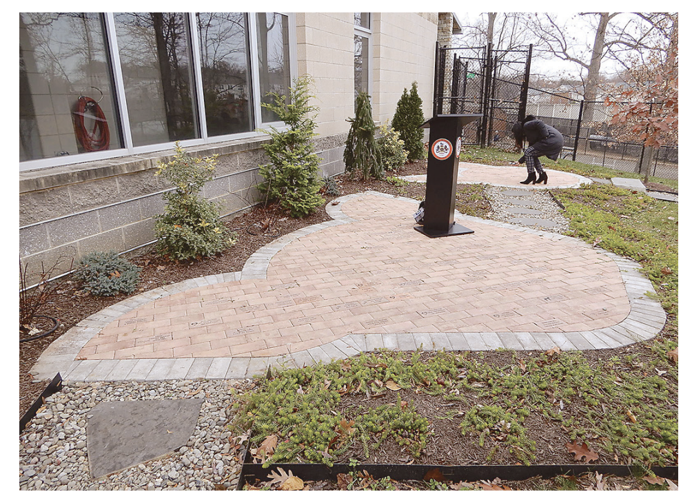
The bricks honoring D'Arcy's three dogs are at bottom of photo.