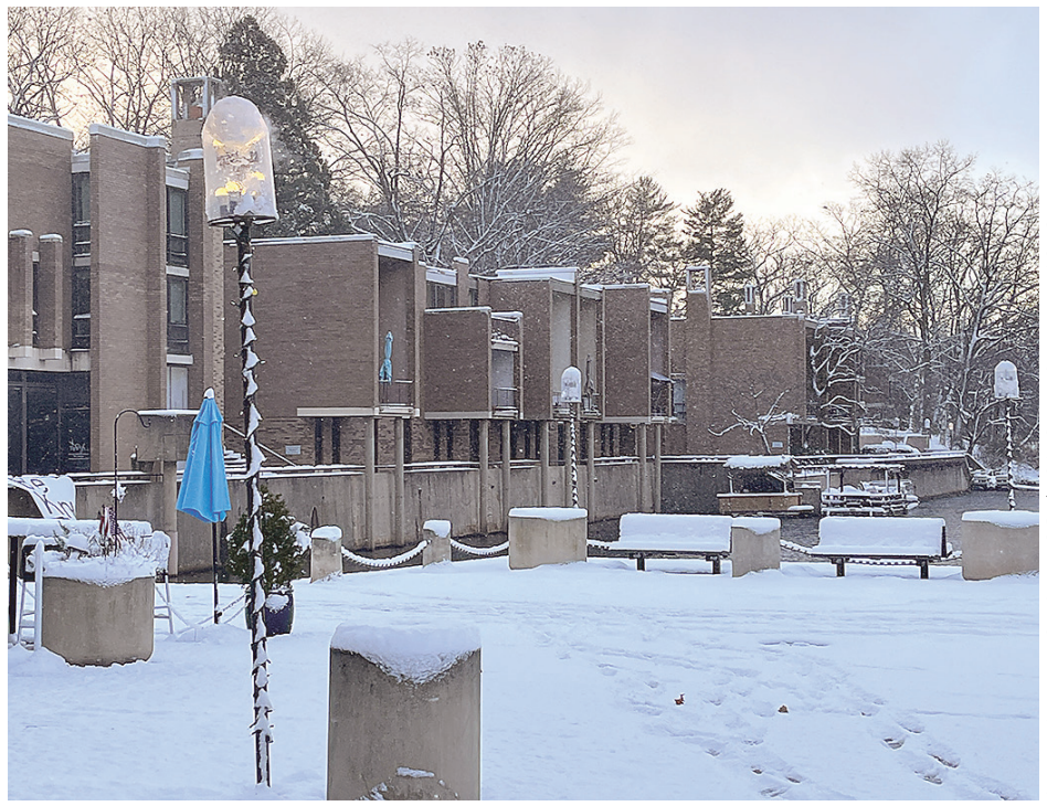
A proposed $0.250 million in Fairfax County funds is pending toward the Lake Anne Revitalization effort.