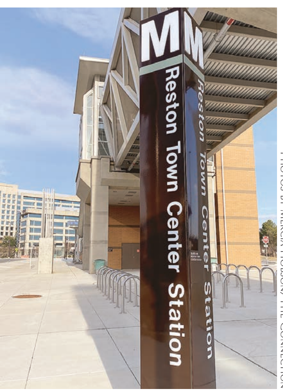
WMATA's Silver Line Phase 2 Project of the Metrorail extension- when will the 11 stations of the long-over Dulles Corridor Project be opened, including the one at Reston Town Center?