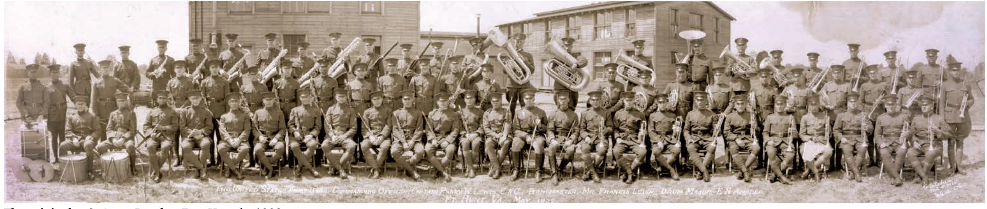
The original U.S. Army Band at Fort Hunt in 1922.