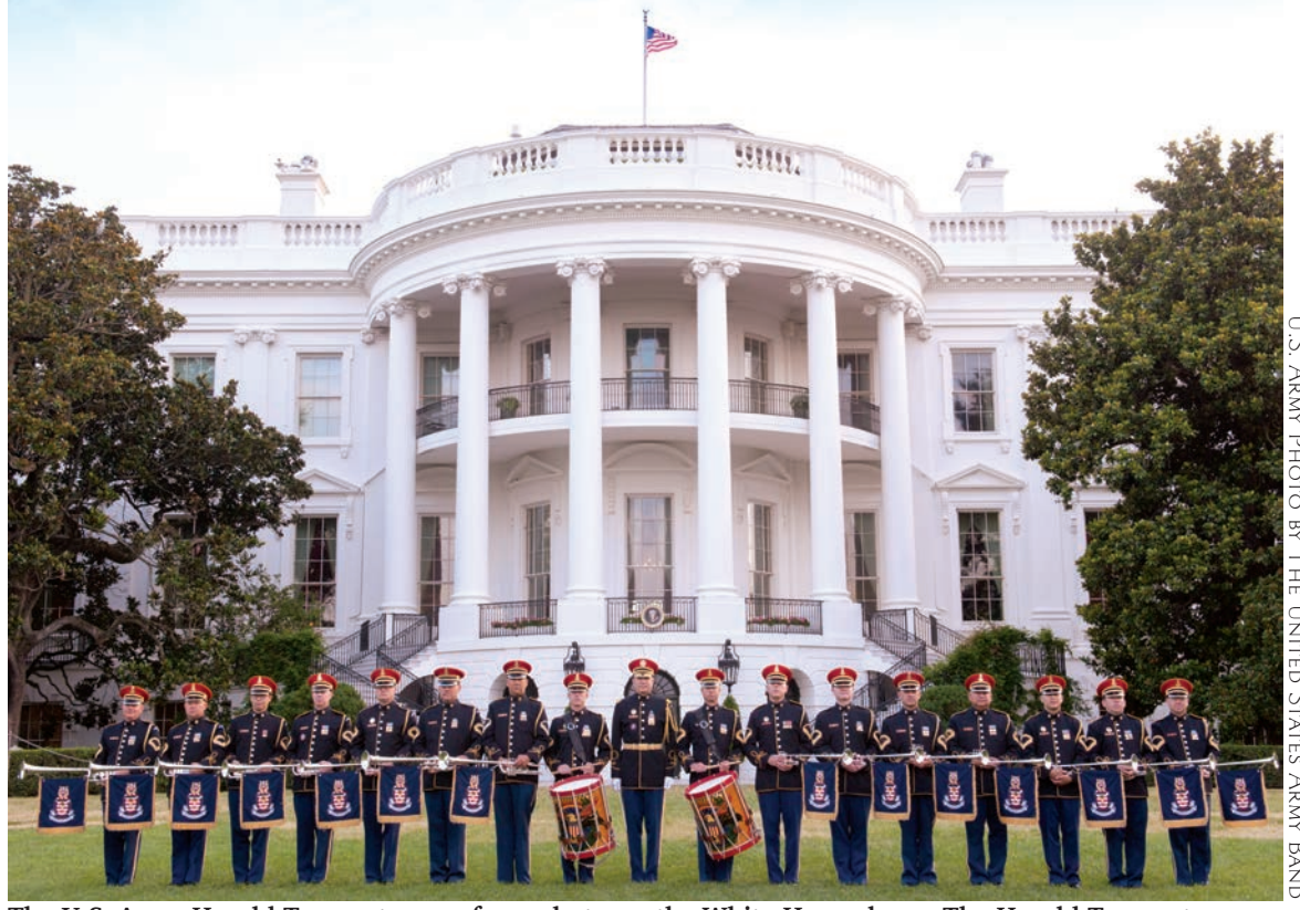
The U.S. Army Herald Trumpets on the White House lawn. The Herald Trumpets are The Official Fanfare Ensemble to The President of The United States.

"creative," Lessard says, navigating over muddy roads, using street cars and taking water taxis across the Potomac River. (The south section of the George Washington Me-6 ♦ VIENNA/OAKTON / MCLEAN CONNECTION ♦ FEBRUARY 16-22, 2022