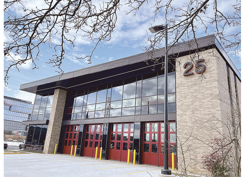
Reston, Station 25 in Reston

Arnold added that the overall impact of the change on staffing needs would be a decrease in Advanced Life Support providers per day and an increase in Basic Life Support providers per day. The transition would