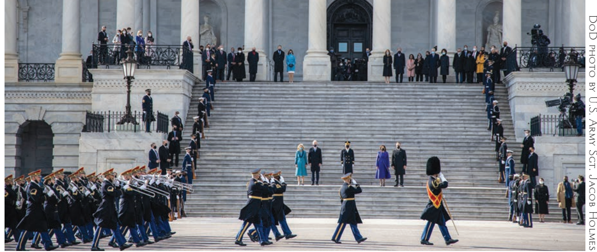
Members of the U.S. Army Band "Pershing's Own" march down Pennsylvania Avenue during the 59th Presidential Inauguration in Washington, D.C., Jan. 20, 2021. Military members from across all branches of the armed forces of the United States, including Reserve and National Guard components, provided ceremonial support and Defense Support of Civil Authorities during the inaugural period.

The band's first public performance was at an April 27, 1922 dedication of a statue of General Ulysses S. Grant at the U.S. Capitol. To travel from Fort Hunt to performance sites members had to be