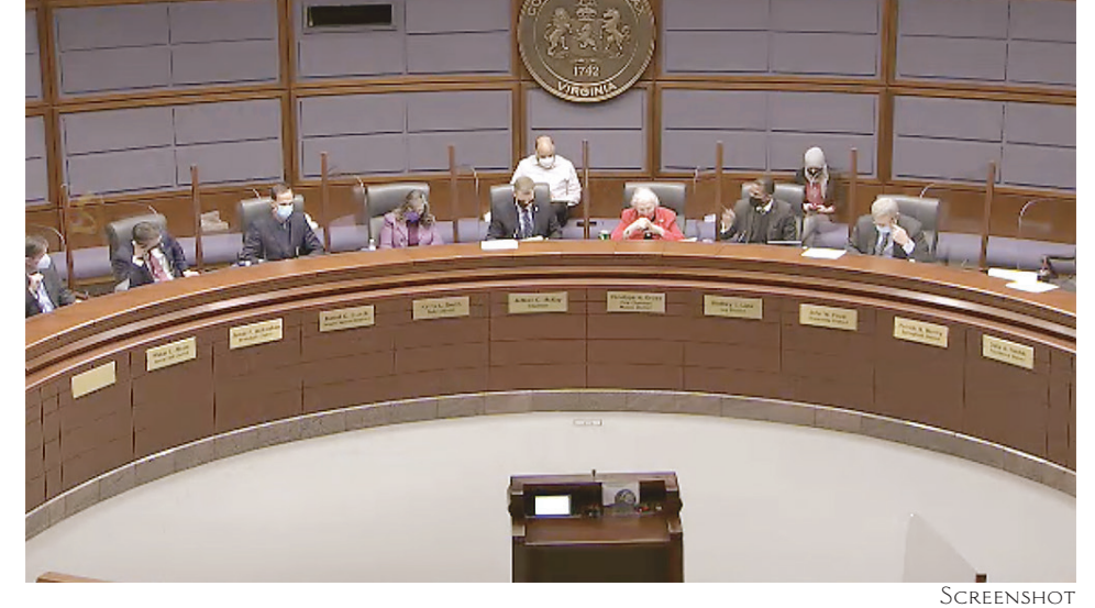
Fairfax County Board of Supervisors