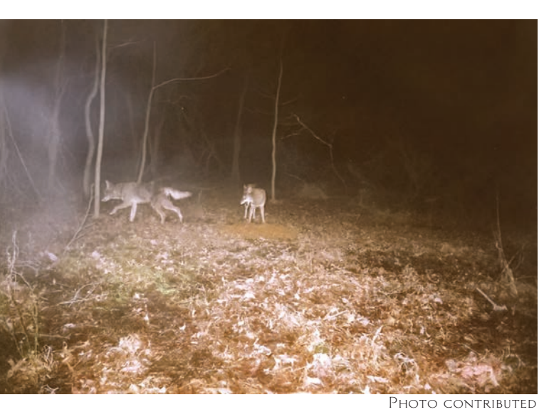
Coyotes have been seen in every part of Fairfax County.

In May 2018 Animal Protection Police Officers and the Fairfax County Wildlife Management Specialist reported that a small dog was attacked and killed in the forested area of the Parklawn community of Alexandria.