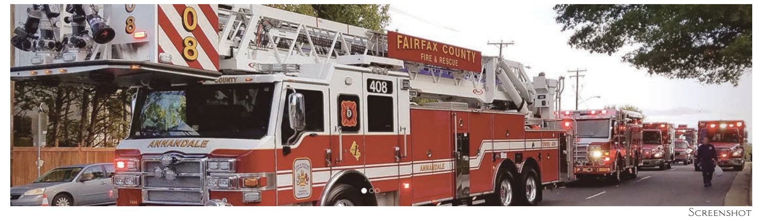
Fairfax County Fire and Rescue