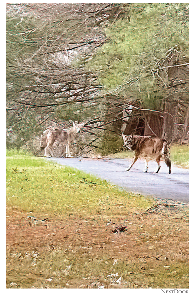
Coyotes are in every part of the area. These were near the Potomac River on the Maryland side.

"The Eastern Coyote is bigger than those in the West, about the size of a border collie or even German Shepherd, often between 45 to 55lbs, though occasionally bigger. The males are usually larger than the females. They are not only larger, but often tend to be more quiet than their western cousins, not howling as much, and often in much smaller groups. Their color can be variable as well, though they're often some shade of tan, with erect ears, bushy downward-pointing tail with a dark tip. Most have white chins as well."