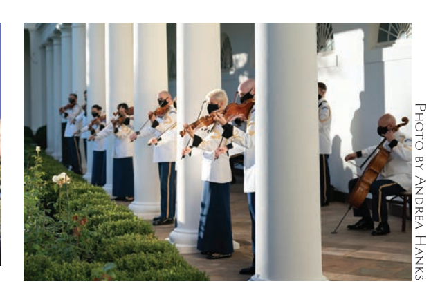
The U.S. Army Strings perform in the Rose Garden of The White House.