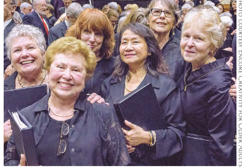
Seniors will now have access to a variety of musical opportunities.

times he spent with my mother who died years ago, that soothes him," she said. "My parents loved