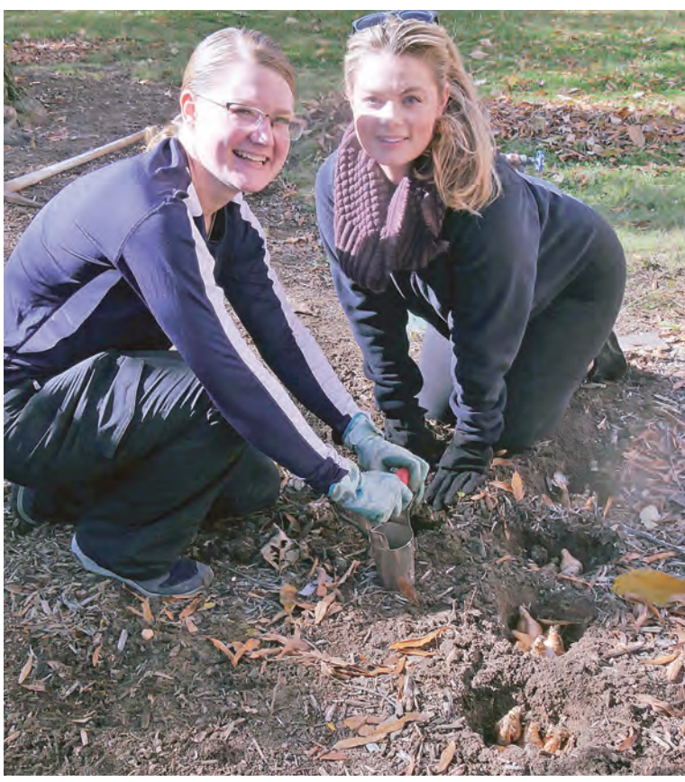
Volunteers from McLean Bible Church at Tysons help plant 5,000 daffodils at Culpepper Garden in the fall of 2021.

The next step is Woodland Walk to connect the trails and complete the walking loop. Future plans include a koi pond, additional pavilions, picnic tables, and bird feeders www.ConnectionNewspapers.com