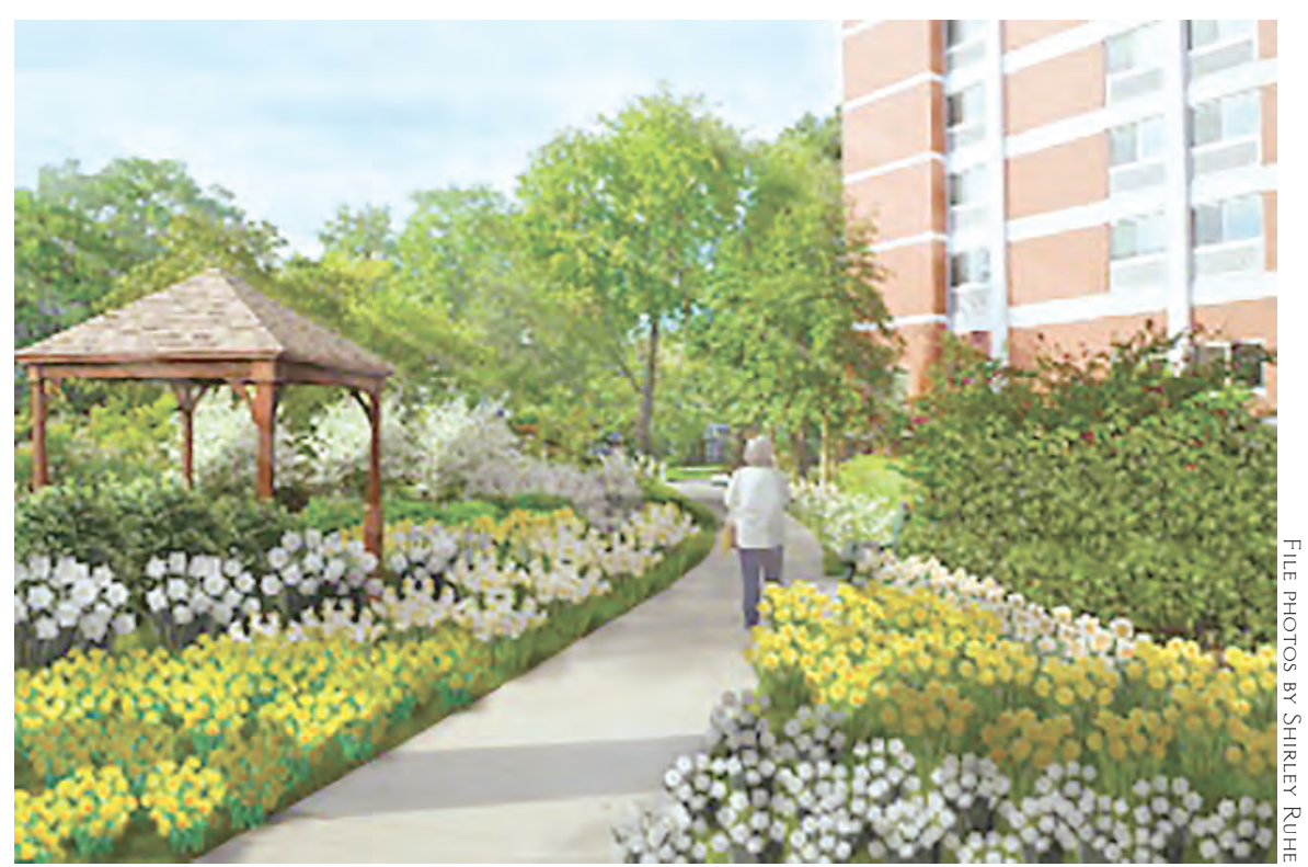
Rendering of planned transformation of Culpepper Garden.