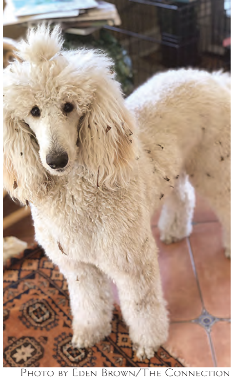
Juno's daughter, Strawberry, is allegedly a show dog and keeping her coat clean, debris free, and unmatted, is a high priority ... but not for Strawberry, who, having grown up with eight brothers, is more of a tom boy than a princess.