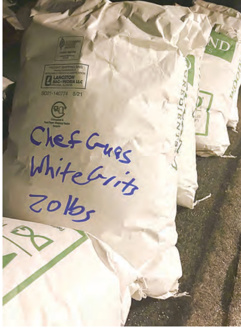
David Guas picks up specially ground corn meal from the historic gristmill at Mount

Turns out back then they soaked the cornmeal in hot water for two days at room temperature, which produced the leavening, then whisked in a little flour, egg. "Not really a recipe." They gave me a U shape of cinder blocks with paper