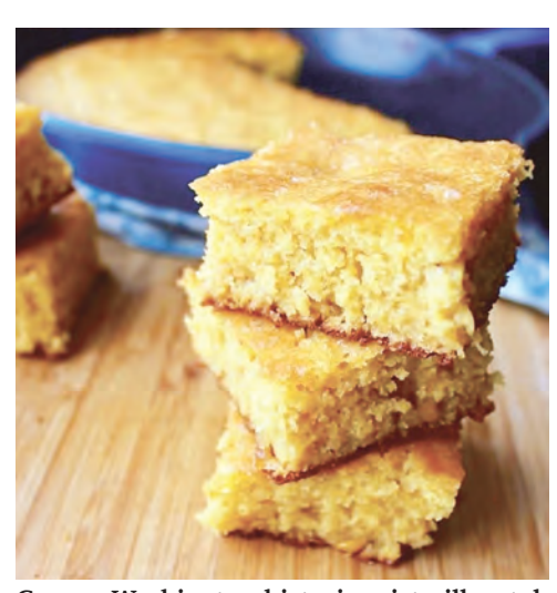
George Washington historic gristmill, established in 1791, produces cornmeal and grits for the specialties at Bayou Bakery, Coffee Bar and Eatery in Arlington.

and matches to cook them rotating over coals on an open flame fire. "It was the most primitive. Good thing