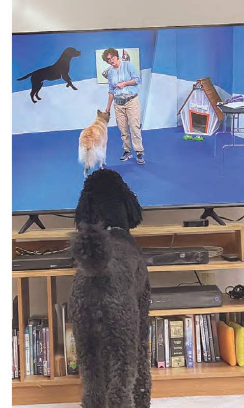
Dax loves to watch TV, and sits rapt when the instructive dog training program comes on. He never gets tired of hearing