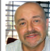
Kyle Knight Ins Agcy Inc Kyle Knight, Agent 11736 Bowman Green Drive Reston, VA 20190

ACROSS FROM RESTON TOWN CTR WWW.KYLEKNIGHT.ORG 703-435-2300