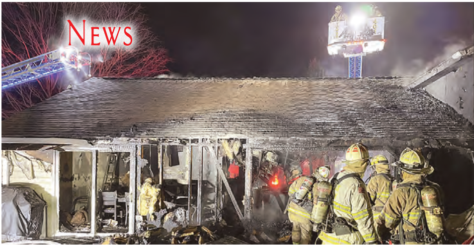
Fire investigators determined that improperly discarded ashes from an outdoor fire pit caused this house fire in the Wolf Trap neighborhood.