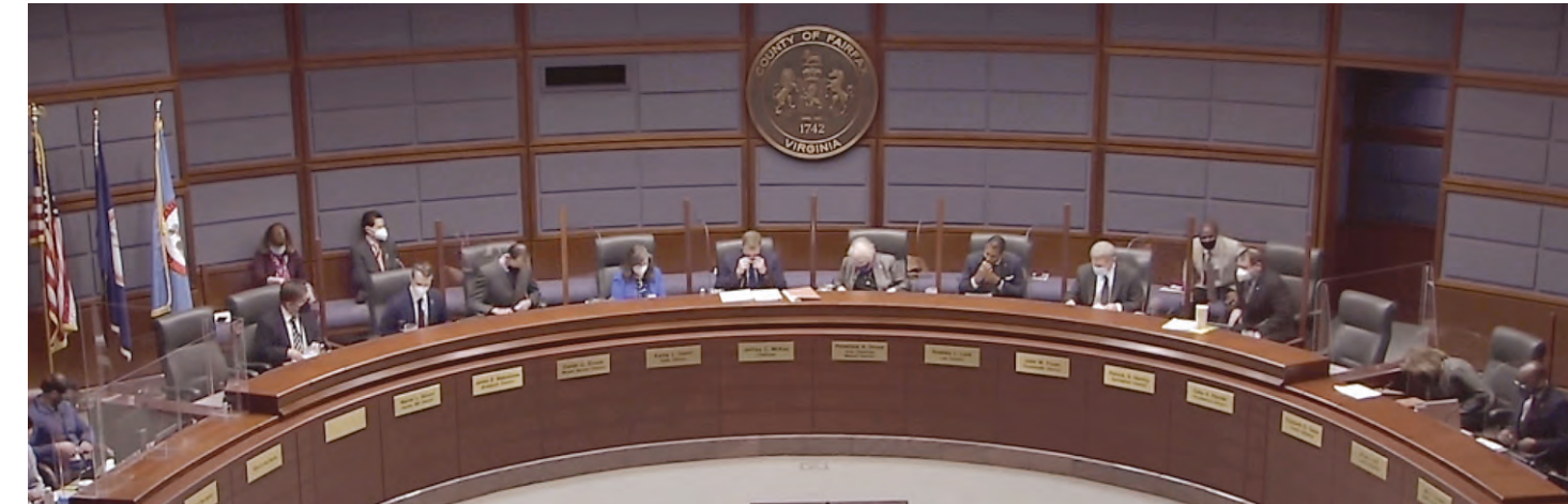
Fairfax County Board of Supervisors listen to the County Executive Bryan Hill's presentation of the FY 2023 Advertised Budget. It is a proposal and not the final adopted budget.

The proposed budget prioritized compensation for county and Fairfax County Public www.ConnectionNewspapers.com