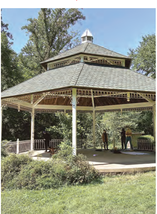
What is the McLean Central Park Development Plan? Attend the Wednesday, March 2 virtual meeting, phone or listen to the recording.