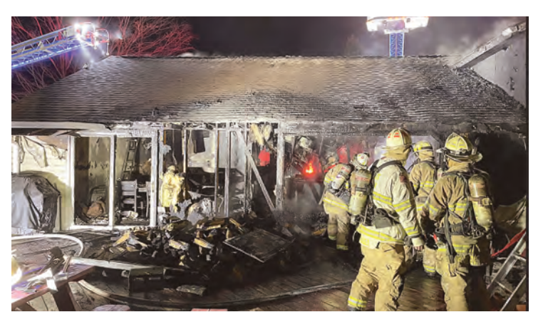
Fire investigators determined that improperly discarded ashes from an outdoor fire pit caused this house fire in the Wolf Trap neighborhood.