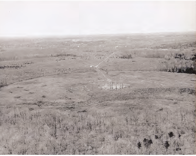
Huntley Meadows Park