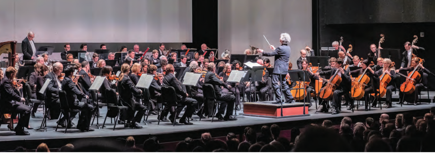
The Fairfax Symphony Orchestra will perform on Saturday, March 12, 2022 at GMU Center for the Arts in Fairfax.

History in Kitchen. 10:30-11:15 a.m. Virtual. At Gunston Hall in Lorton. This free and virtual three-part series will illuminate what kinds of