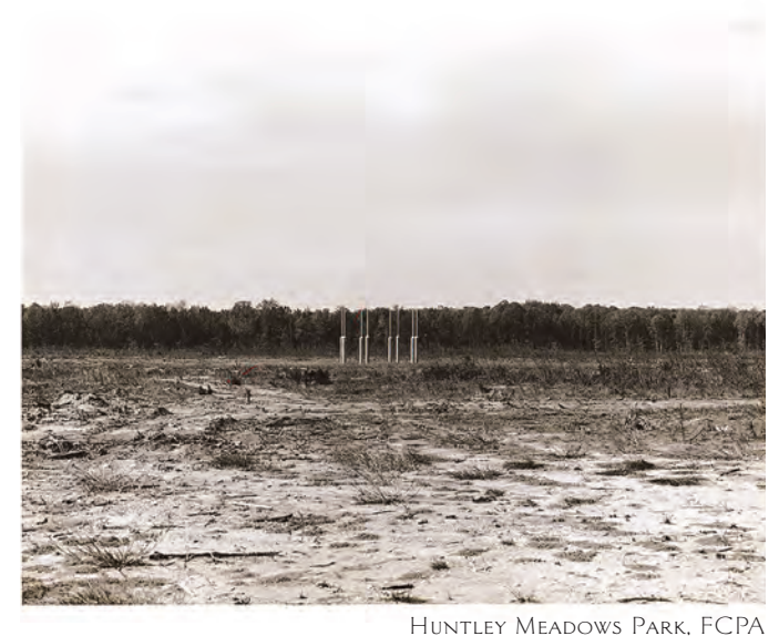
Ground-level view of antenna array at Hybla Valley Field Station, 1958. Today, this is the central wetland at Huntley Meadows Park."