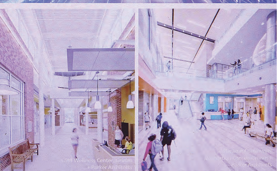
Artist's renditions of possible areas shared by the community and senior centers.

Similarly, the Green Acres Center on Sideburn Road was built as an elementary school in 1961 and houses the City's senior center. But it needs significant renovations for accessibility, operation and the additional amenities residents want.