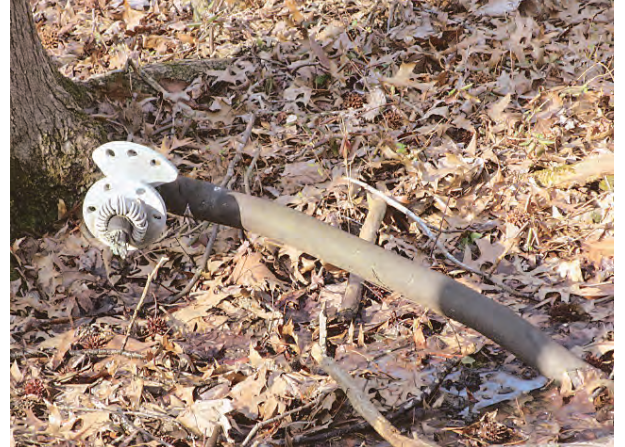
Wires bundled in rubber tubes protrude from the forest floor today, left by the communications work and research.

The trail on the west side of the park. Cheryl Repetti said that the forest is "young," that most of the trees were not present when the communications, satellite and road work were done in the park.