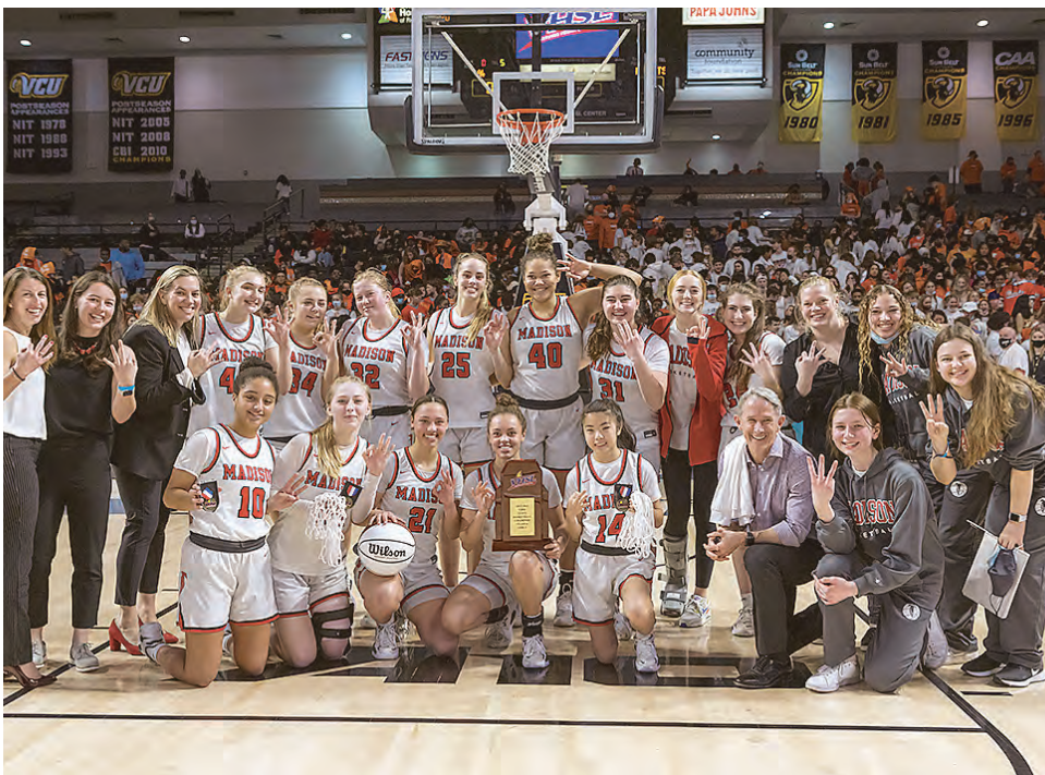
The Madison Warhawks won their 3rd consecutive girls Virginia State Championship, defeating Osbourn Park at the Siegel Center in Richmond Virginia