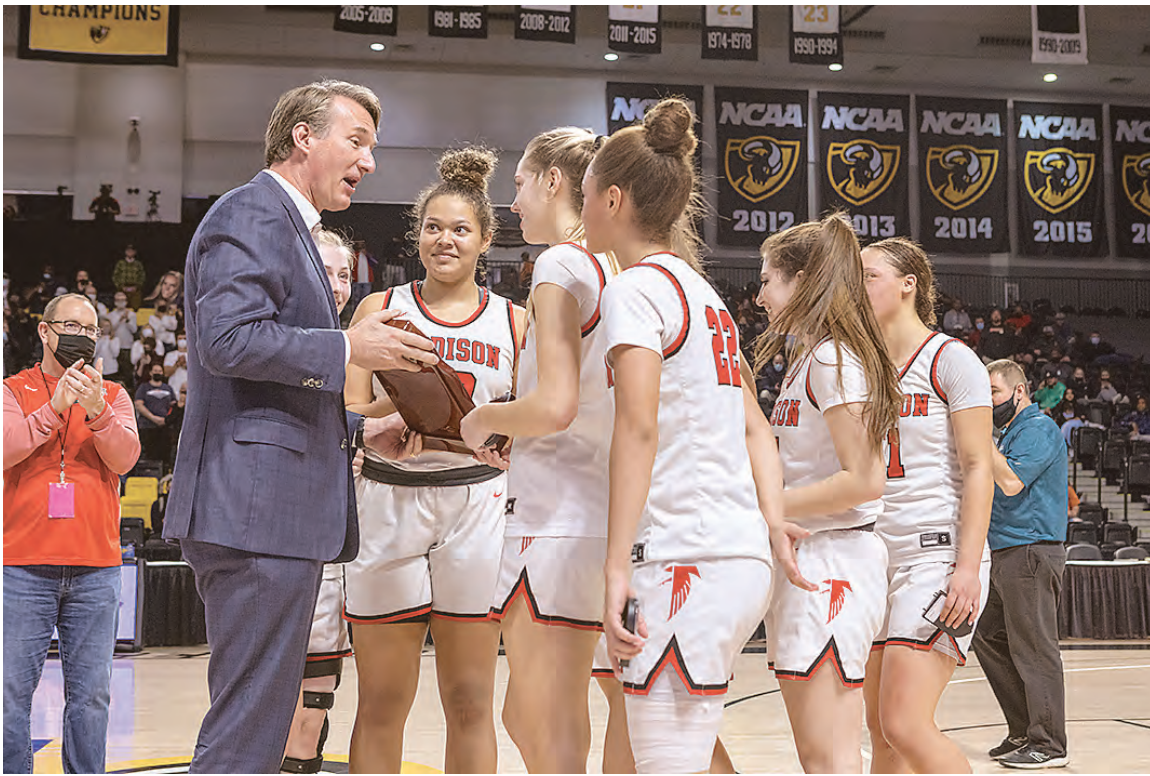
Virginia Gov. Glenn Youngkin presents the Madison Warhawks the Virginia Class 6 Championship Trophy.