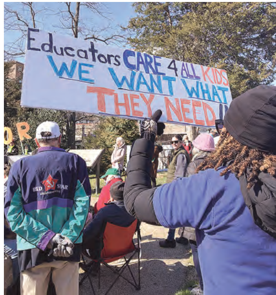
One sign at the protest. The event brought together almost 200 parents, students, and teachers. Teachers’ consistent theme: educators care for all students; teachers are not threats but part of the support structure kids need.