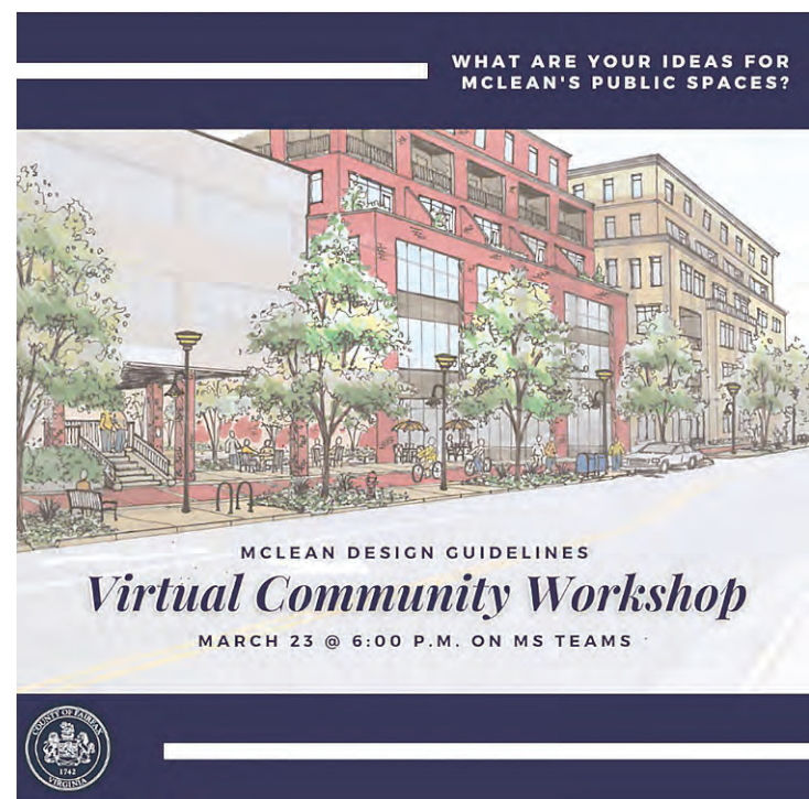
CONCEPT DRAWINGS VIA FAIRFAX COUNTY PLANNING Renderings for possible design of streets, lighting, and public areas in front of buildings in the McLean Commercial Revitalization District.