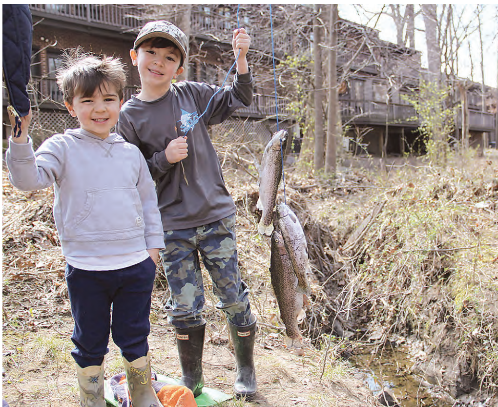
The Annual Kids' Trout Fishing Derby will take place Saturday, March 19, 2022 in Herndon.

Super Pet Expo. At Dulles Expo Center, 4320 Chantilly Shopping Center, Chantilly. Dogs, cats, Champion Trainer, hermit crabs and reptiles will highlight this show. Cool Zoo, an interactive and educational wildlife travel exhibit, which features hands-on encounters with exotic animals, will be featured. Their exhibit features a variety of activities like learning about rescued Hermit Crabs, strolling through a Butterfly Exhibit, interacting with a giant tortoise, and watching an educational exotic bird show. Friday, March 18 – 3-8 p.m.; Saturday, March 19 – 10 a.m.-7 p.m.; Sunday, March 20 – 10 a.m. – 5 p.m. Admission: Adults $15; Children aged 4-12; $10, age 3 and under, free. Visit: http://coolzoo.org/ Tickets: www.superpetexpo.com .