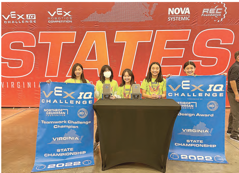
McLean-area all-girls robotic team wins Virginia competition.