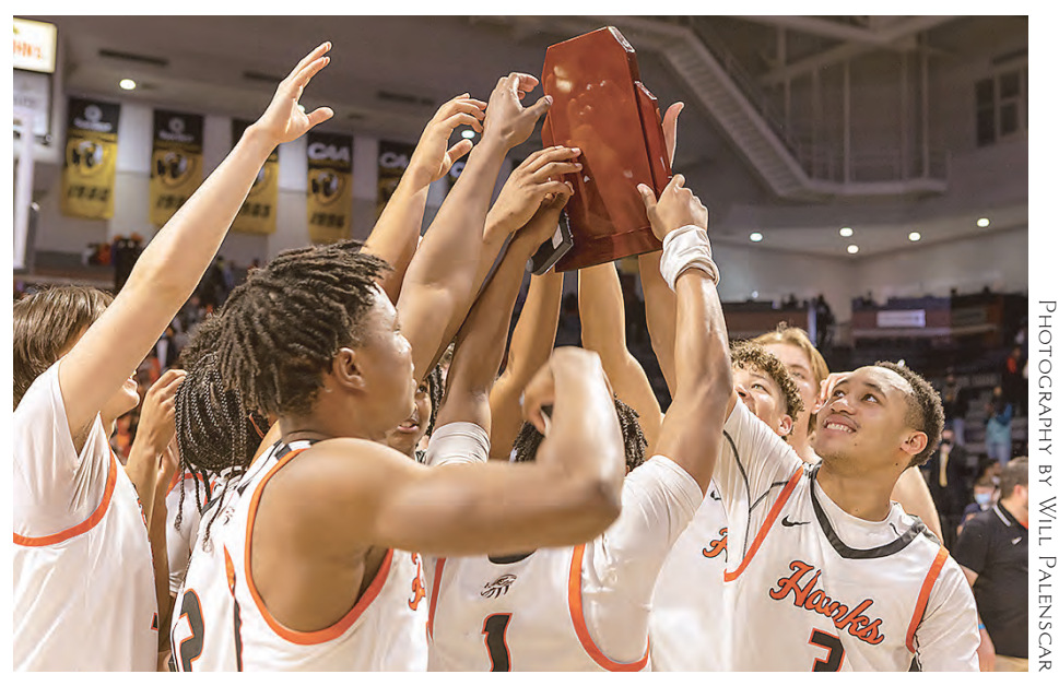
The Hayfield Hawks hold up the school's first basketball State Championship after defeating Battlefield 67-47.