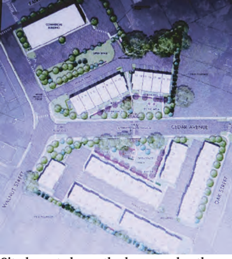
Site layout shows the homes, plus the commercial portion at top left.

"The applicant wants occupancy of all residential units [allowed] before development of the commercial building," said Frederick. "The City ordinance says no more than 66 percent." However, he said Pulte committed to limiting the types and intensity of the commercial uses and will make a voluntary contribution of $417, 524 to the City's Affordable Housing Trust Fund.