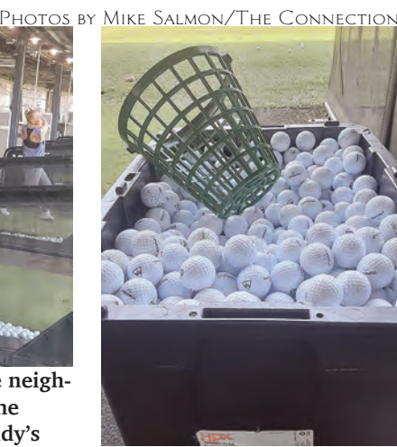
Plenty of golf balls at Rudy's.