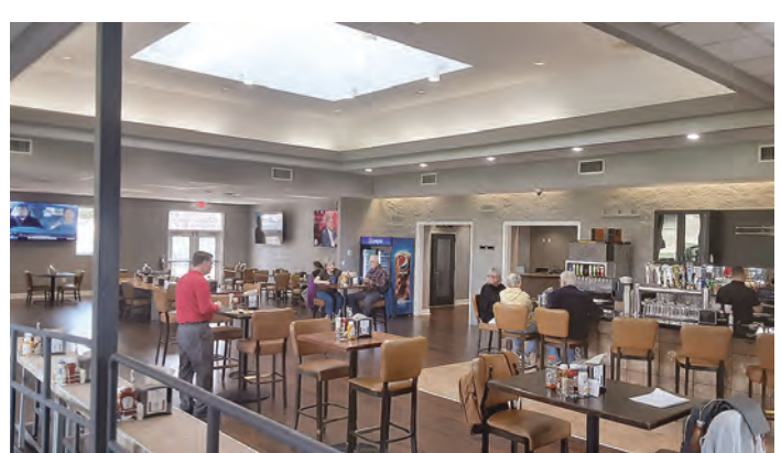
Inside there is a restaurant space, big-screen televisions and a bar.