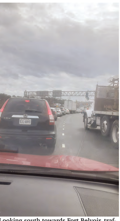
Looking south towards Fort Belvoir, traffic coming off the Fairfax County Parkway or I-95 south bunches up here at the intersection with Loisdale Road.

The spot was also on VDOT's "Fairfax County Parkway & Franconia-Springfield Parkway Corridor Study," and it identified the area for future improvements. Interstate 95 takes on much of the east coast traffic in the country so there are other spots that are targets for improvements in the corridor, and these may have priority. The department is in the process of wrapping up studies at two other locations - the Exit 160