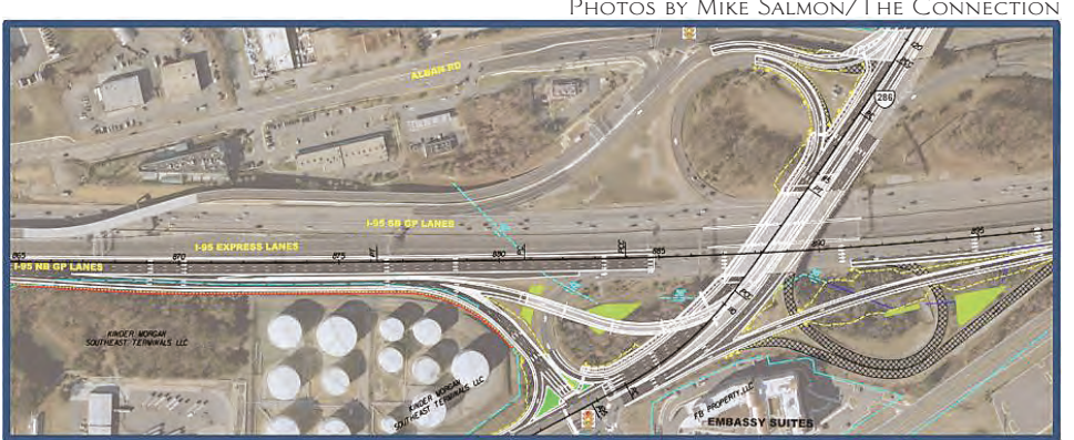
There is a plan but no solid time frame, although traffic is increasing with the decline of the pandemic.

According to VDOT, "that location of I-95 was identified as an area with numerous performance issues in the top 25% for the