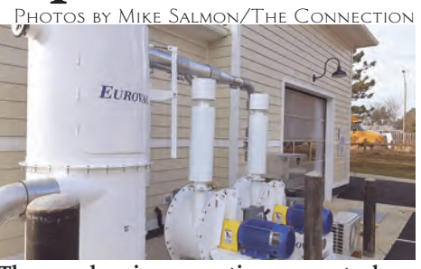
The car cleaning operation uses a technological approach.

take shape over the last few months. "I think chester Lakes shopping center that has the White Horse plans to employ a lot of stu- 10 & Burke / Fairfax / Fairfax Station/Clifton/Lorton / Springfield & March 17-23, 2022