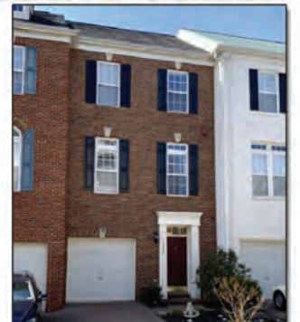
Alexandria • Cameron Station • $729,900 SOLD $60,000 ABOVE LIST!