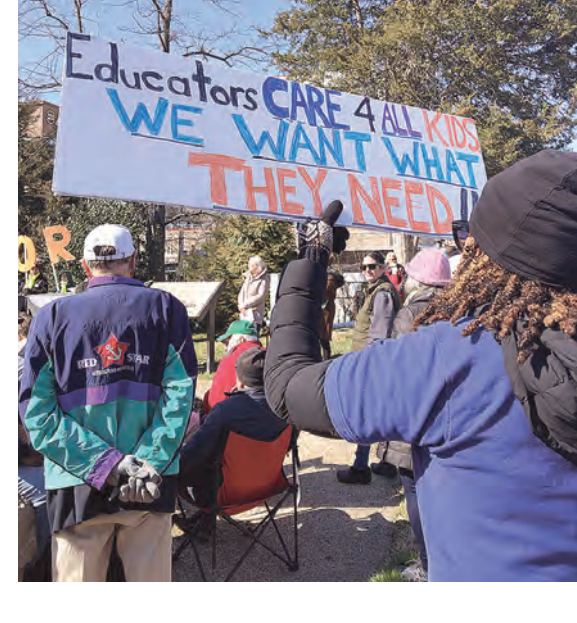
One sign at the protest. The event brought together almost 200 parents, students, and teachers. Teachers' consistent theme: educators care for all students; teachers are not threats but part of the support structure kids need.