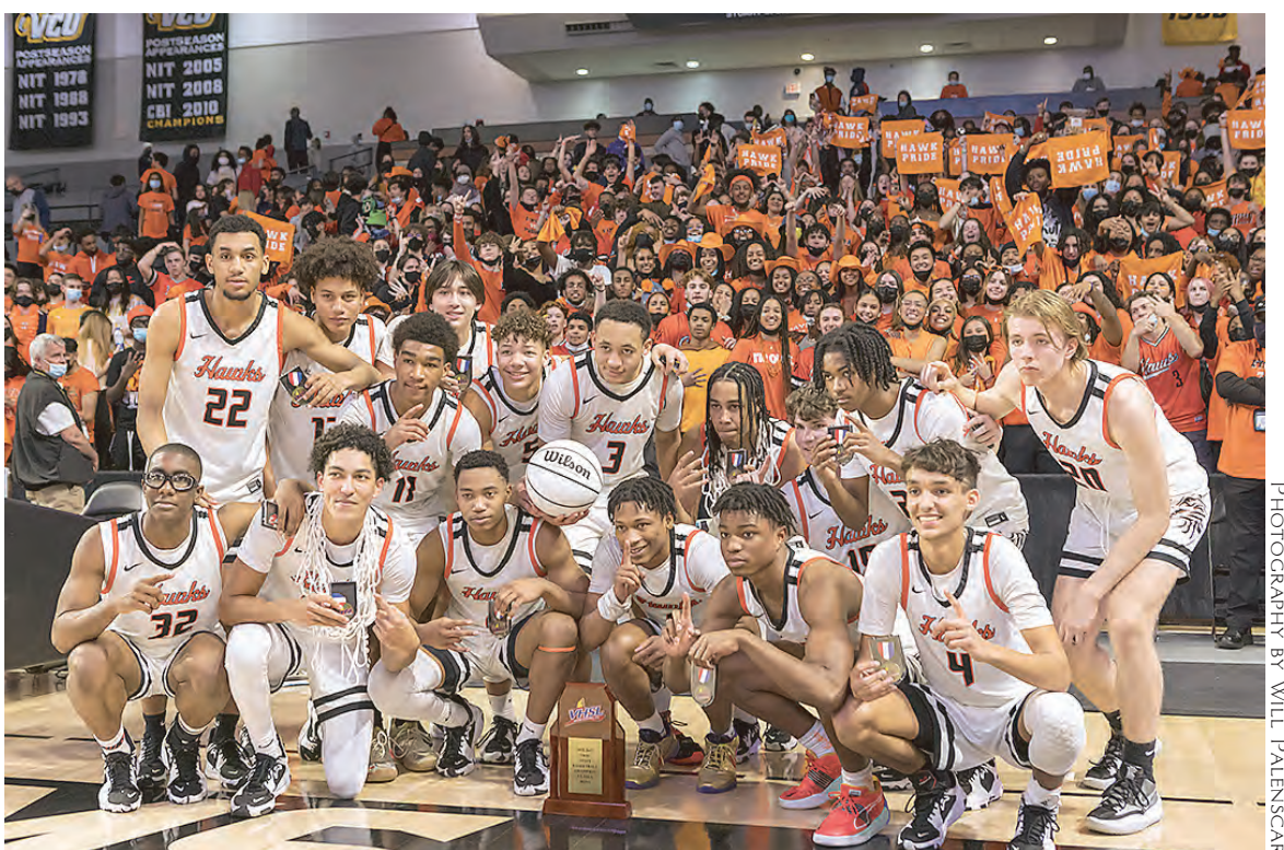
The Hayfield Hawks complete their season undefeated at 32-0 after a 67-47 win over Battlefield for the school's first state championship in basketball

Hayfield Hawks complete their season undefeated at 32-0 after a 67-47 win over Battlefield for the schools first state championship in basketball.