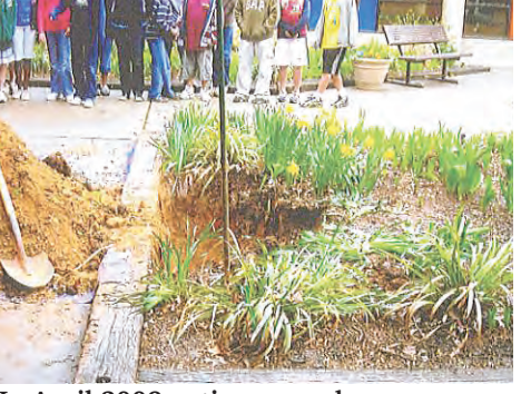
In April 2009, a time capsule was supposed to be dug up at Terra Centre Elementary School so the shovels came out but in the end, no capsule could be found.

At Terra Centre elementary school, everyone gathered on April 2, 2009 where