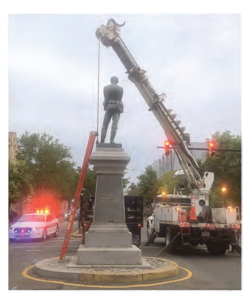
More than 30 years ago, a car hit this statue, uncovering the time capsule which was taken by a bystander, but eventually recovered by officials.

It seems if there's a place rich in history, it's rich in time capsules too and the City of