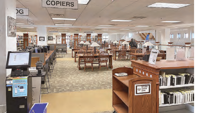
Any copies needed require a credit card.

month. Crafters will make and take home paper money after creating their own design and colors. No