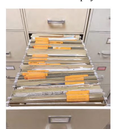
The first set of files in this drawer is "Myths and Legends," like the Bunnyman Bridge for example.

The Virginia Room is on the second floor of The City of Fairfax Regional Library. 10360 North Street Fairfax, VA, 22030-2514 703-293-6227 option 6 TTY: 711 Send an email to va room@ fairfaxcounty.gov