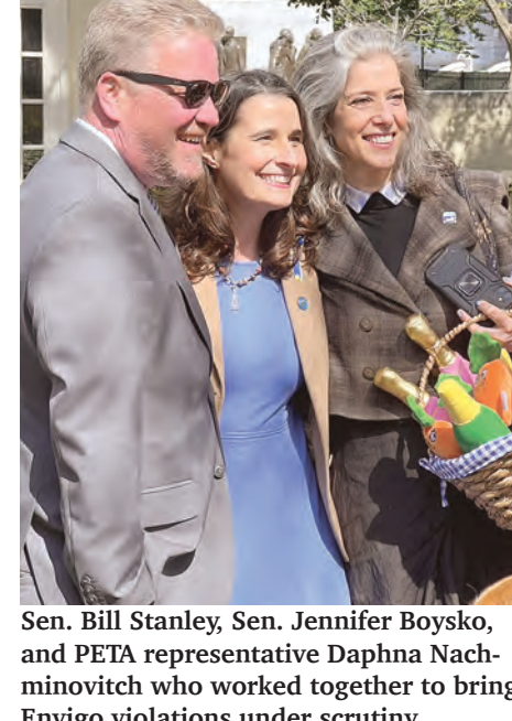
minovitch who worked together to bring Envigo violations under scrutiny.