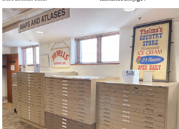
The authentic signs set the mood for historical research.

The Virginia Room is on the second floor of The City of Fairfax Regional Library. 10360 North Street Fairfax, VA, 22030-2514 703-293-6227 option 6 TTY: 711 Send an email to va room@ fairfaxcounty.gov