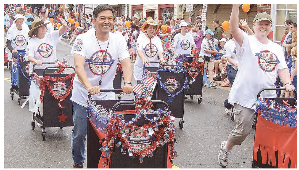
Fairfax Library's Precision Book Cart Drill Team is always a crowd-pleaser in the City's annual, Fourth of July parade.

The City of Fairfax Regional Library has now been at 10360 North St. since 2008.