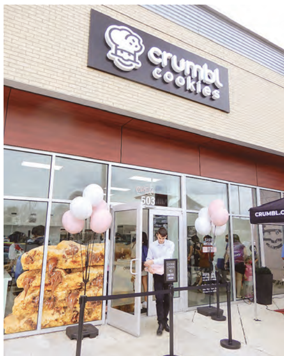
Crumbl Cookies, 14337 Newbrook Drive in Chantilly.

What sets Crumbl apart from other snack spots, said