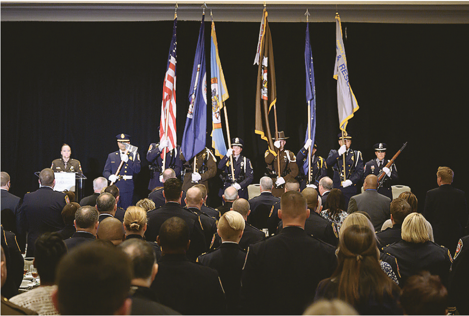
Posting of the Colors at the 44th Annual Fairfax County Valor Awards.