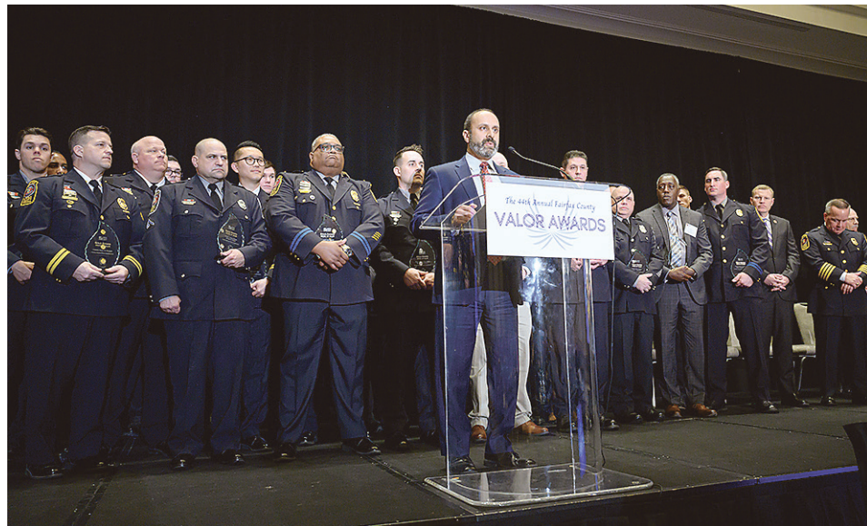
Recipients of the Gold Award Medal of Valor.

8 ♦ OAK HILL/HERNDON / RESTON / CHANTILLY CONNECTION / CENTRE VIEW ♦ APRIL 6-12, 2022