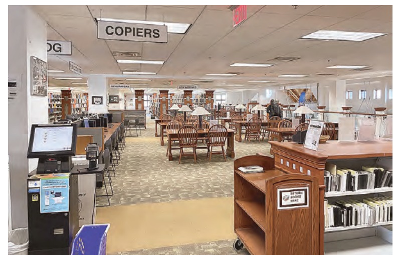
Any copies needed require a credit card.

The Virginia Room is on the second floor of The City of Fairfax Regional Library. 10360 North Street Fairfax, VA, 22030-2514 703-293-6227 option 6 TTY: 711 Send an email to va_room@fairfaxcounty.gov