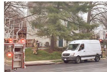
Firefighters on the scene of the Chantilly townhouse fire.

Two people were home at the time of the fire, which they discov-