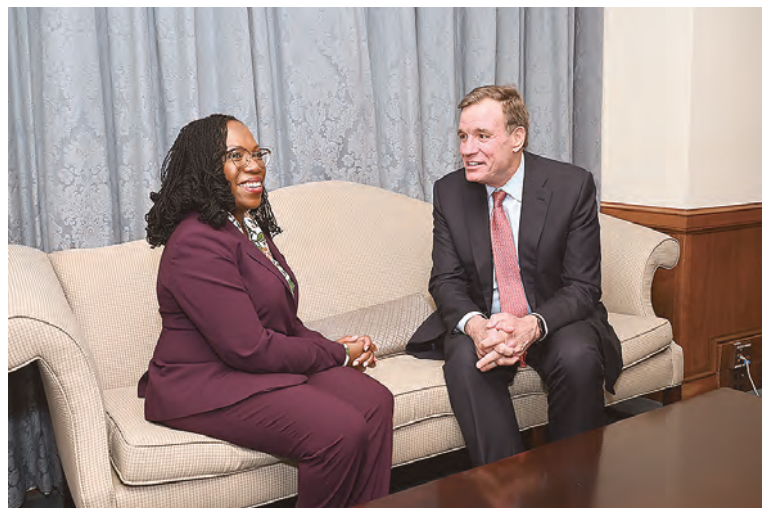
U.S. Sen. Mark R. Warner (D-VA) said he intends to support Judge Ketanji Brown Jackson's nomination to the Supreme Court.

The devil is in the details as is the case in many proposals, and the Governor needs to consider those details and give the General Assembly the opportunity to pass a responsible budget.