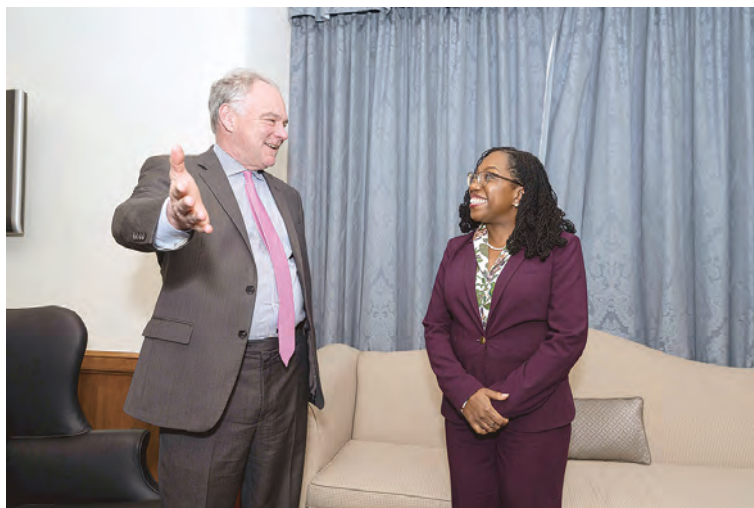
On Monday, April 4, Sen. Tim Kaine met with President Joe Biden's Supreme Court nominee Judge Ketanji Brown Jackson, who would be the first Black woman to serve on the Supreme Court if confirmed.