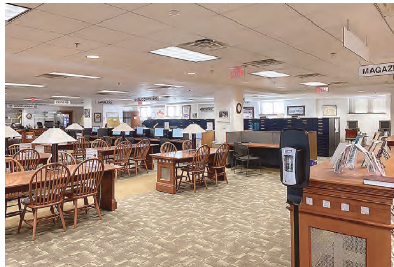
A view from the front desk shows the overhead directional signs.

to the fact that it is open to the first floor. There are sections for periodicals, microfilm and historical books. The room is decorated by historical signs hanging on the walls to give a real historic feel for the place, including Thelma's Ice Cream from Great Falls.