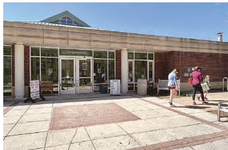
The day before the start of National Library Week, Sunday, April 3 through Saturday, April 9, families stop by the Great Falls Library.