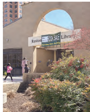
The day before the start of National Library Week, Sunday, April 3 through Saturday, April 9, families flock to the Reston Regional Library for its Friends of the Reston Regional Library 2022 Spring Kids, Young Adults, and Educators Sale.