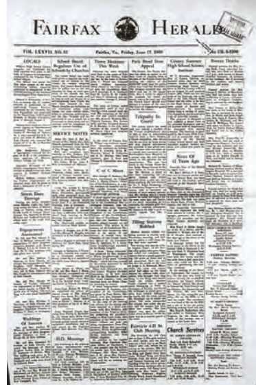
Restoring the Fairfax Herald is one of the more recent projects.