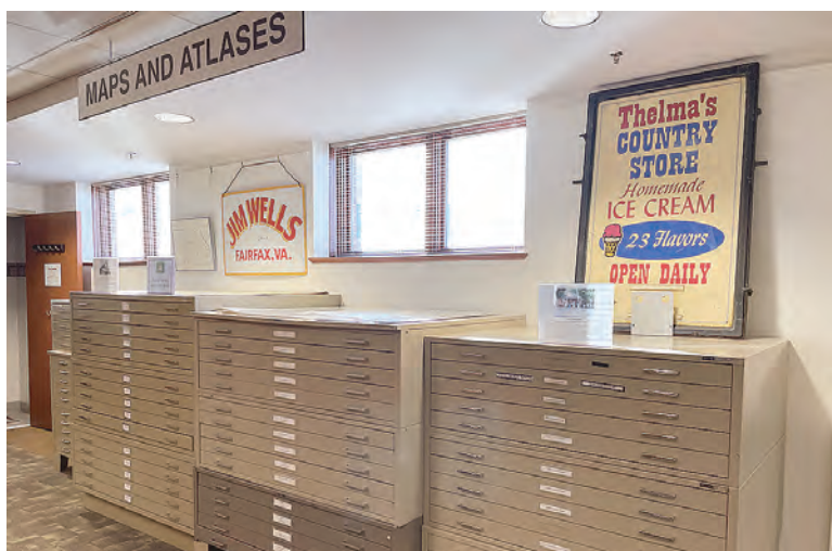
The authentic signs set the mood for historical research.

6 ♦ OAK HILL/HERNDON / RESTON / CHANTILLY CONNECTION / CENTRE VIEW ♦ APRIL 6-12, 2022