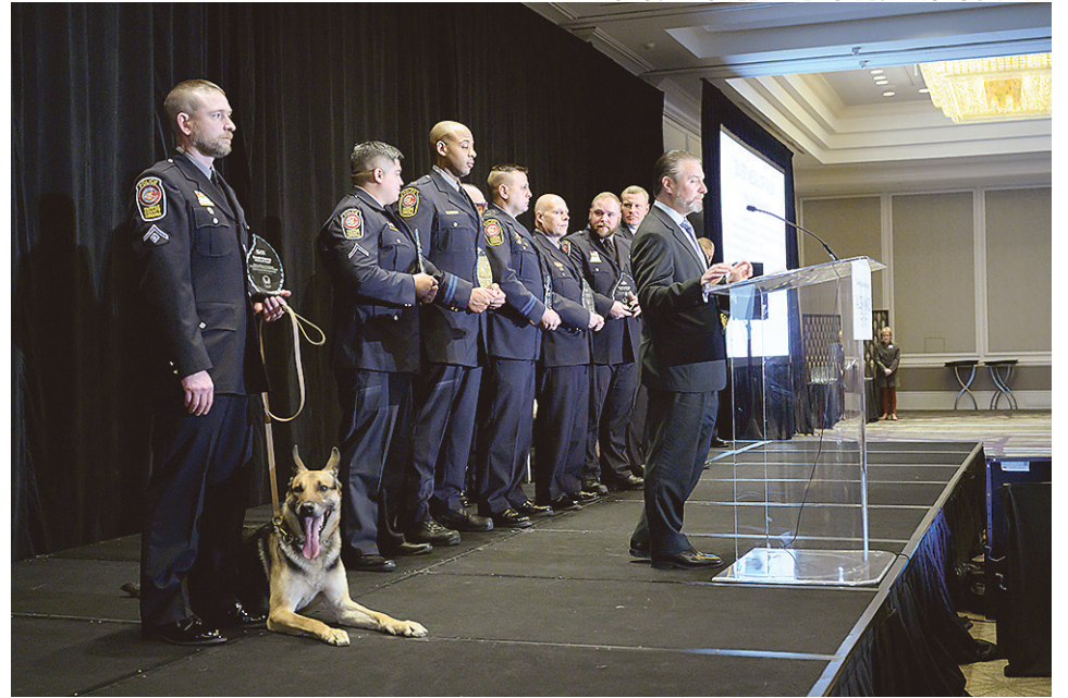
Recipients of the Silver Award Medal of Valor.