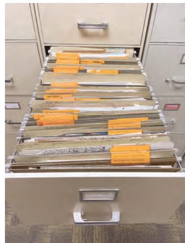
The first set of files in this drawer is "Myths and Legends," like the Bunynman Bridge for example.

The Virginia Room is on the second floor of The City of Fairfax Regional Library. 10360 North Street Fairfax, VA, 22030-2514 703-293-6227 option 6 TTY: 711 Send an email to va_room@fairfaxcounty.gov