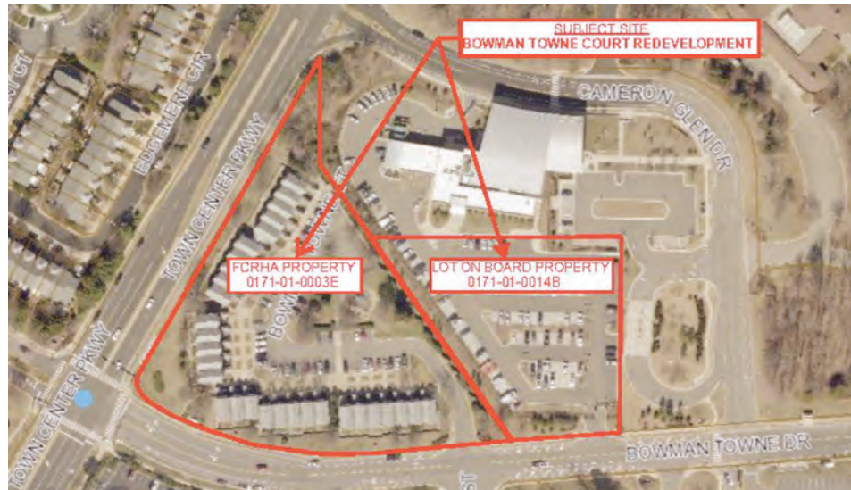
Fairfax County Redevelopment and Housing Authority has issued a request for competing proposals for simultaneous consideration for the project, Bowman Towne Court, which will include the design and development of affordable housing and a branch of the Fairfax County Public Library.