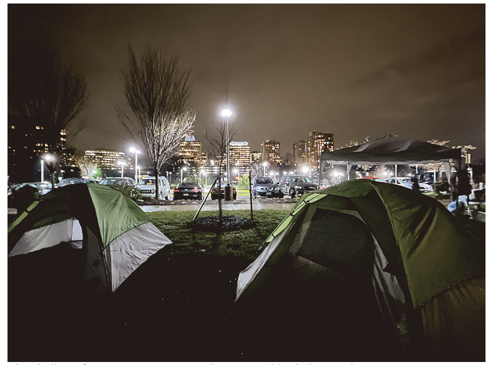
The skyline of Reston Town Center gleams outside their tent doors.