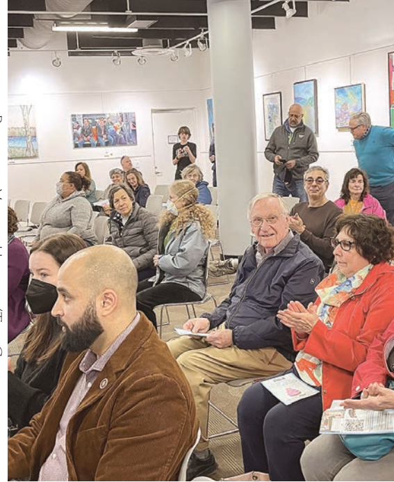
The early crowd attending Founder's Day 2022.