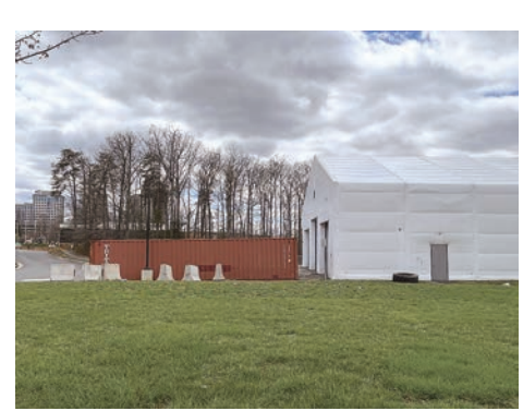
The former temporary Reston Fire Station within view of North County Governmental Center- could it be used for temporary shelter?

"Emergency shelters are not a solution to eradicating homelessness in our area,