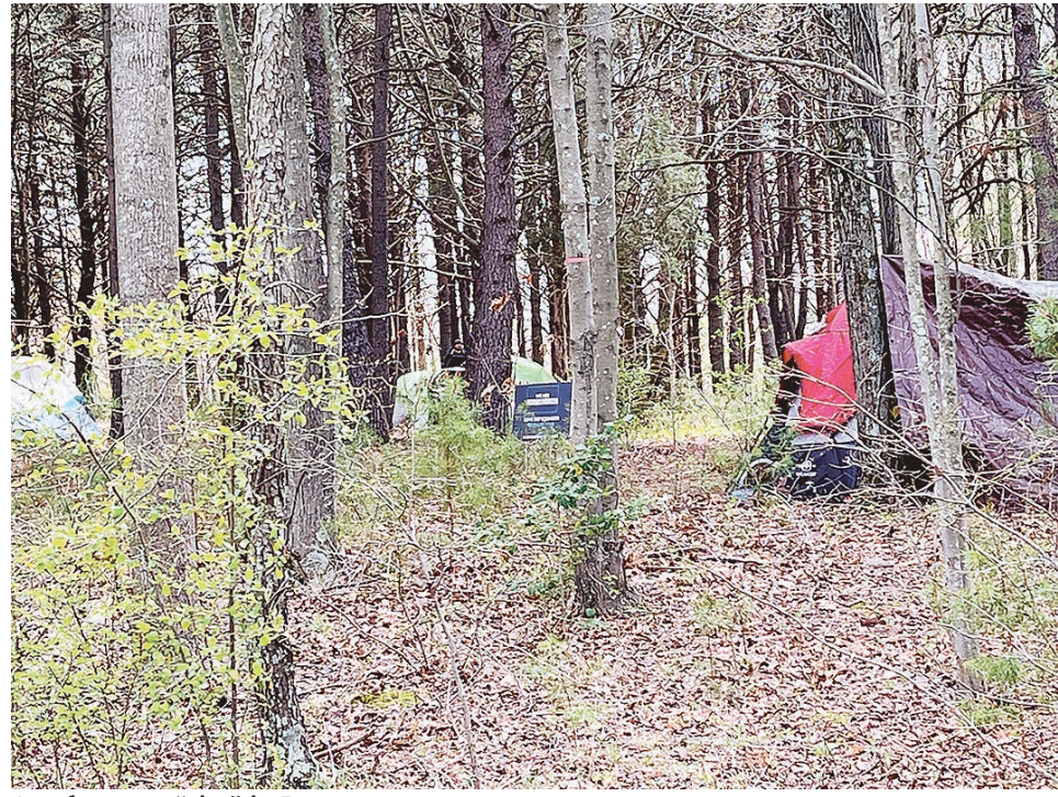
Another tent "city" in Reston.