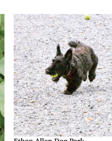
Ethan Allen Dog Park.