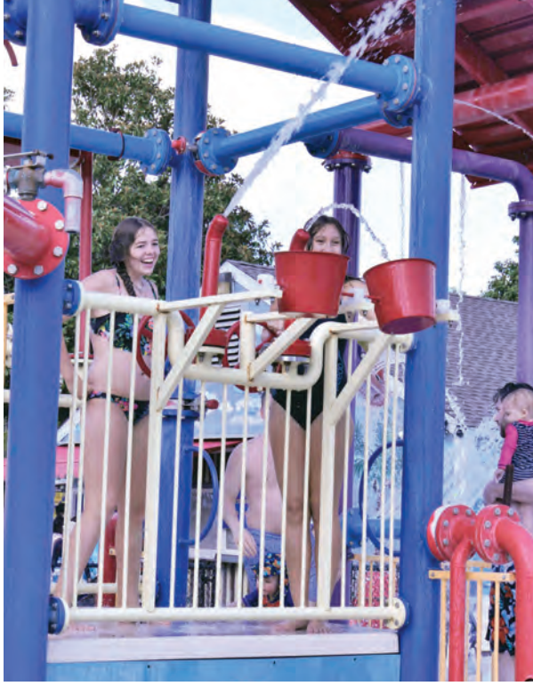
Upton Hill Regional Park swimming pool.

Public Land's analysis of 14,000 difference, according to the report. on average, the deadliest form of cities and towns shows that na- With heat growing more intense by weather, more so than floods, extionwide, areas within a 10-minute the year, greening American cities treme cold, tornadoes, hurricanes, walk of a park are as much as 6 is a low-tech, high-benefit solution and other events, according to the degrees cooler than areas beyond to an urgent problem. Over the National Weather Service.