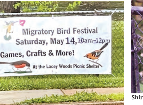
Lacey Woods Park migratory bird festival, May 14, 2022.