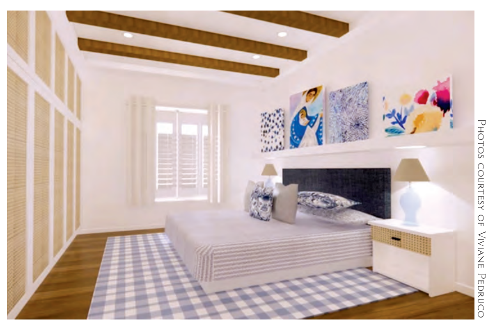
Marymount University Interior Design student Viviane Pedruco maximized light to create an airy master bedroom for a Bethesda family.