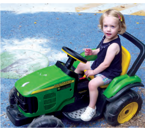
Gulf Branch Regional