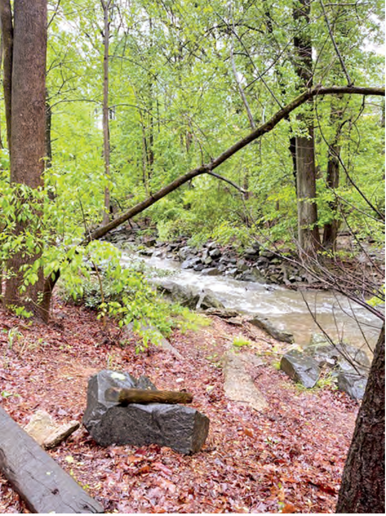
Long Branch Nature Center, Arlington County's second nature center

fighting climate change. Trust for that range. That's an appreciable past 30 years, extreme heat was,