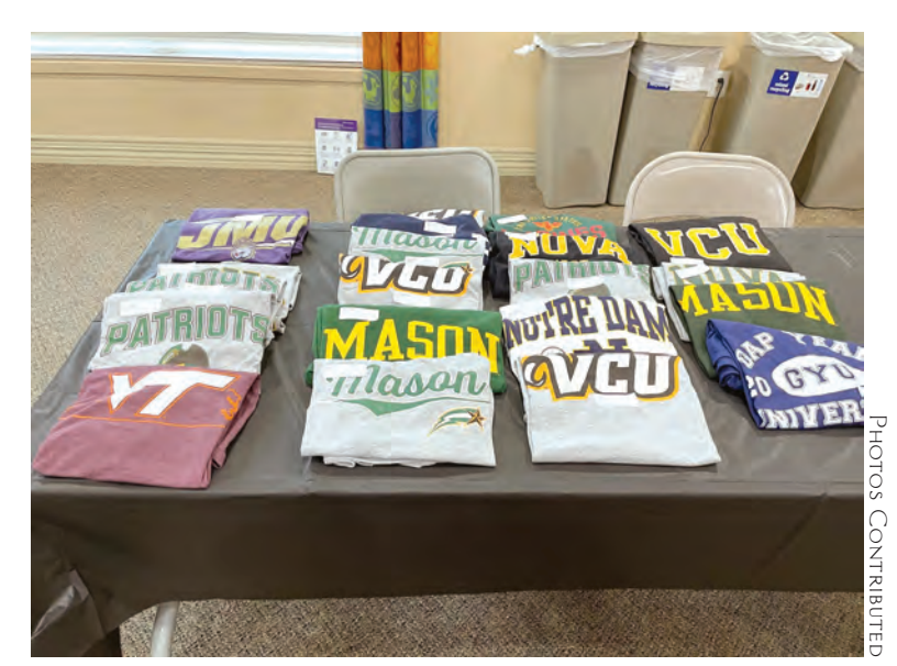
AHC displays college T-shirts from their student's selection of colleges at their event May 6.