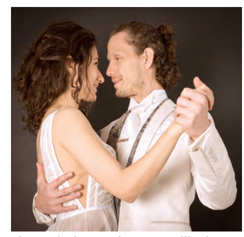
The Festival Argentino 2022 will take place Saturday, May 21 in Arlington.

Enjoy Arlington Registration. Beginning on Tues-