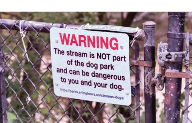
Shirlington Dog Park.