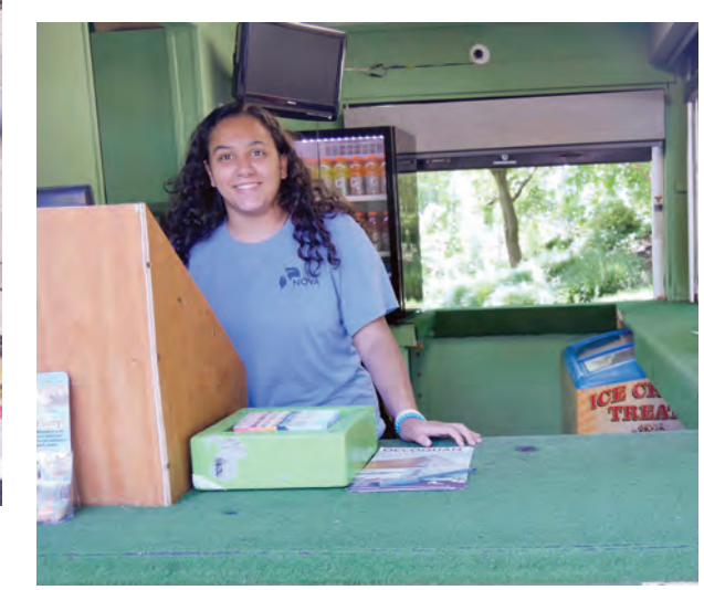
Upton Hill regional Park miniature golf.