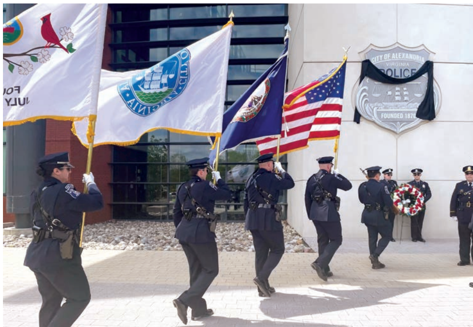
The Alexandria Police Department Honor Guard opens the wreath laying ceremony at the Fallen Officers Memorial May 11 at Police Headquarters.