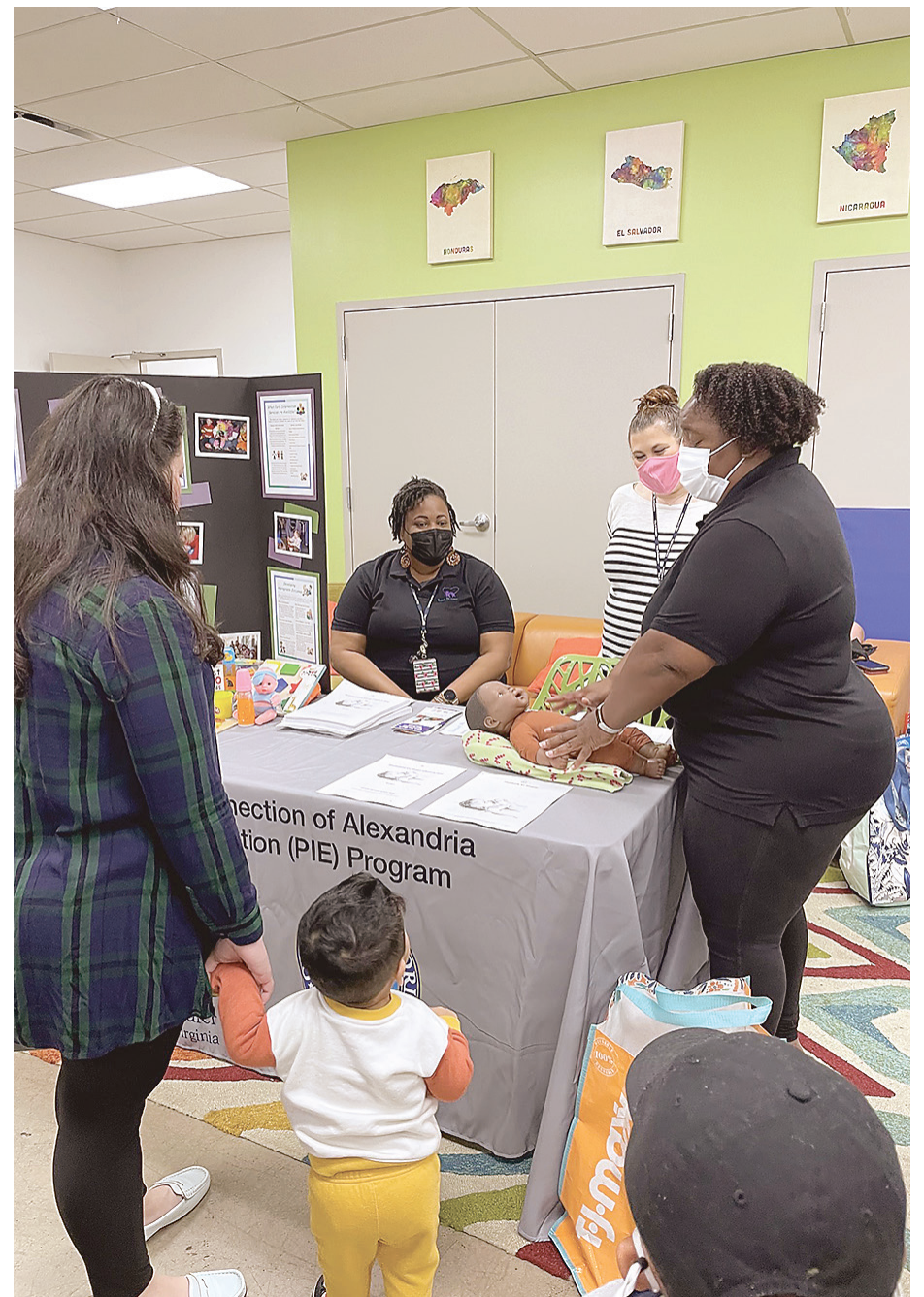
Attendees at the Community Baby Shower watched a demonstration on infant massage given by a representative from the Alexandria PIE Program.

Kids’ First Years is a collective impact initiative dedicated to being the unified voice for organizations in Alexandria that collaborate to provide support, care and education for the city’s young children and their families. For more information about Kids’ First Years and its partners, visit kidsfirstyears.org or follow Kids’ First Years on Facebook.