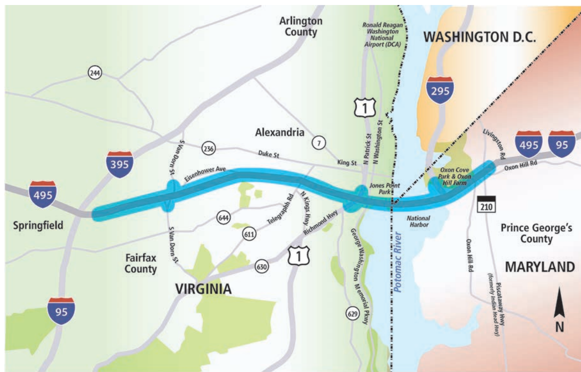
MAP BY VIRGINIA DEPARTMENT OF TRANSPORTATION

When the rebuilt Woodrow Wilson Memorial Bridge opened to traffic in May 2008 it included additional space for future transportation needs which included transit across the bridge. This study is being coordinated with surrounding stakeholders including localities and the Maryland Department