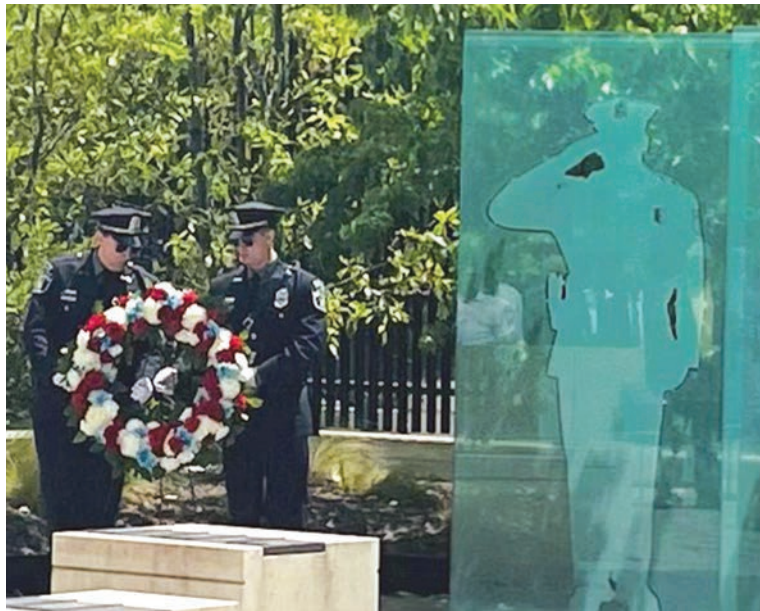
Members of the Police Department Honor Guard place a wreath at the Fallen Officers Memorial May 11 at Police Headquarters.