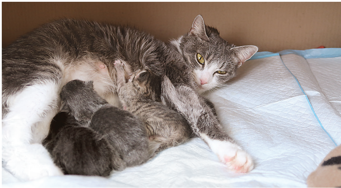
Stardust, a one-year-old mother cat who was sent by the AWLA to a foster home to give birth. Kittens are generally ready for adoption when they reach six to 10 weeks of age.