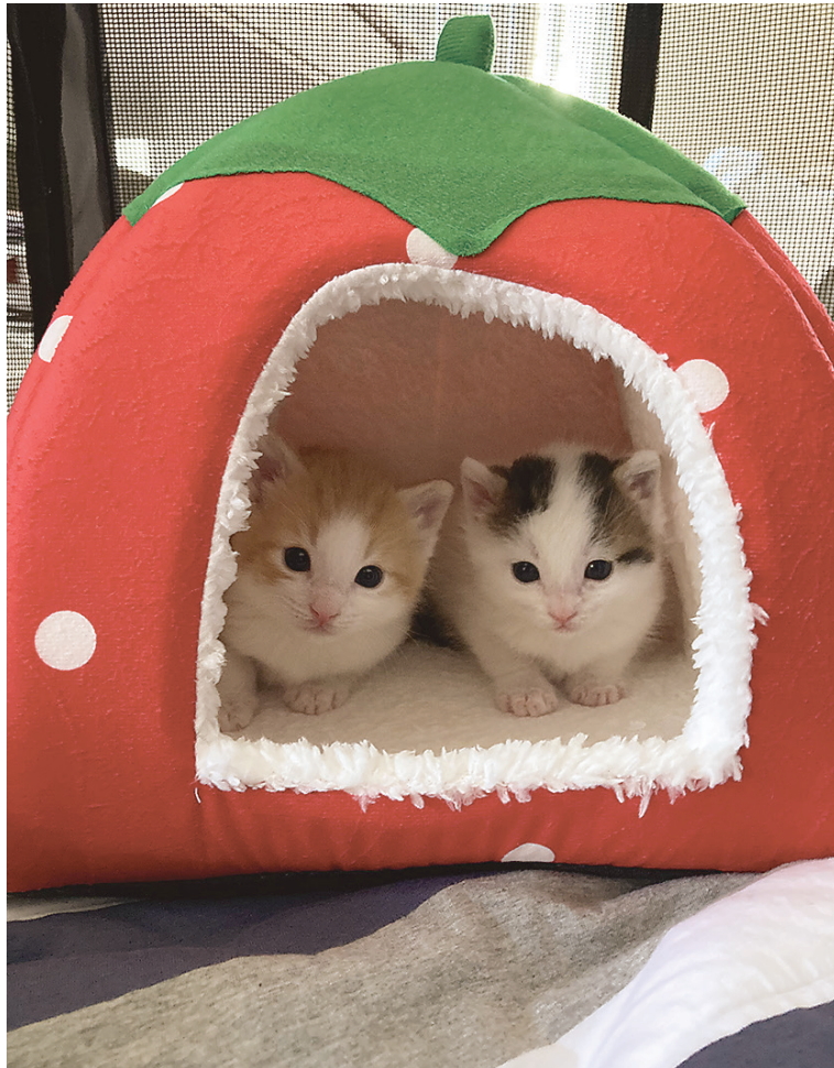
Morris (left) and Blitz find a cozy spot while in foster care in Alexandria. Kittens often stay in foster homes for special care before moving back to the AWLA shelter for adoption.

For Bentley, Cupid, Morris and Blitz, care provided by the foster "parents" must have felt almost as nice as the real thing. In the early days, Bentley and Cupid lived in a basket loaded with blankets and