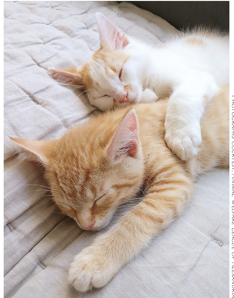
Tiny Cupid (upper) cuddles Bentley as they snooze in a foster home. Kittens arrive in numbers at the Animal Welfare League of Alexandria during "kitten season."