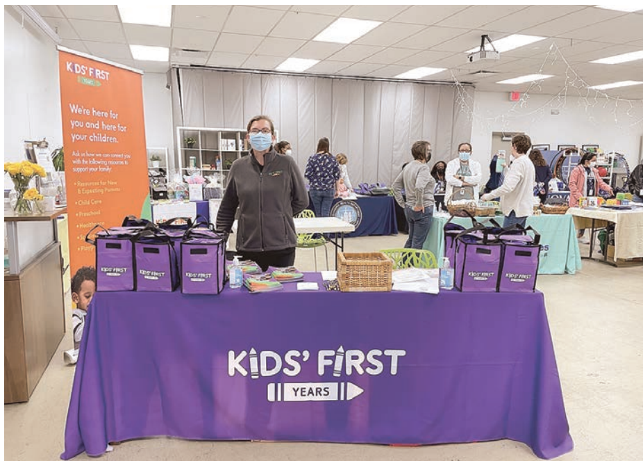
Representatives from Kids’ First Years greeted expectant mothers at Alexandria’s first Community Baby Shower and distributed goodie bags filled with baby supplies to take home.

https://www.eventbrite.com/e/dmventure-derby-pitch-competition-tickets-274848989727