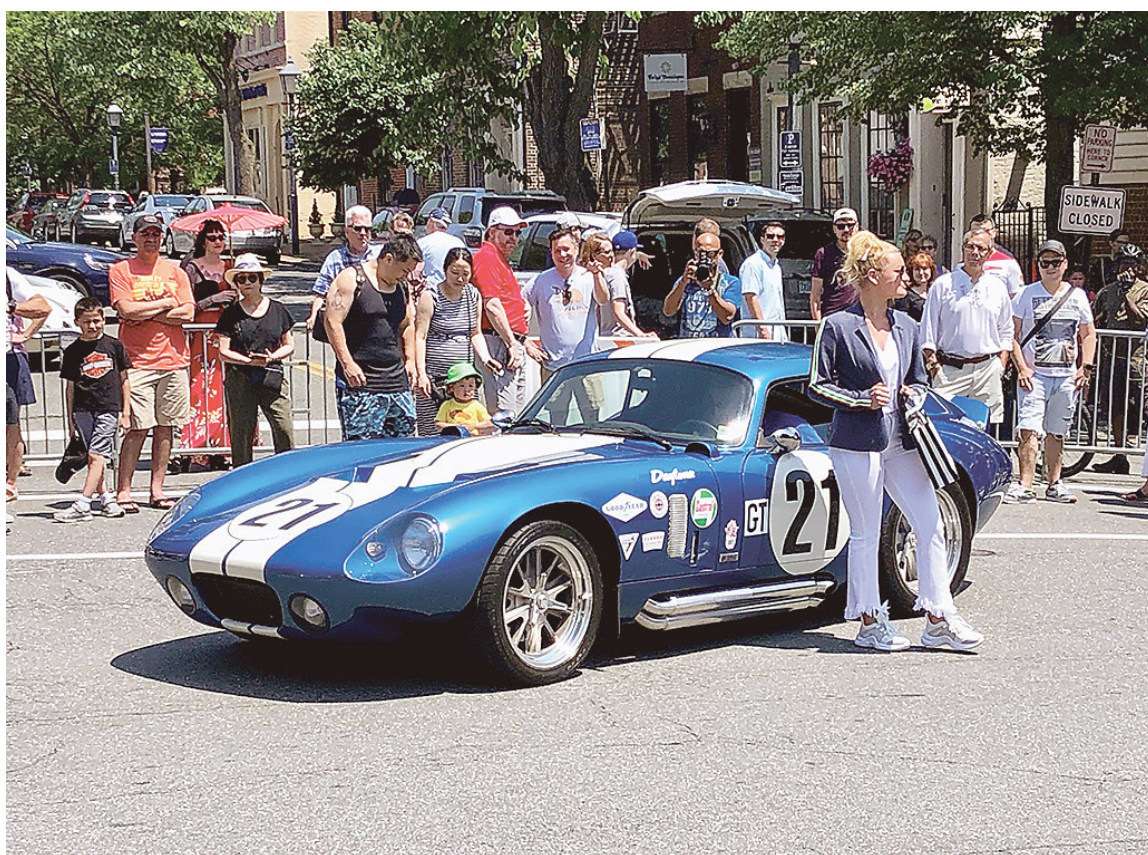
The Speed & Style Festival will take place Sunday, May 22 in Alexandria.

Vietnam Memorial Traveling Exhibit. The Vietnam Veterans Memorial Fund's traveling exhibit Panel 44: 8 Days in March will be on display at the National Museum of the United States Army through June 17, 2022, as a part of the 40th anniversary commemoration of the Vietnam Veterans Memorial. The centerpiece of the exhibit is the Memorial's original Panel 44,