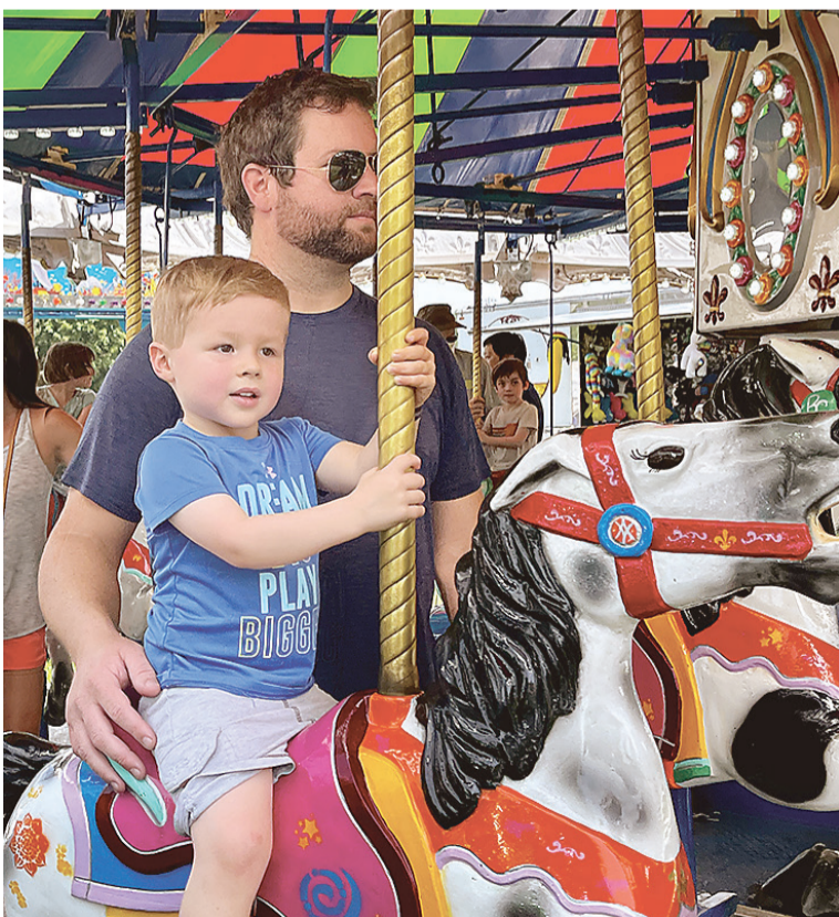
Kids' Way- carousel.