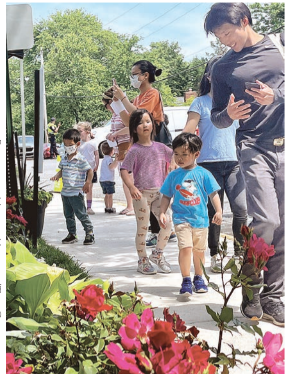
Families photograph the map and community stage schedule for McLean Day.