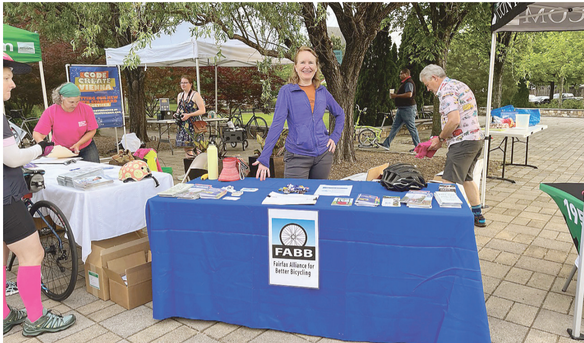
FABB's table in Vienna at Bike to Work Day on Friday, May 20.