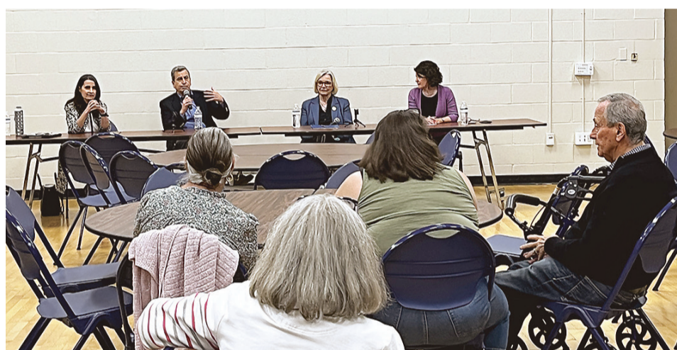
Audience members at the community event held at the McLean Community Center listen to members of the General Assembly.

"I mention compensating them, and all those bills went through. The governor signed off with them. I think it's one of those