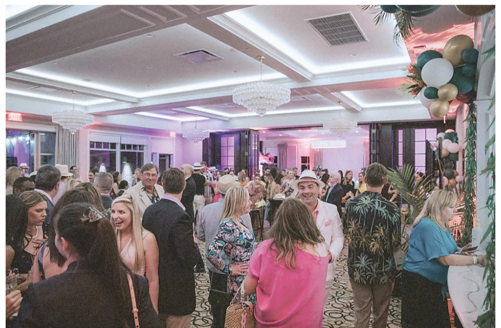
150 people attended Havana Night at River Bend Club to benefit the Women's Club of Great Falls Scholarship Fund.