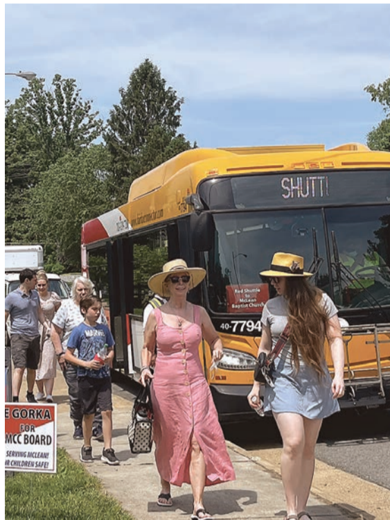
Shuttle buses transport people from satellite lots to the venue at Lewinsville Park.