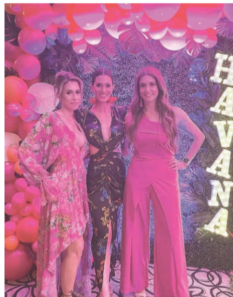
The decor committee excelled.