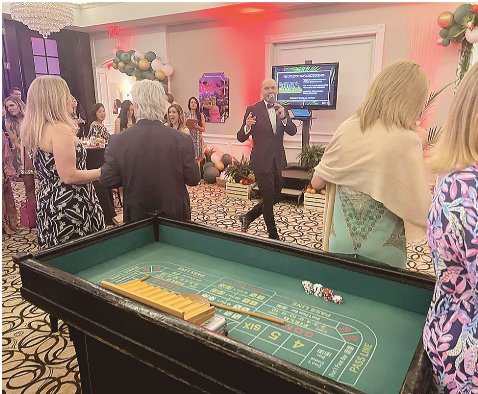
Havana Night, a benefit for the Women's Club of Great Falls Scholarship Fund, raised $53,000.