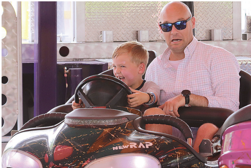
The Herndon Carnival will take place June 2-5 in Herndon.

The Jurassic Encounter Dinosaur Walk Thru Experience. 10 a.m. to 7 p.m. At Bull Run Events Center, 7700 Bull Run Drive, Centreville. The Jurassic Encounter will transform the events center into a walk-through experience featuring more than 50 static and moving, life-like dinosaurs that both entertain and educate. Also enjoy Digging for Bones, the Dino Village, shopping, food, free photo-ops, games, bouncy house and more. Tickets start at $19 per person (anyone two years and older will need a ticket). Children must be accompanied by a parent or guardian at all times. Web: http://feeltheroar.com