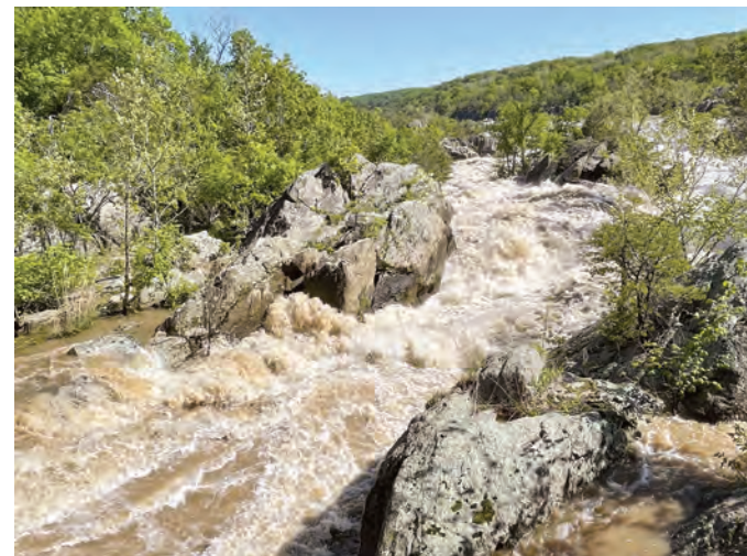
Bridges over channels in the River leading across Olmsted Island to the Great Falls overlook of were closed on Sunday because of high water. They reopened Monday afternoon.