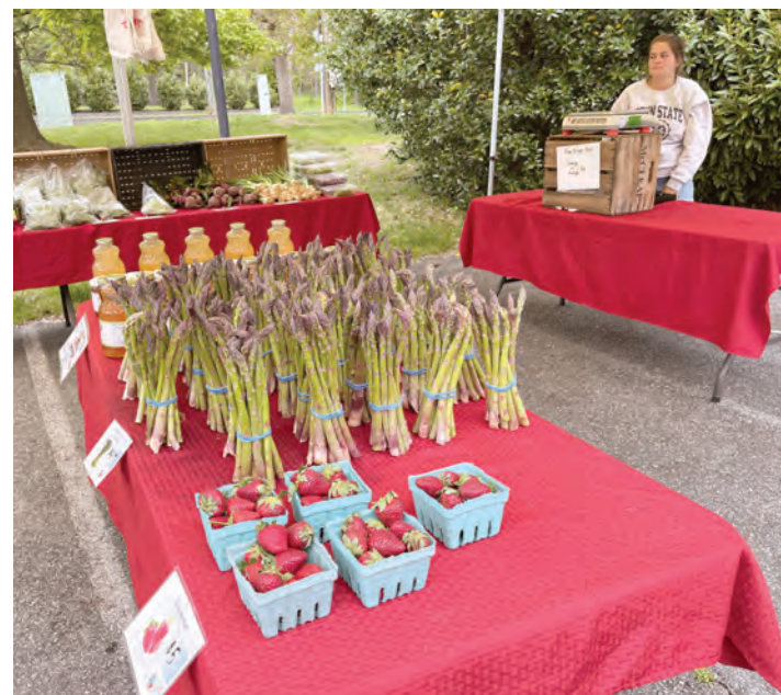
Apples, strawberries, asparagus, greens and more. Offerings will expand as the season progresses.