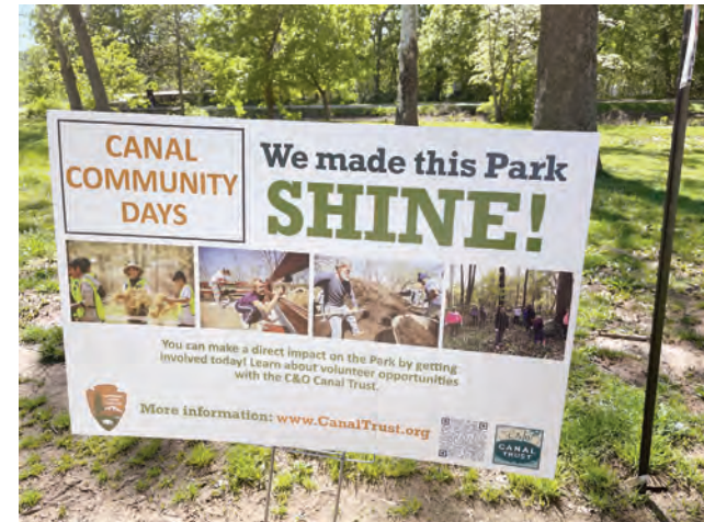
Canal Trust community days helped with projects and cleanup around the C&O Canal Historical Park. More volunteer opportunities are available. https://www.canaltrust.org