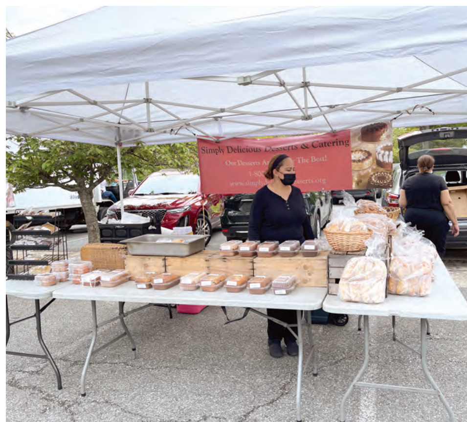
Simply Delicious offers.