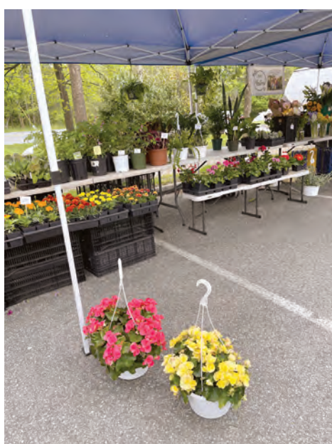
Plant Masters returns with cut flowers, bouquets, hanging plants, plants for the garden and more.