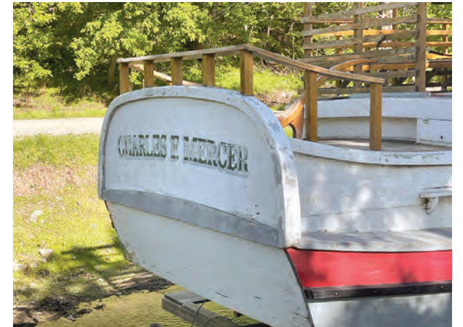
The Charles Mercer, a replica mule-drawn canal boat, is currently up on blocks, although there is hope that boat rides through the lock will resume this year.