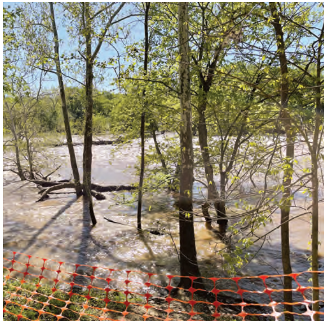
Potomac River water levels reached flood stage on Sunday.