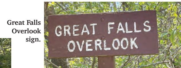
Great Falls Overlook sign.