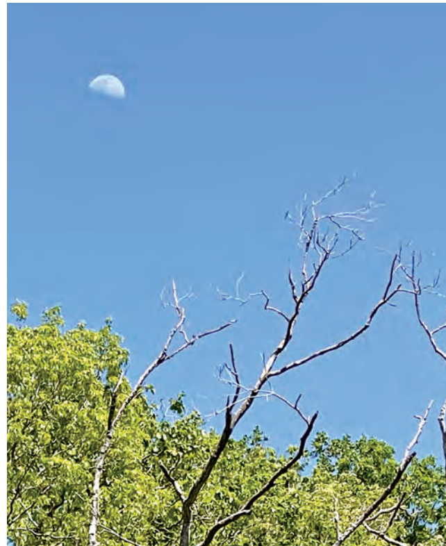
The half moon appears in daylight over the canal.