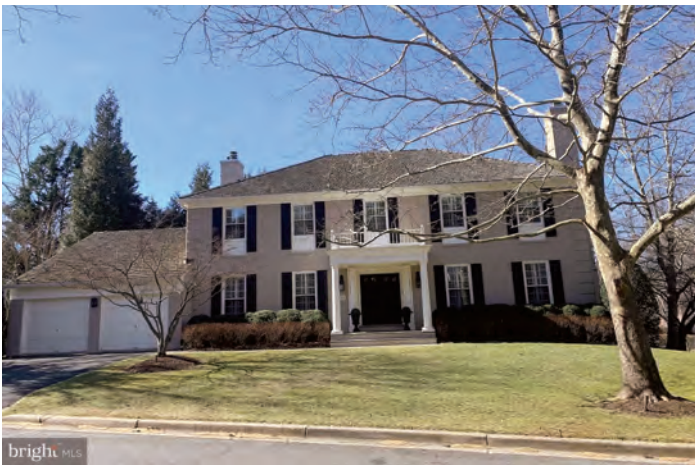
4 10100 Meyer Point Terrace – $1,670,000