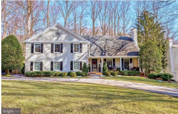
3 7109 Masters Drive – $1,695,000