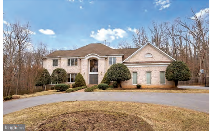
5 11331 Palatine Drive – $1,625,000