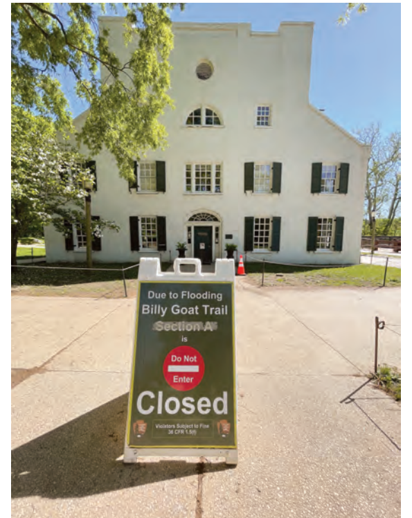
Great Falls Tavern behind the sign warning of flooding.