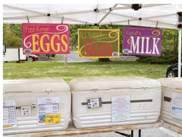
Organic practices, pastured meat with amazing flavor.