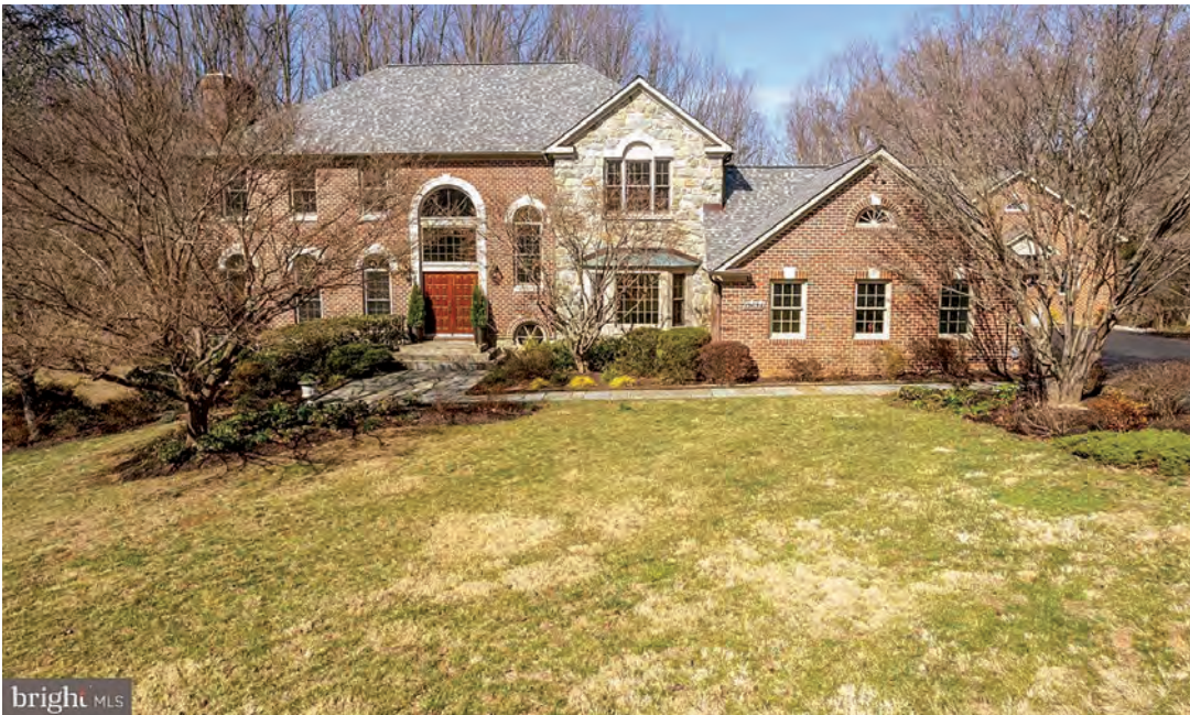
1 13635 Maidstone Lane – $1,760,000