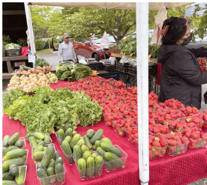
Strawberries, asparagus, greens and more, plus a variety of potted herbs and plants for your garden.