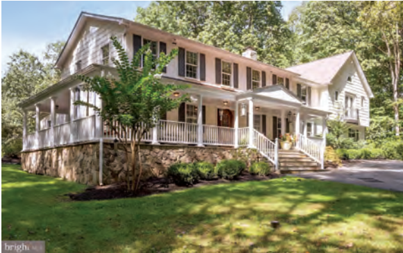
2 10706 Tanager Lane – $1,695,000

IN MARCH, 2022, 45 POTOMAC HOMES SOLD BETWEEN $1,760,000-$1,510,000.