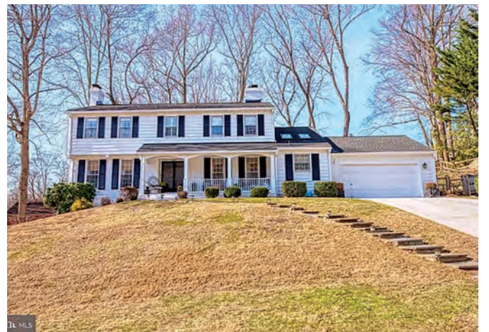
6 7600 Masters Drive – $1,615,000