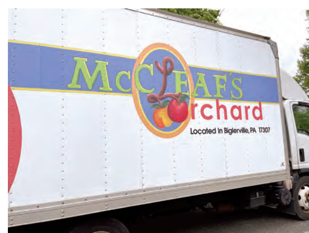
McCleaf's colorful truck.