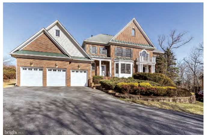
7 7931 Lakenheath Way – $1,525,000