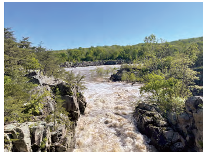
The water from the channels around Olmsted Island rushes into the Potomac River's Mather Gorge, visible in the distance.