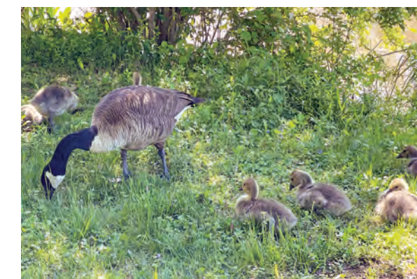
Goslings with a parent.