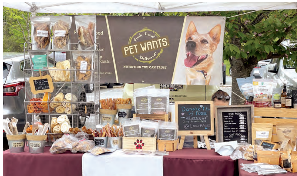
Freshmade offerings for your pet. Fresh, local, delivered.