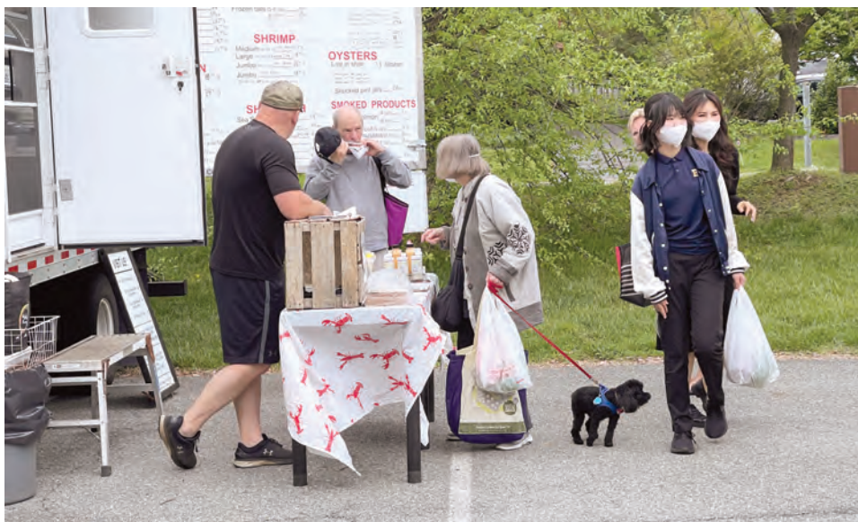
Salt River Lobster comes to this location year round, and is a popular stop.