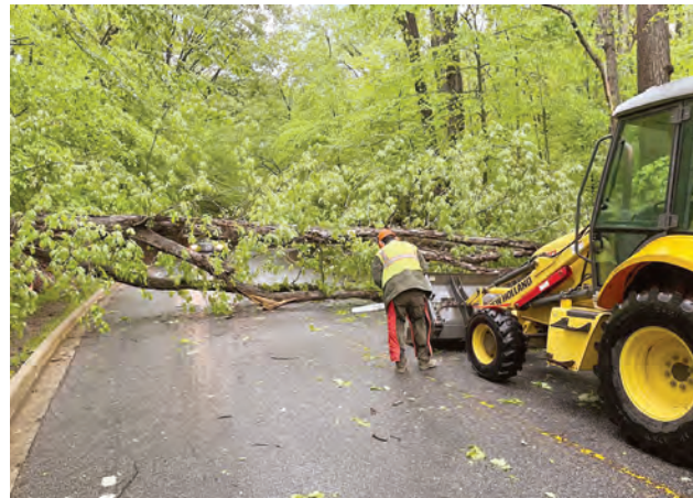
FROM TWITTER @CCCANALNPS