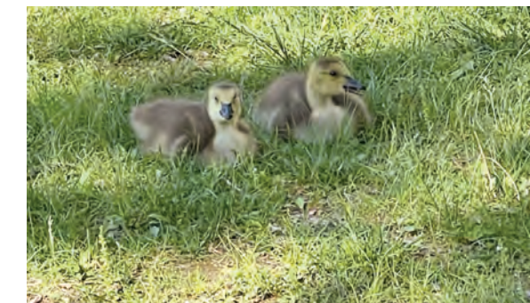
Young goslings sit under the watchful eyes of both parents.