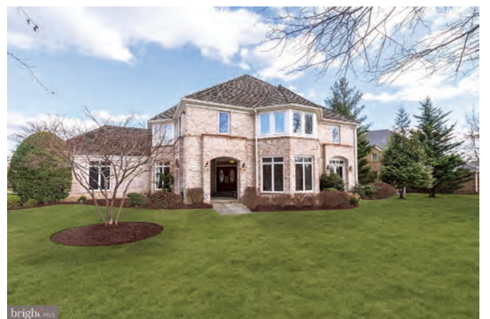
8 9900 Avenel Farm Drive – $1,510,000