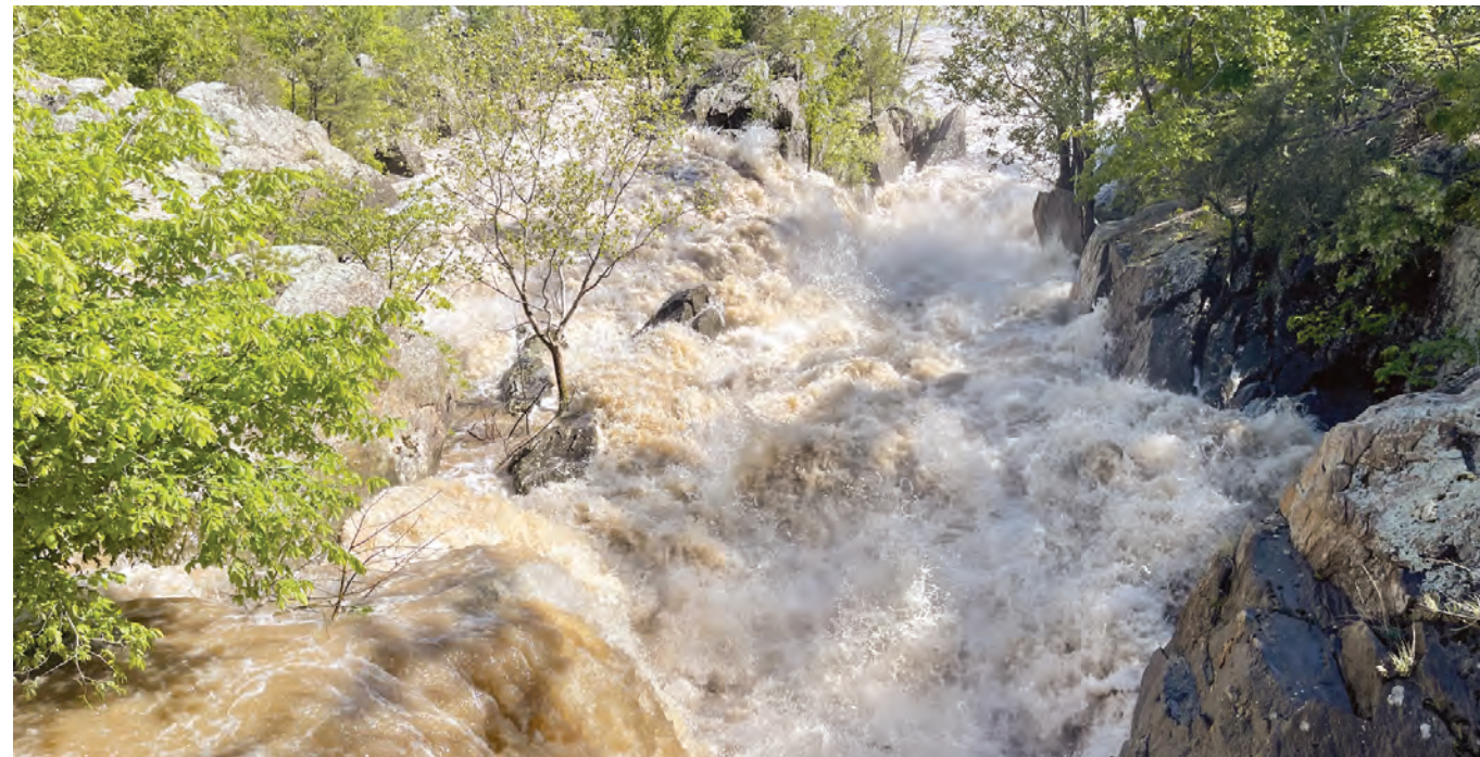
High water rushes with enormous power.