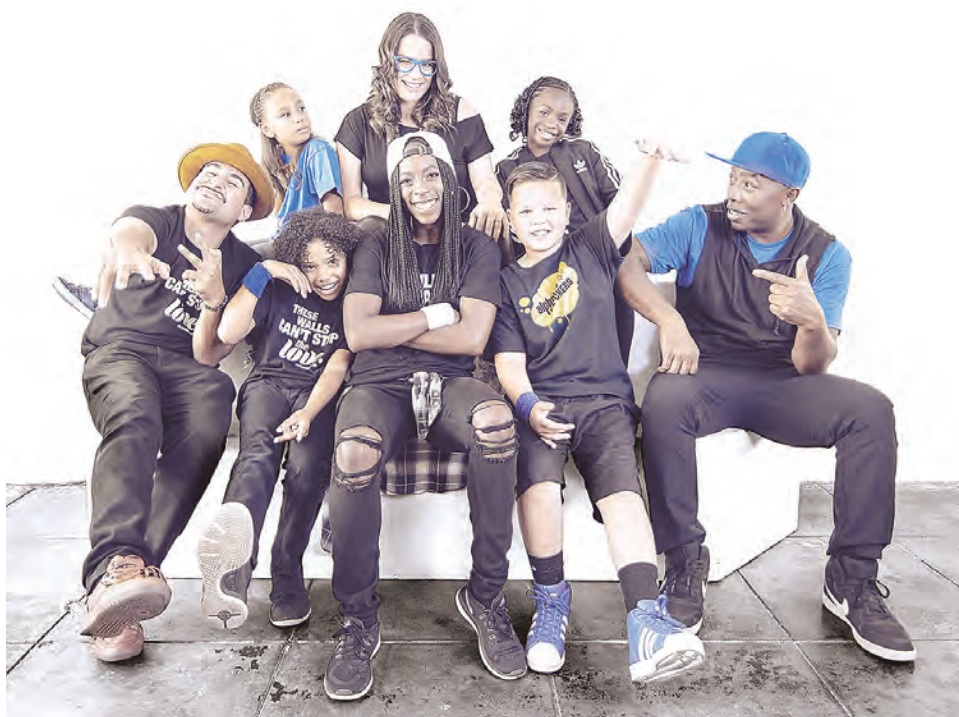
The Alphet Rockers will appear at MCC's Celebration of Juneteenth on Sunday, June 19, 2022 in McLean.