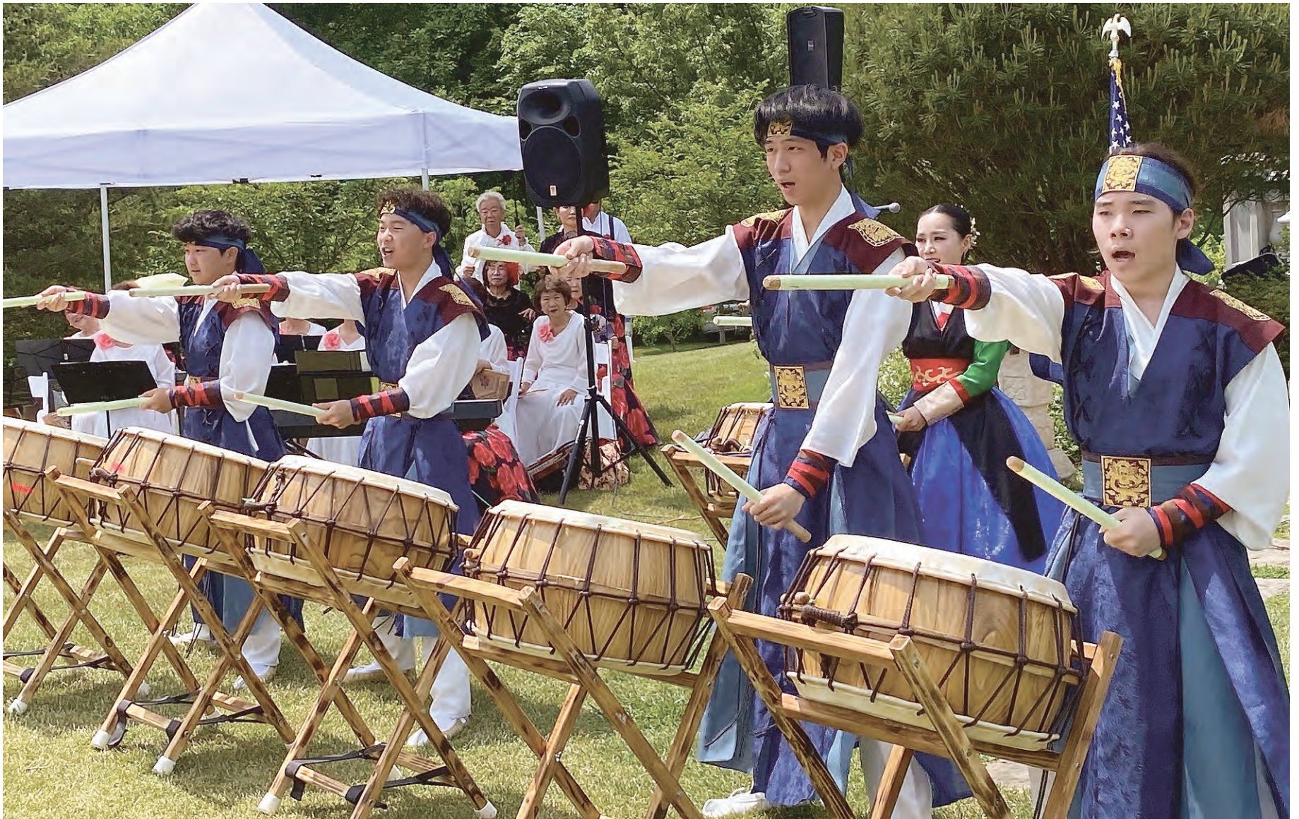
The drums played on May 27 for the 10th anniversary celebration of the Korean Bell Garden at Meadowlark Botanical Gardens in Vienna. Check for events all summer for your StayCation visit.