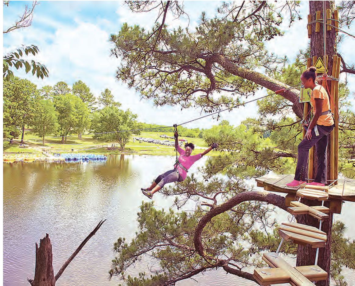
She's living life adventurously at the "Go Ape," park in Fairfax Station.