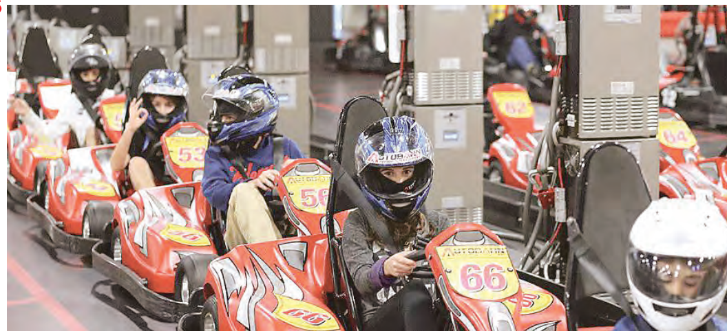
Racers at the Autobahn Indoor Speedway near Dulles rev their engines.

In the South Run Rec Center, there's another climbing course called "Go Ape," with five activities depending on the skill level. There are 70 obstacles at South Run and a 320-foot zip line.