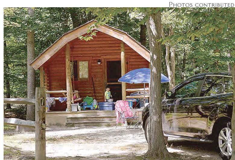
Camping out at Pohick Bay could be in a camper or one of the cabins that are for rent.

AUTOBAHN INDOOR SPEEDWAY 45448 East Severn Way, Suite #150 Sterling, VA 20166 (571) 353-1220