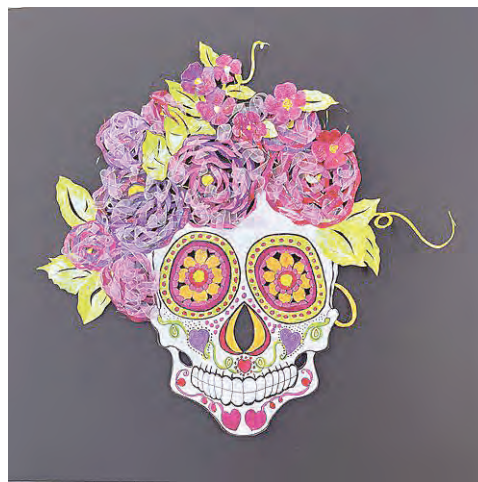
You never know what is on display at the Workhouse Arts Center in Lorton.