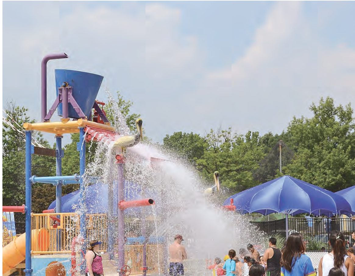
Ocean Dunes Water Park at Upton Regional Park in Arlington, which also offers climbing adventures and mini-golf.