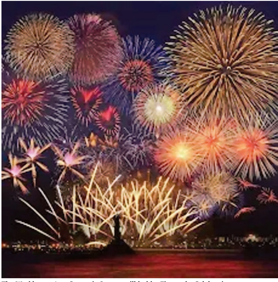
The Workhouse Arts Center in Lorton will hold a Fireworks Celebration on Saturday, July 2.

Santi Budaya Concert. 7:30-8:30 p.m. At Ossian Hall Park, 7900 Heritage Drive, Annandale.