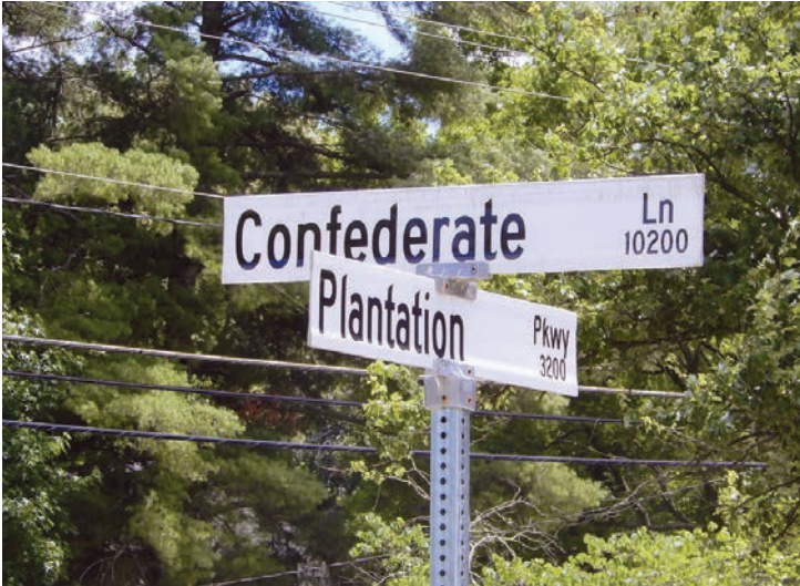
A closeup of the Confederate Lane and Plantation Parkway street sign.

The 14 streets advisory group recommends Council rename are: Plantation Parkway, Confederate Lane, Raider Lane, Ranger www.ConnectionNewspapers.com