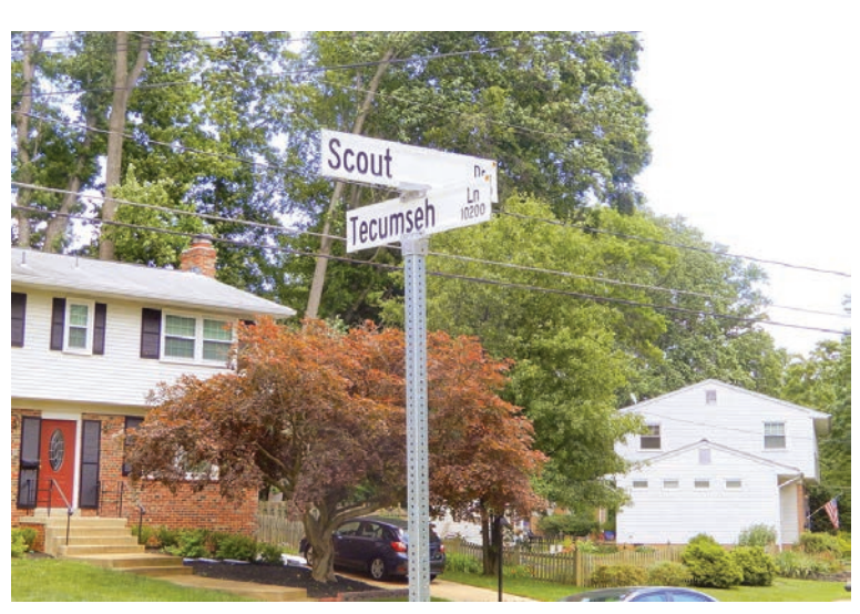
The intersection of Scout Drive and Tecumseh Lane on a residential

Luther King or Arthur Ashe drives; we name streets after what we believe in. Plantation shouldn't be one of them."