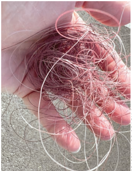
injured when encountering an unseen kite line under tension left in the park.

The AKA advises, "It is each kite flier's responsibility to fly safely so that we continue to be welcome at our favorite windy places. Clean up after yourself. Take all of your materials and trash home with you. Ensure that all kite lines are accounted for at the end of the day so as to not leave any as rubbish." If you see an animal entangled in line or in distress, please contact Fairfax County Animal Protection Police. Report injuries to Fairfax County Park Authority.