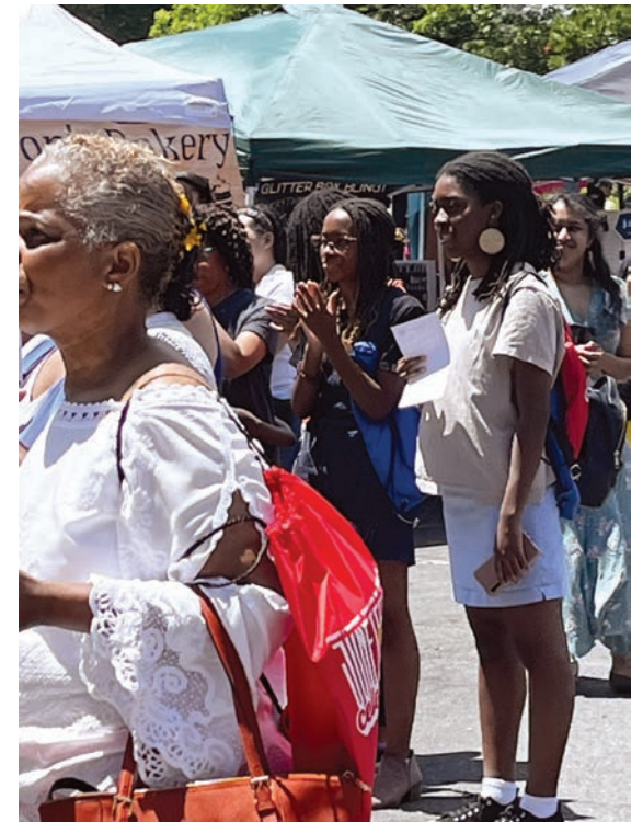
Participants listen to speaker's remarks.