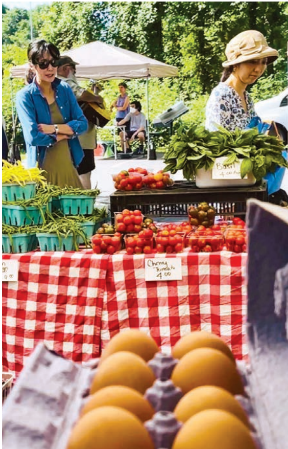
Shopping under the tree canopy at the McLean Farmers Market.