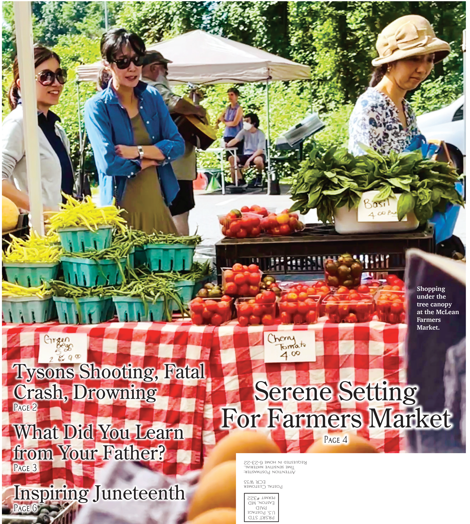
Shopping under the tree canopy at the McLean Farmers Market.