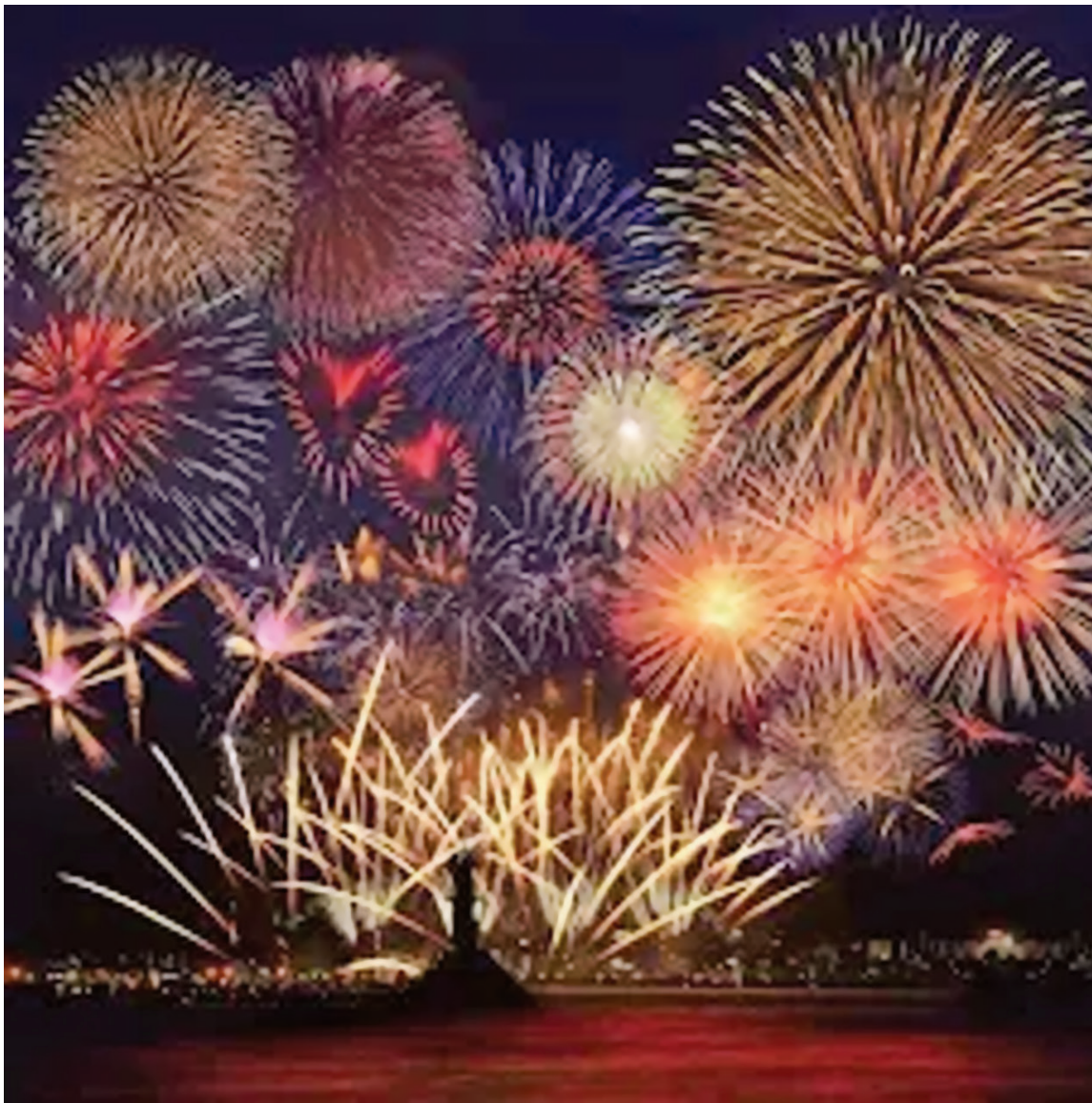
The Town of Vienna will hold its Independence Day Celebration on Friday, July 1 in Vienna.

Broadway in the Park. 8 p.m. At Wolf Trap Center for the Performing Arts, 1551 Trap Road, Vienna. Experience a night of stellar show tunes and memorable performances under the stars this summer at Wolf Trap. Two of Broadway’s Tony-Award winning leading ladies, Kelli O’Hara (“The King and I”) and Adrienne Warren (“Tina: The Tina Turner Musical”), join some of your favorite Signature Theatre artists for an incredible night of musical theater featuring songs from “West Side Story,” “The Wiz,” “Gypsy,” “Funny Girl” and more.