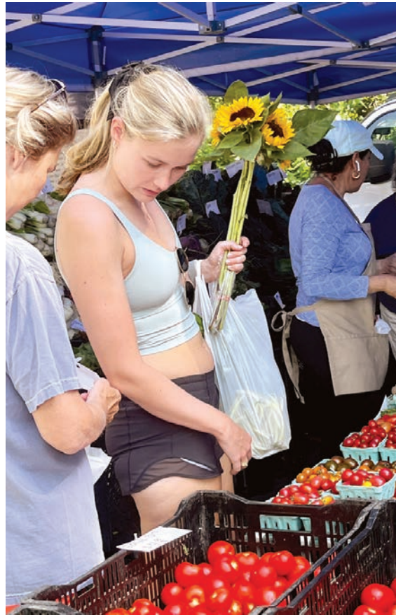
Shopping under the tree canopy at the McLean Farmers Market.