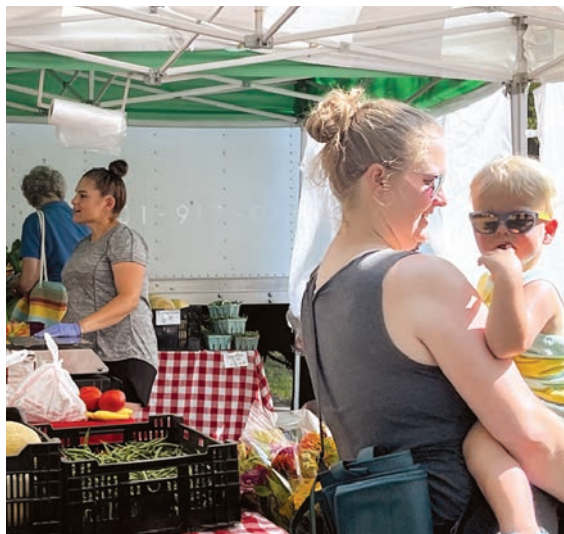
Shopping under the tree canopy at the McLean Farmers Market..