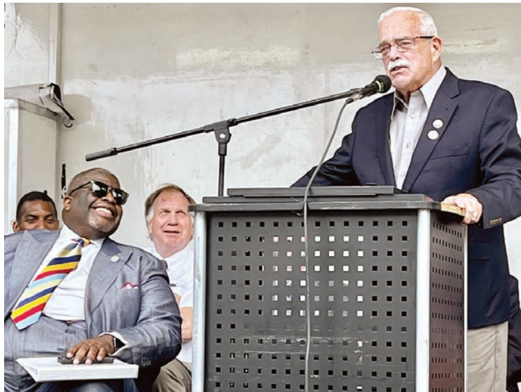
Congressman Gerry Connolly.

Vienna's celebration kicks off Liberty Amendment month.