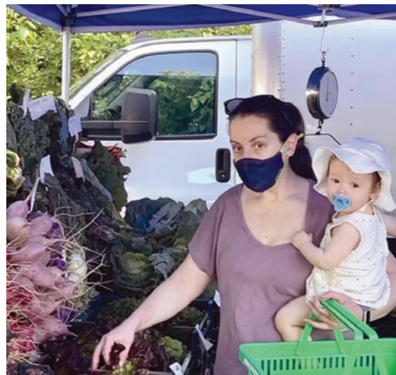
Shopping under the tree canopy at the McLean Farmers Market.