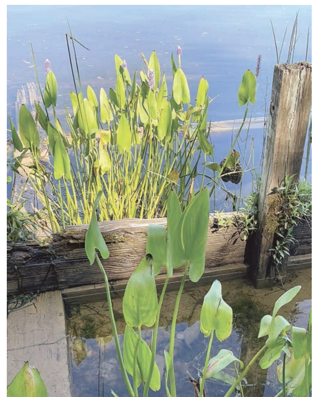
Pickerelweed, a native aquatic plant blooms within the wetlands of Accotink Bay in the park