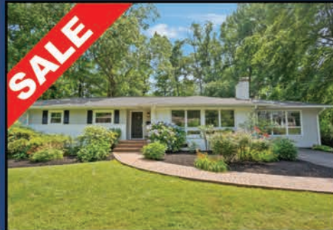
4417 Dolphin Ln $949,000