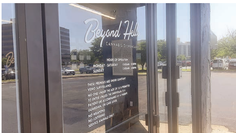
Customers have to be 18 to get inside.