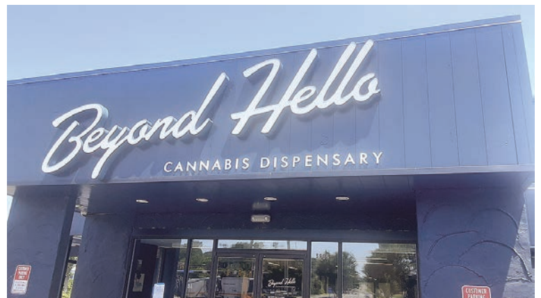
Beyond Hello is right off Richmond Highway, near Fort Hunt Road.