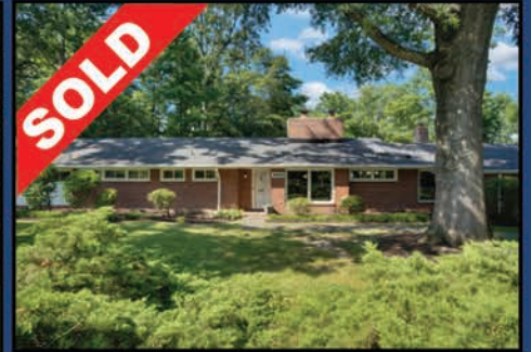
4503 Ferry Landing Rd $775,000