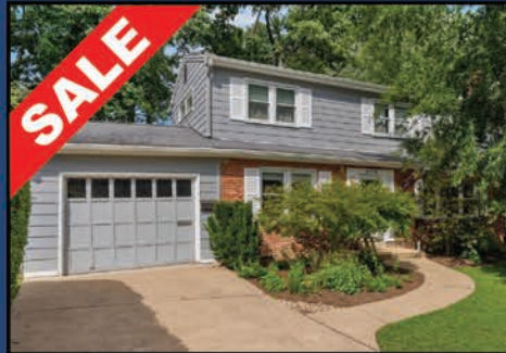
8304 Bound Brook Ln $749,000