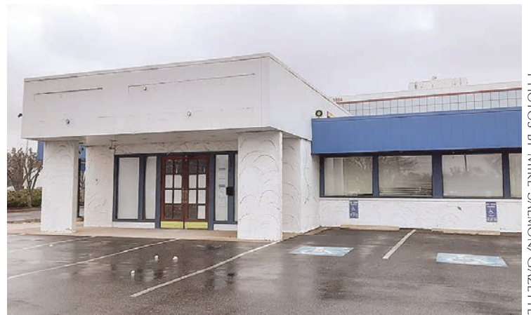
A few months ago, the location had all the signs of a closed restaurant.