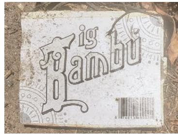
In the parking lot, an old rolling paper package was found, possibly indicating that this location is no stranger to marijuana.

Too complicated? Then growing a plant is always an option, although it may take some time. According to the Virginia Cannabis rules, "Home Cultivation" became legal on July 1, 2021. Adults 21 and over may grow up to four marijuana plants per household (not per person), for personal use. Plants can be grown only at the main place of residence," the rules state. It can be given away as a gift, but not sold. Individuals who sell marijuana, or who possess with the intent to sell it, are