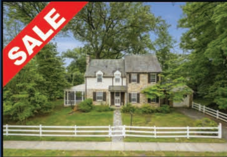
2101 Foresthill Rd $1,500,000

Leading the Area in Real Estate SOLD!!!!