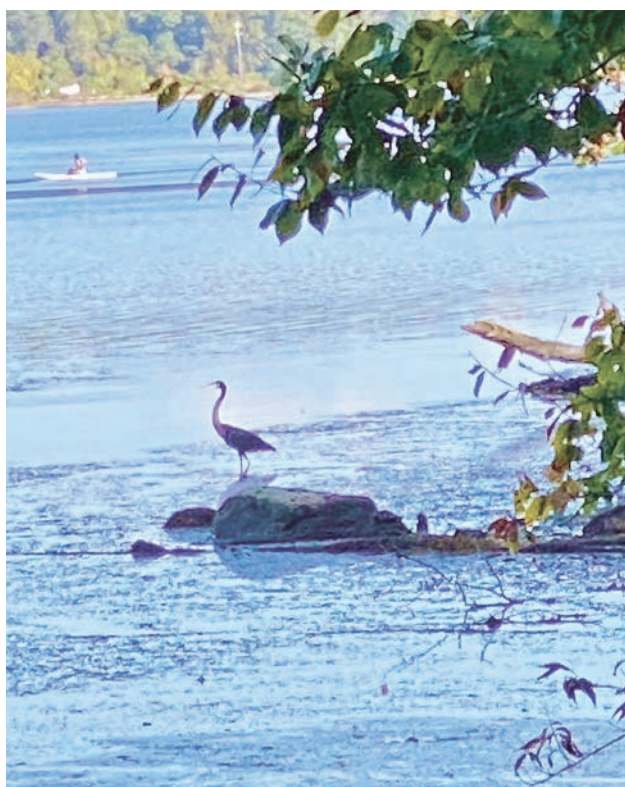
Parks in the regional system provide recreation and viewing an abundance of wildlife within their areas of conservation