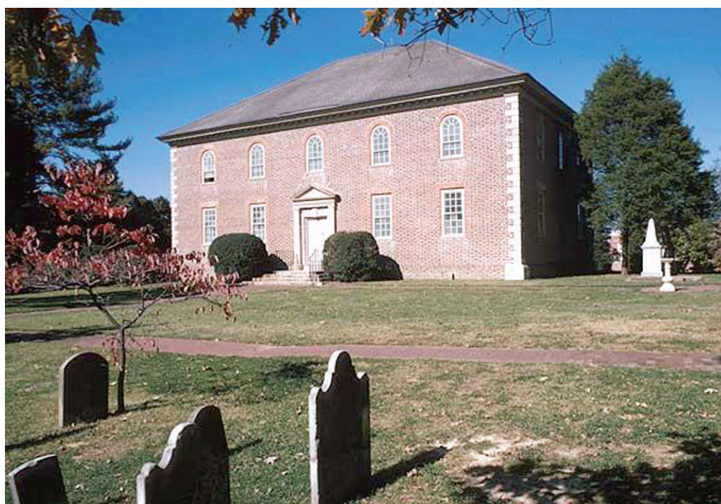
Take a tour of Historic Pohick Church on Saturday, July 2, 2022 in Lorton.