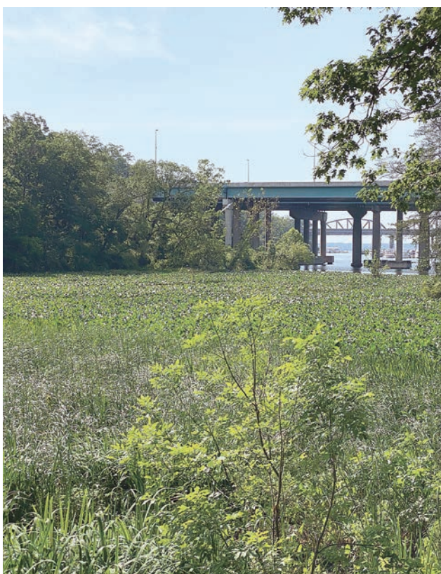
The five year plan could include a new wetland park for environmental education