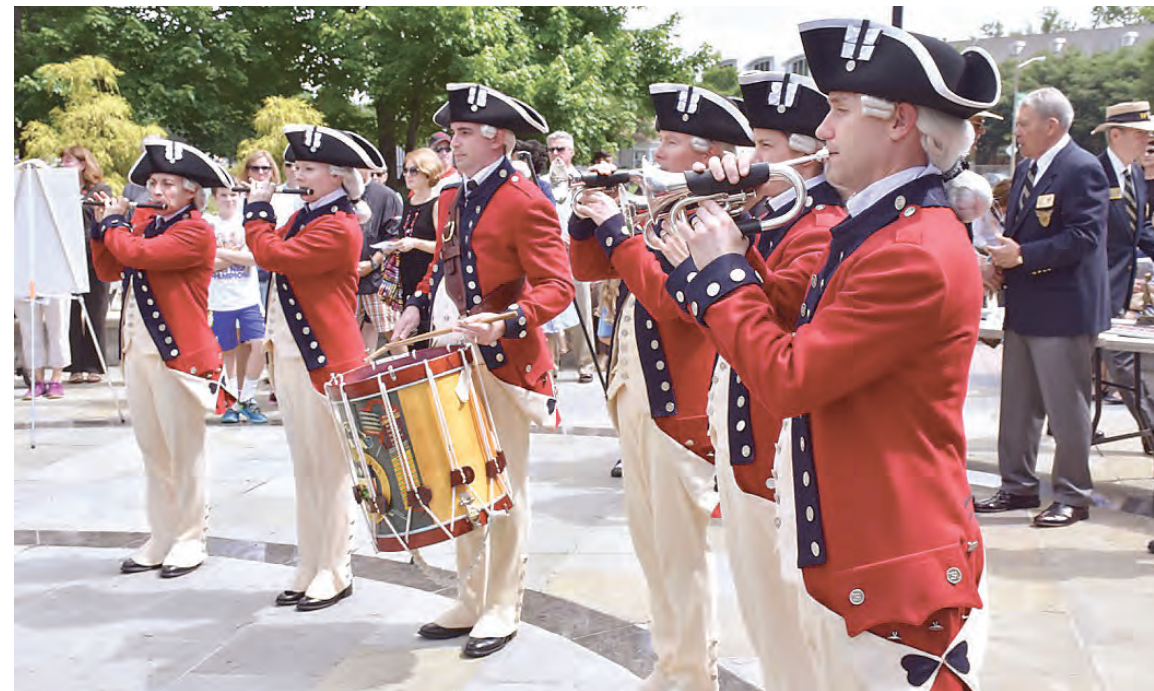
The Old Guard's Historical Trumpets and Flutes perform patriotic music during the 2017 Memorial Day Ceremony at the Versace Plaza.

and endeavor to present Vietnam Era Veterans with the Commemorative Lapel Pins. The DoD also seeks to identify Gold Star Family members through the Partner Program and present them with "in