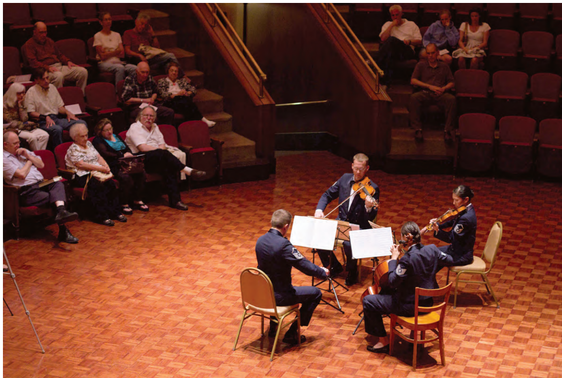
The U.S. Air Force String Quartet will appear on Sunday, July 10 at Sherwood Regional Library in Mount Vernon.

Hummingbird Photo Exhibition. At the Historic House at Green Spring Gardens, Alexandria. For those who can’t get enough of the beauty of hummingbirds,