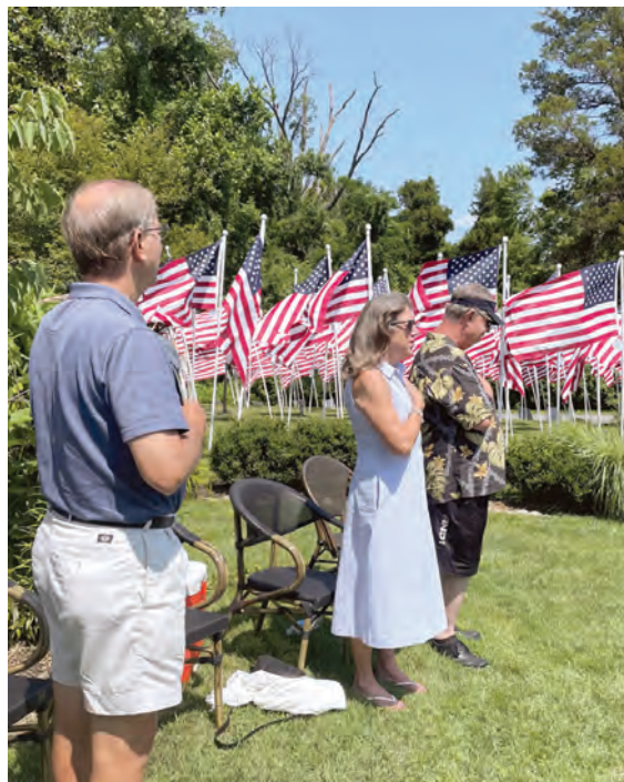
Attendees recite the Pledge of Allegiance at the opening ceremony of the Flags For Heroes display June 26 at Cedar Knoll Restaurant along the Potomac River. The annual event is a project of the Rotary Club of Alexandria.