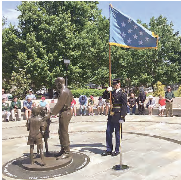
A U.S. Army soldier from the 3rd Infantry Regiment (The Old Guard) places the Medal of Honor flag behind the statue of Captain Rocky Versace prior to the start of the 2016 Memorial Day Ceremony.