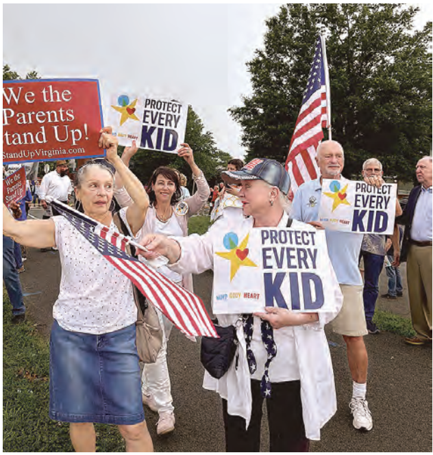
Protestors hold signs by Stand Up Virginia and The Family Foundation that, according to its website, advocates "for policies based on Biblical principles that enable families to flourish at the state and local level."