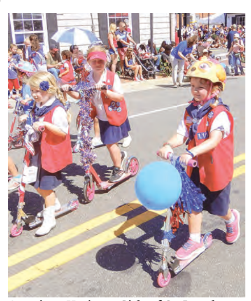
American Heritage Girls of St. Leo the Great Catholic School in Fairfax.