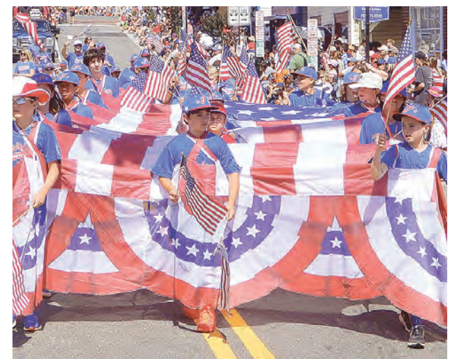
Young Fairfax baseball champions show their patriotism.