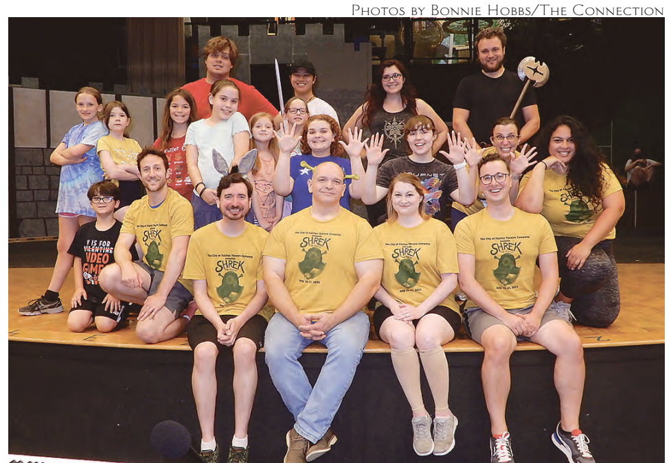
The joyful cast of CFTC's "Shrek, the Musical" includes actors of all ages.