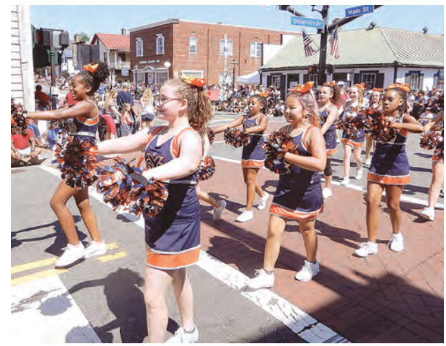
South County Youth Club Cheerleaders