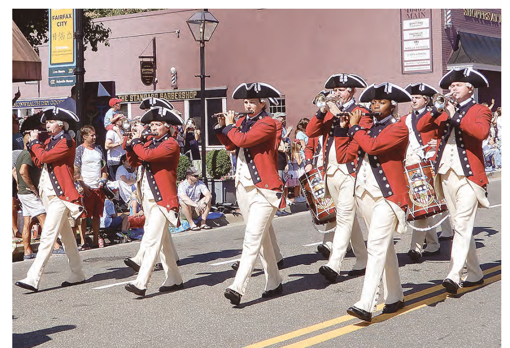
The U.S. Army Old Guard Fife & Drum Corps

Thousands enjoyed Fairfax City's Fourth of July parade.