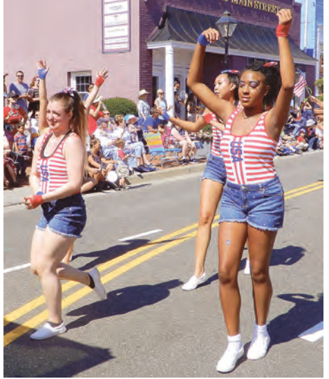
C4 Performing Arts students dancing in the sunshine.