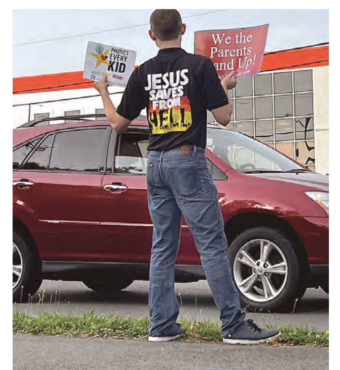
Jesus Saves: A protester holds signs from The Family Foundation, and Stand Up Virginia.