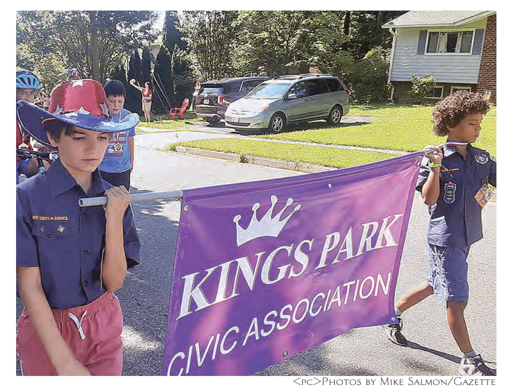
Kings Park in Springfield has a July 4 parade just about every year.