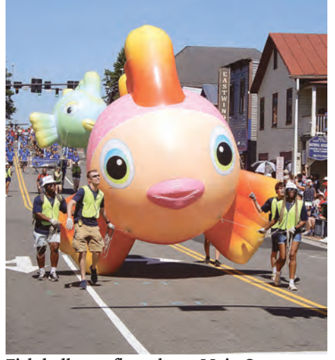
Fish balloons float down Main Street as handlers lower the one in front to fly under the next set of power lines.