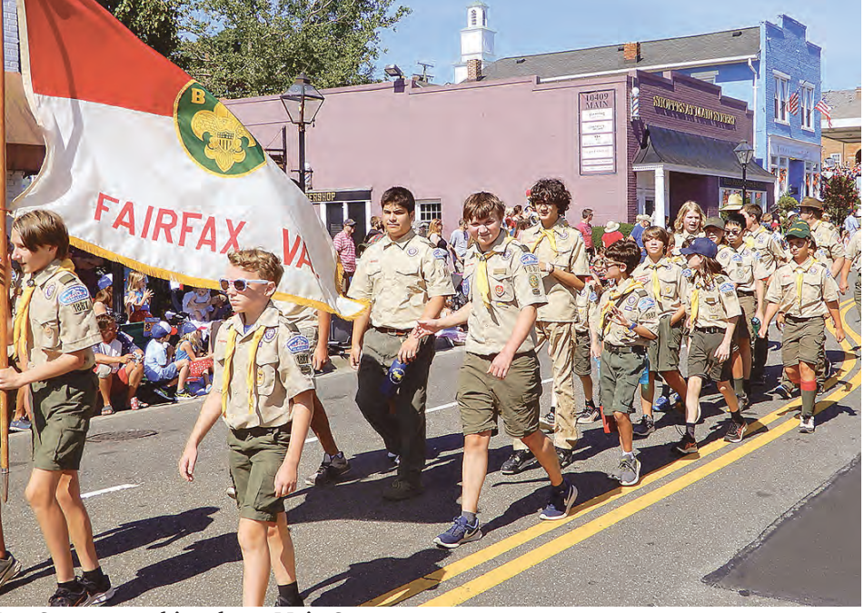
Boy Scouts marching down Main Street. 10 🚸 Burke / Fairfax / Fairfax Station/Clifton/Lorton / Springfield 🕏 July 6-12, 2022