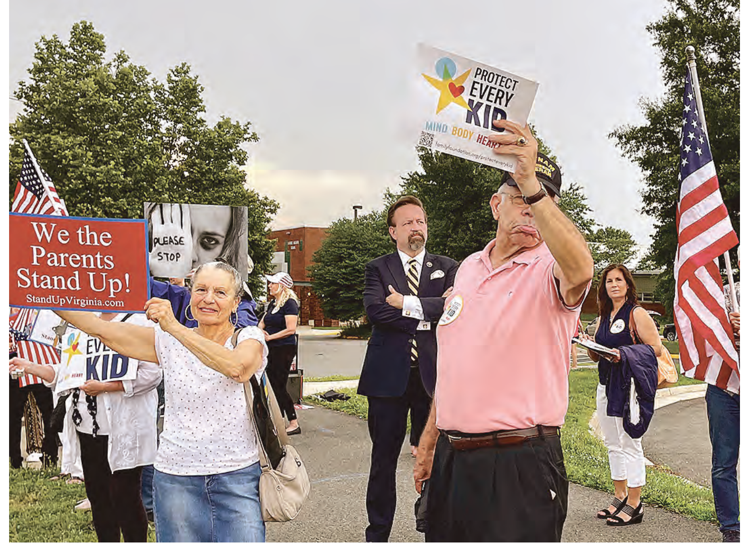
Center back, Sebastian Gorka, former deputy assistant to President Donald Trump (2017), watches protestors hold signs from See Pride, Page 9 Stand Up Virginia and The Family Foundation. "The transgender movement in America today is evil," Gorka said. 8 & Burke / Fairfax / Fairfax Station/Clifton/Lorton / Springfield & July 6-12, 2022 www.ConnectionNewspapers.com