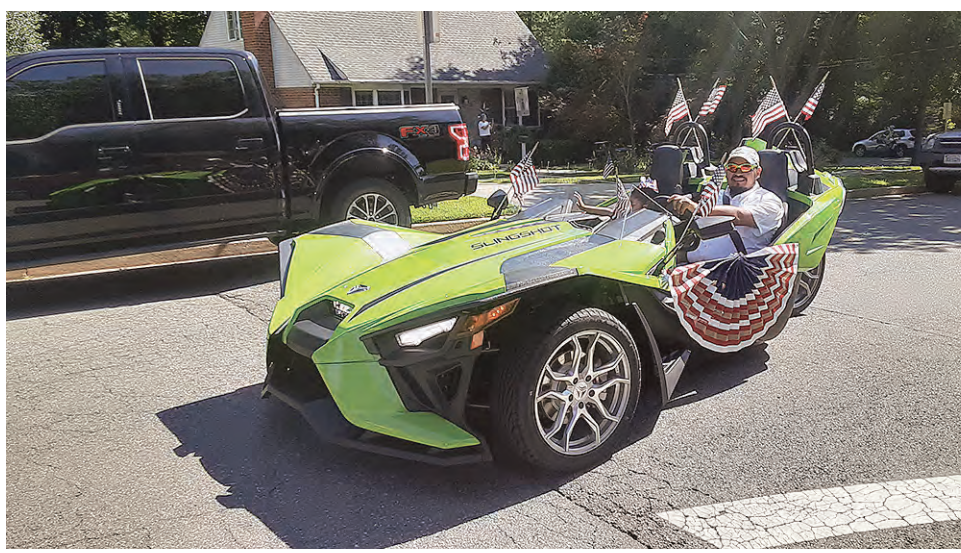
Is it a car or a motorcycle?