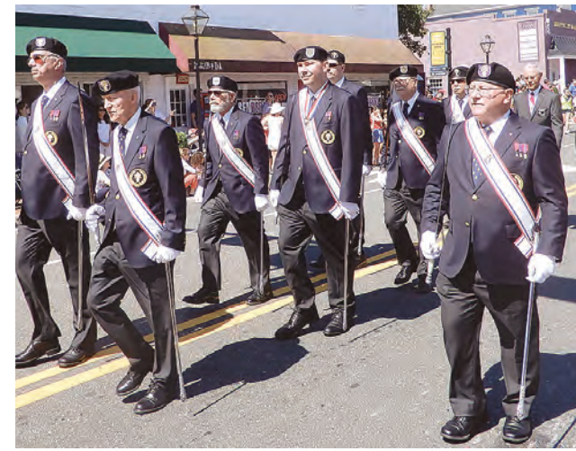
The Knights of Columbus