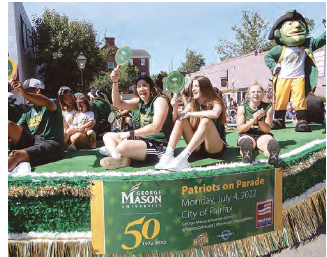
GMU students celebrate 50 years.