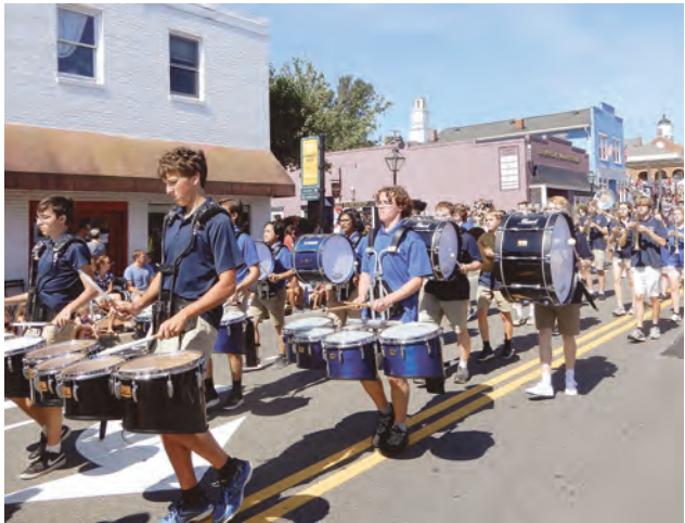
Woodson High's Marching Band