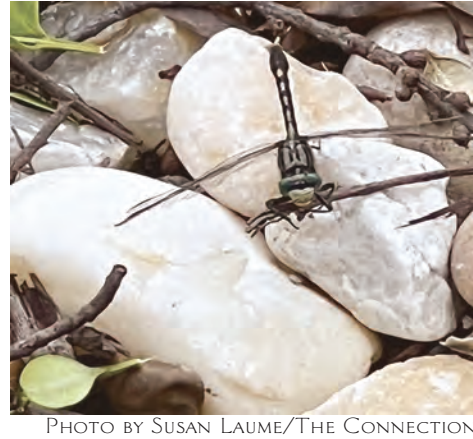
Survey identifies an uncommon Unicorn Clubtail dragonfly at Point of View,

along with survey results are available on the Audubon website at www.audubonva.org.