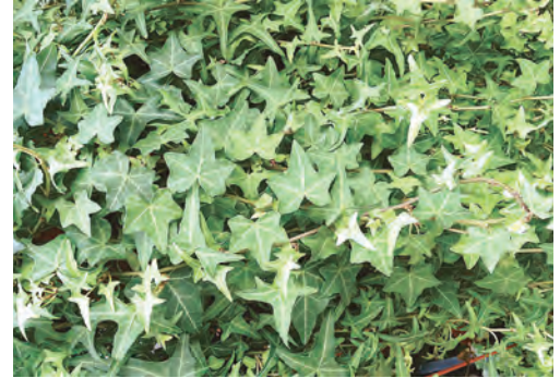
English Ivy (Hedera helix) spreads heavily across all levels of vegetation and can quickly overwhelm and outcompete native plant species.

What else can we do to combat this problem? First, it is important to learn what an invasive plant species is, which ones have become endemic in our area, and how we can all work together to protect our native plant species.