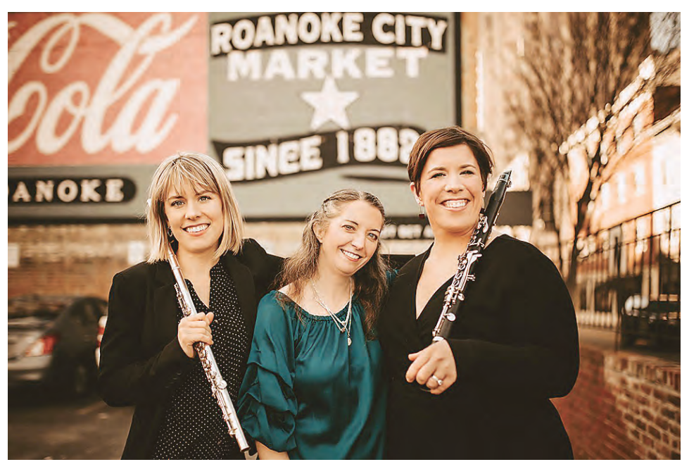
The Alma Ensemble will appear at Workhouse Arts Center on Sunday, July 17, 2022