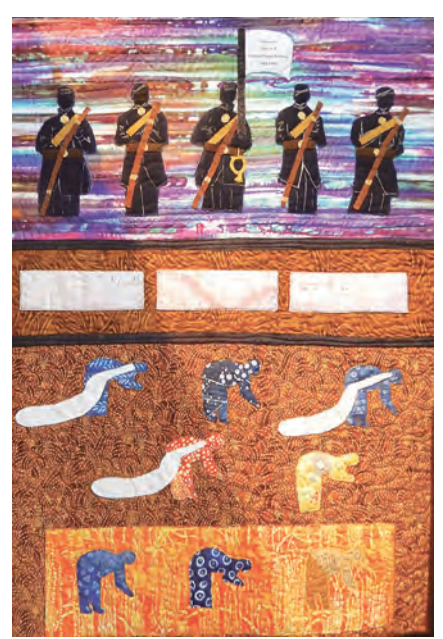
Peace & Brotherhood: "Up from Slavery" is about an enslaved couple who worked in the fields, but escaped to freedom in another state, where the husband joined the Union Army.