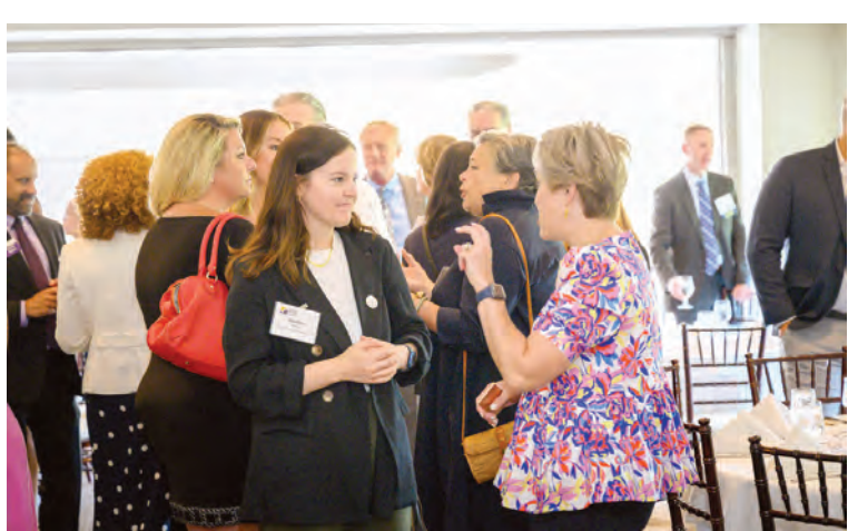
Attendees at GRCC's 2022 Awards for Chamber Excellence.