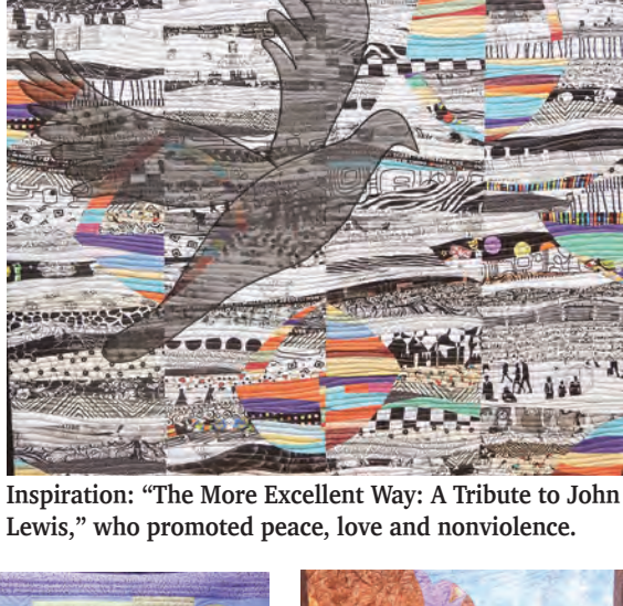
Lewis," who promoted peace, love and nonviolence.