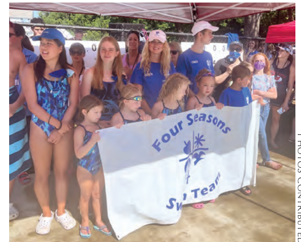
Four Seasons Swim Team.

The final days of the Herndon Swim League season draw near. All-League Meets @ Four Seasons are July 23. Swimmers, take your mark.