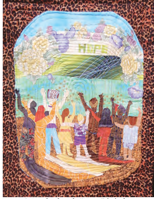
Peace & Brotherhood: "Hope" is in honor of the late Supreme Court Justice Ruth Bader Ginsburg.