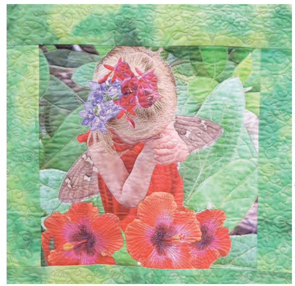
Joy: "Innocent Prayer" of a young girl.