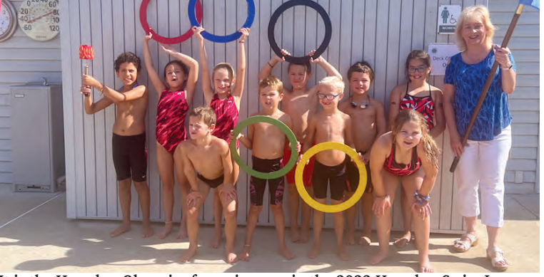
It is the Herndon Olympics for swimmers in the 2022 Herndon Swim League.