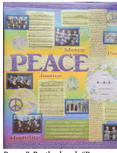
Peace & Brotherhood: "Peace and Harmony" honors voices worldwide joined for good.