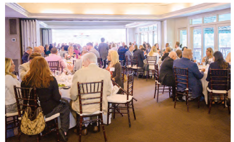
Attendees at GRCC's 2022 Awards for Chamber Excellence.