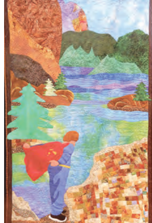
Inspiration: "Learning to Fly" is about this quilter's grandson, who has autism. but keeps trying new things.