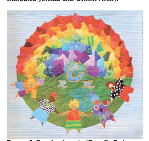
Peace & Brotherhood: "Remi's Rainbow" celebrates global diversity.