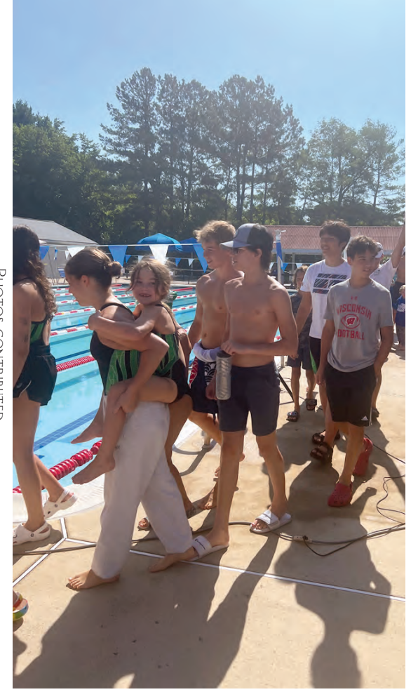
The 2022 Herndon Swim League swimmers at the July 23 Opening Ceremony of the Herndon Olympics.