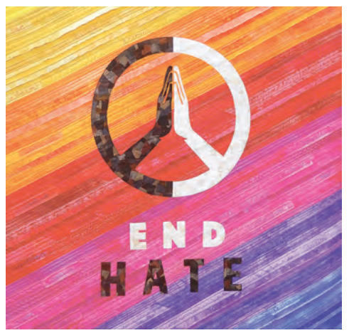
Peace & Brotherhood: "Peace in our Hands" is self-explanatory.