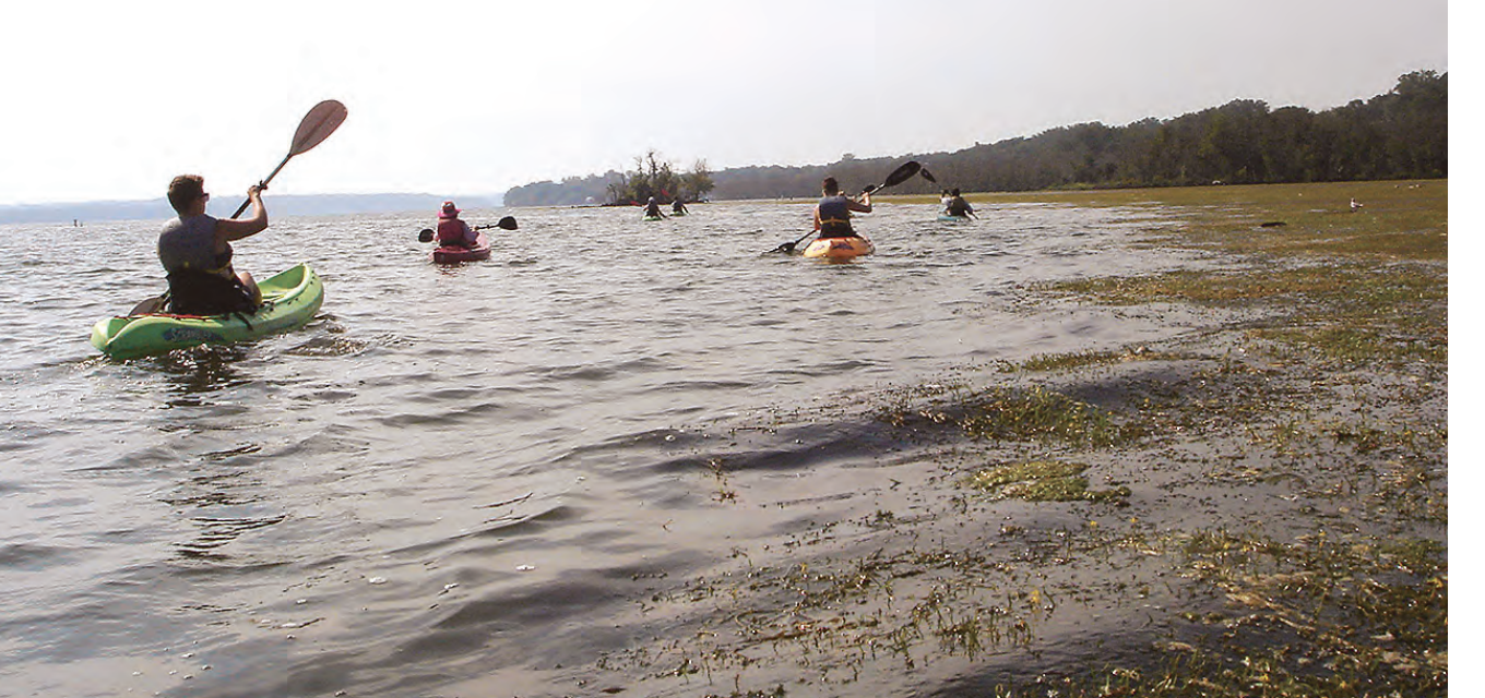
Paddlers on the Potomac River

sphere is bringing more extreme weath- and triple by 2080." er and flooding to the region. More severe storms dump more sediment and pollution mac River felt like bath water," said the re- gree temperature difference between redinto rivers. Droughts are becoming longer. A port, with a record water temperature of 94 lined versus non-redlined areas. www.ConnectionNewspapers.com