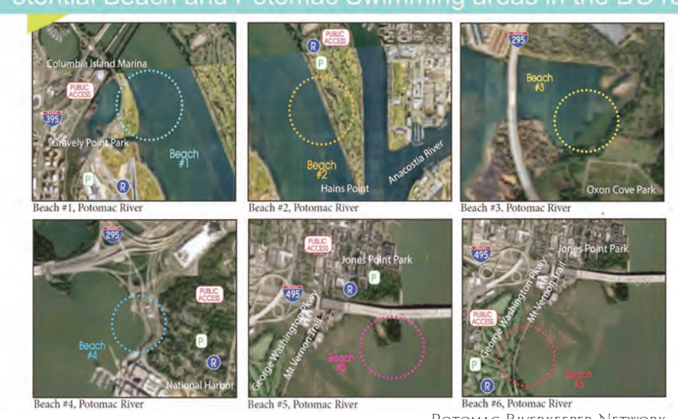
Map of potential public beaches

but asserts that some areas are "often clean ington region. In Virginia, possible sites are Will We Swim in "Bathwater"? Showing a 1918 photo of swimmers on a enough to swim at public access points such Jones Point Park, an area just north of Belle