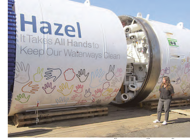
On July 14, AlexRenew introduced the public to the German-made tunnel boring machine which they named "Hazel."