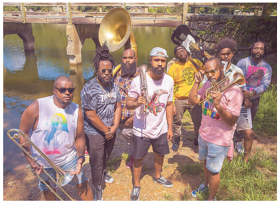
The DuPont Brass will perform at McLean Central Park on Sunday, July 31, 2022 in McLean.