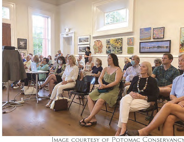
A forum on the health of the Potomac River at the Athenaeum in Alexandria on July 20.