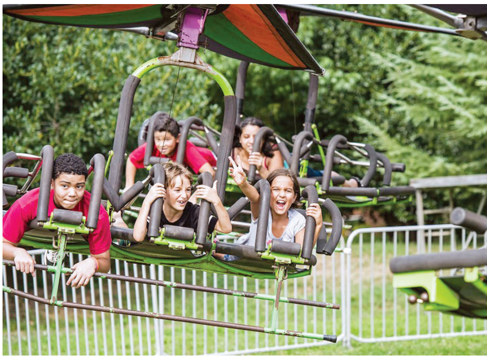
The Arlington County Fair will be held Aug. 17-21 in Arlington.