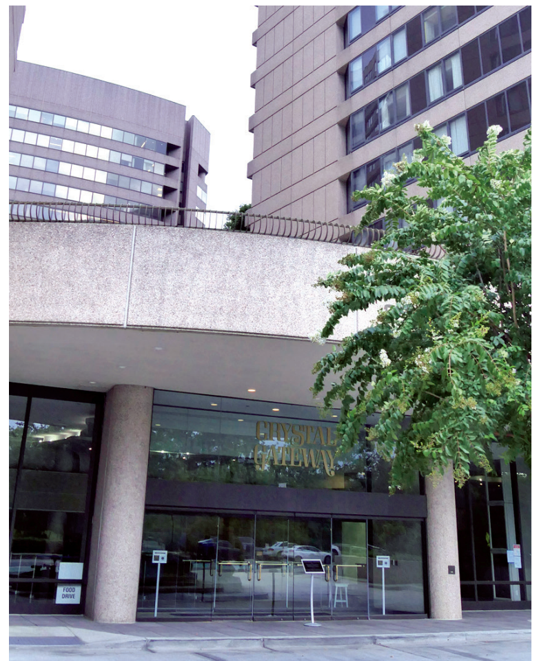
Crystal Gateway Condominiums at 1300 Crystal Drive.