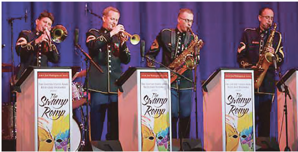
The Swamp Romp will play at Frying Pan Park in Herndon on Thursday, Aug. 18, 2022.