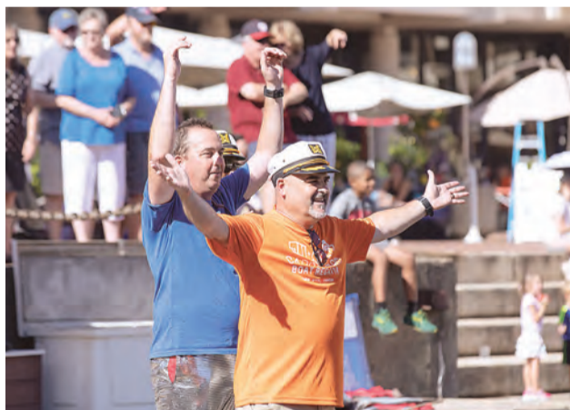
An arms up welcome