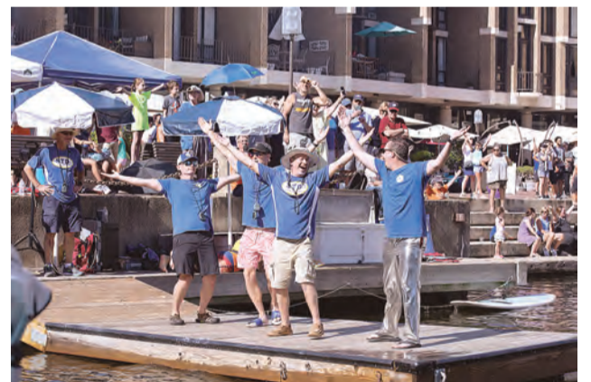
The welcoming dance of joy by the S.T.D.s (Swim Team Dads)