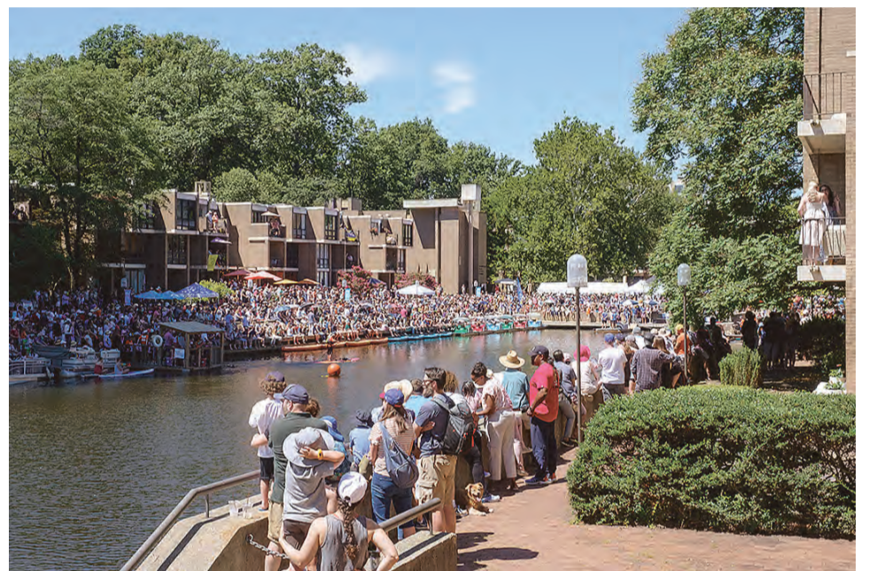
The crowd packs eight and nine deep to watch the 2022 Lake Anne Cardboard Boat Regatta. It is a project of the Reston Historic Trust.