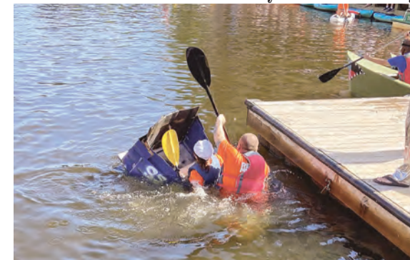
Seaworthy or not, the fun is in trying for the crew of Soggy Bottom.