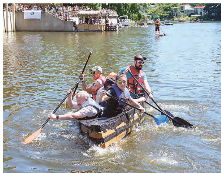
Paddling is harder coming back to the dock.