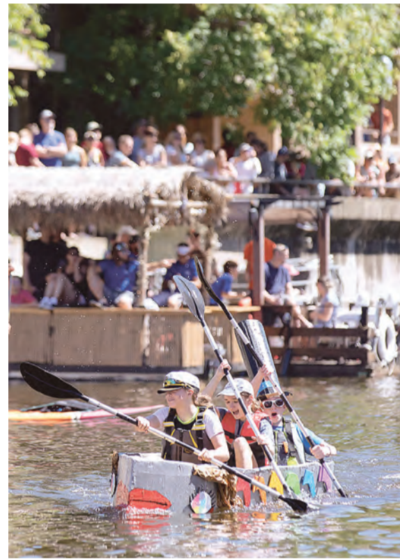
The finish line is in sight for these competitors in the 2022 Lake Anne Cardboard Boat Regatta in Reston, a project of the Reston Historic Trust.