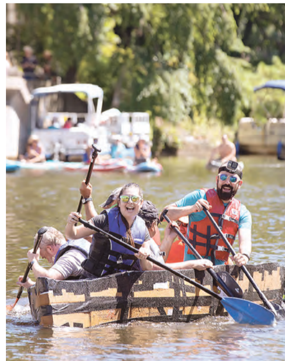
Paddling is harder coming back to the dock.

4 ♦ OAK HILL/HERNDON / RESTON / CHANTILLY CONNECTION / CENTRE VIEW ♦ AUGUST 17-23, 2022