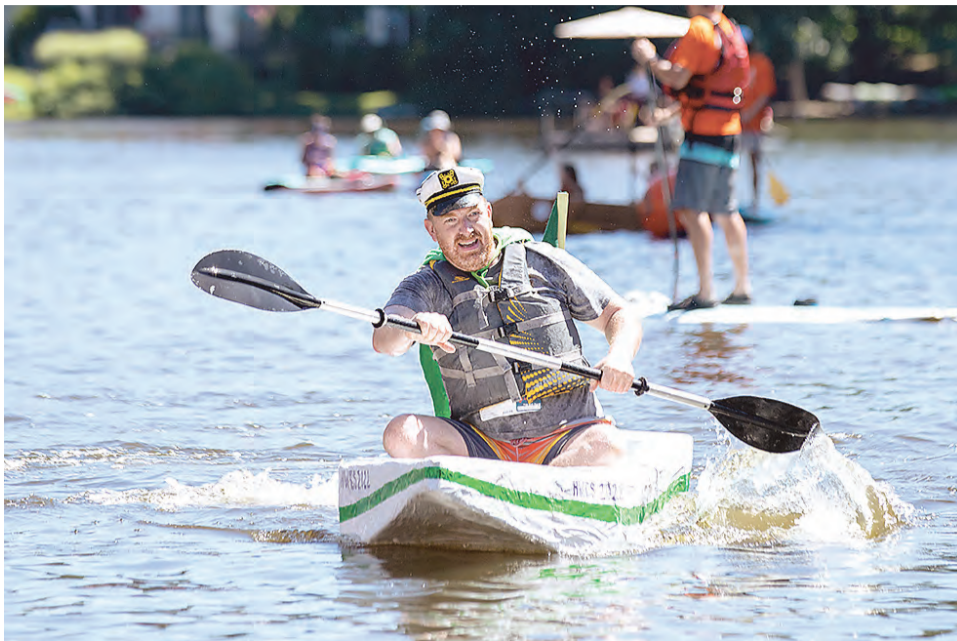
Paddling is harder coming back to the dock.