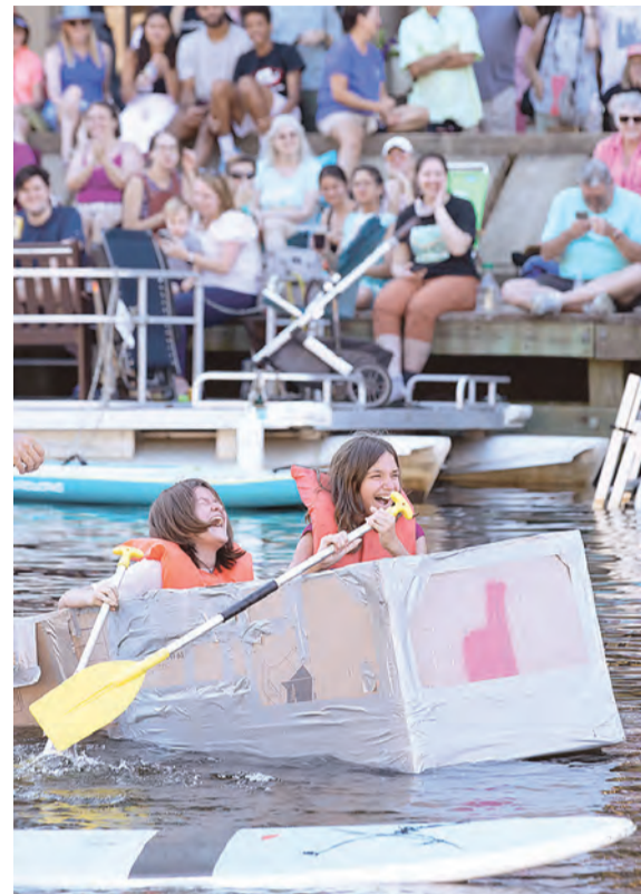
It's all about the fun at the 2022 Lake Anne Cardboard Boat Regatt.