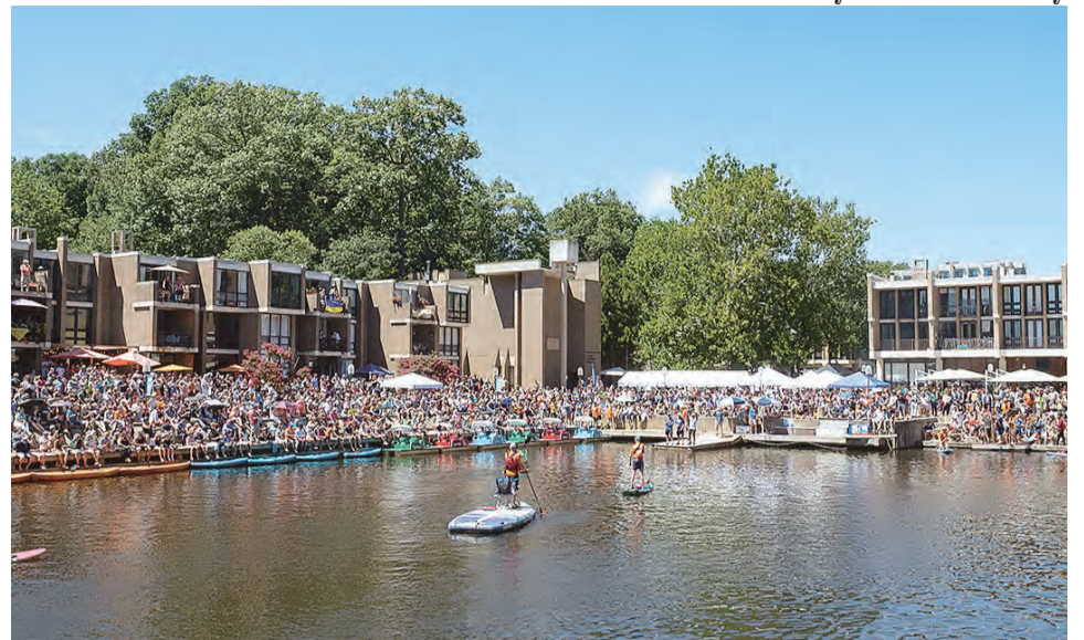
Thousands reportedly attended the 2022 Lake Anne Cardboard Boat Regatta.