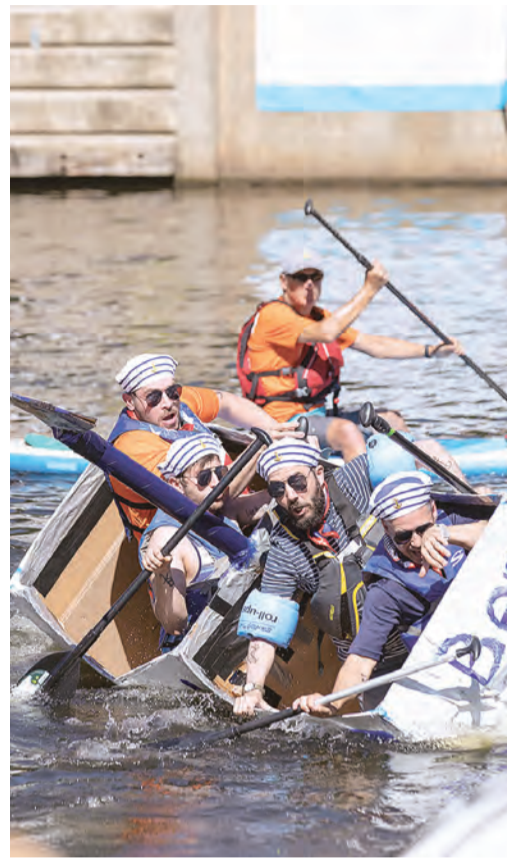
A splashing event.