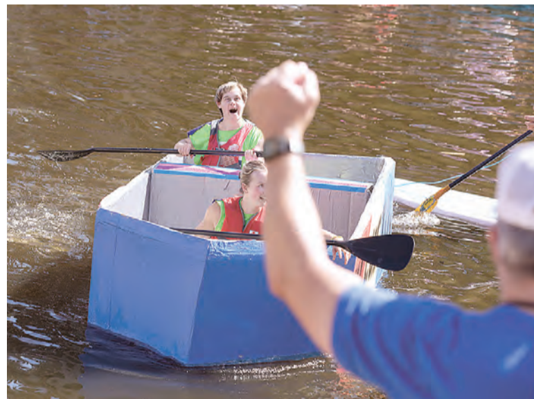
The support of family and friends fosters a sense of Reston pride.

Preregistration for next year’s event, Aug. 12, 2023, can be completed at https://www.restonmuseum.org/cardboard-preregister .