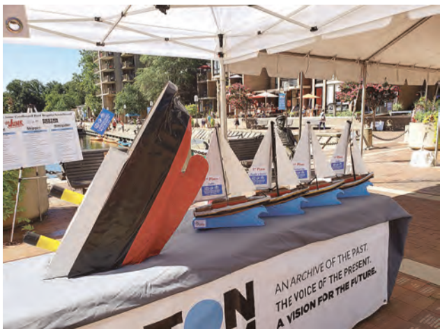
Awards for the best of the best