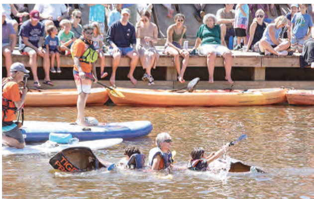
A slam dunk