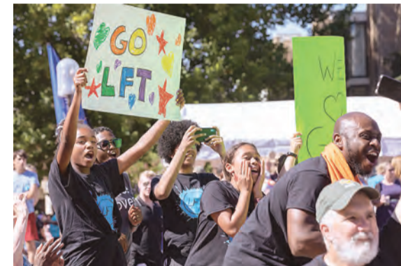
The support of family and friends fosters Reston pride.