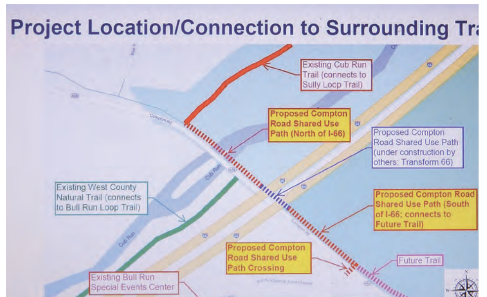
This map shows how the Compton Road Path would connect to other trails.