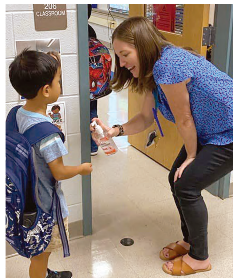
Back to School at Stenwood Elementary School in Vienna.