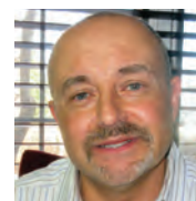
Kyle Knight Ins Agcy Inc Kyle Knight, Agent 11736 Bowman Green Drive Reston, VA 20190

ACROSS FROM RESTON TOWN CTR WWW.KYLEKNIGHT.ORG 703-435-2300