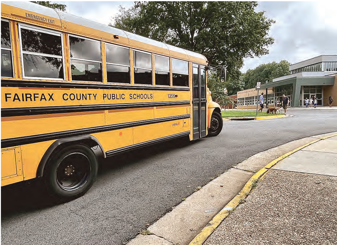
FCPS buses begin pulling into Forestville School in Great Falls. FCPS is hiring bus drivers as some drivers must “double back” and cover additional routes for some schools. Parents can check the FCPS app “Here Comes the Bus.”