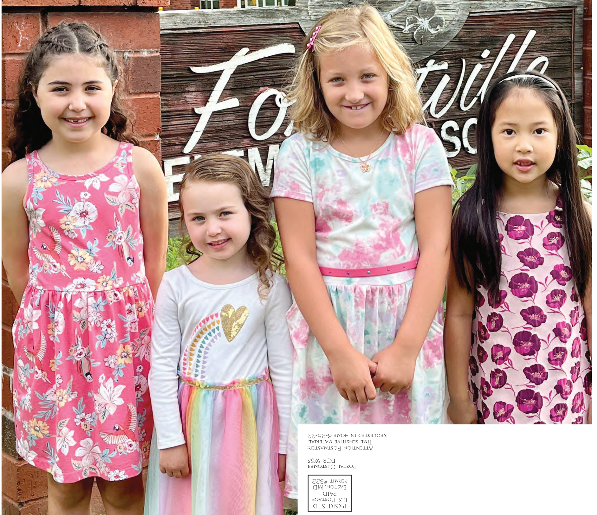
SENIOR LIVING, PAGE 2 ❖ CLASSIFIED, PAGE 6 ❖ ENTERTAINMENT, PAGE 7

POSTAL CUSTOMER ECR WSS ATTENTION POSTMASTER: TIME SENSITIVE MATERIAL REQUESTED IN HOME 8-25-22