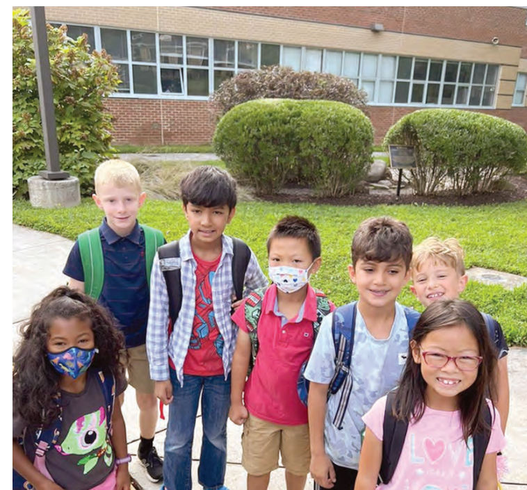
Great Falls ES

Sign up for FREE DIGITAL SUBSCRIPTION to all of our papers www.connectionnewspapers.com/subscribe