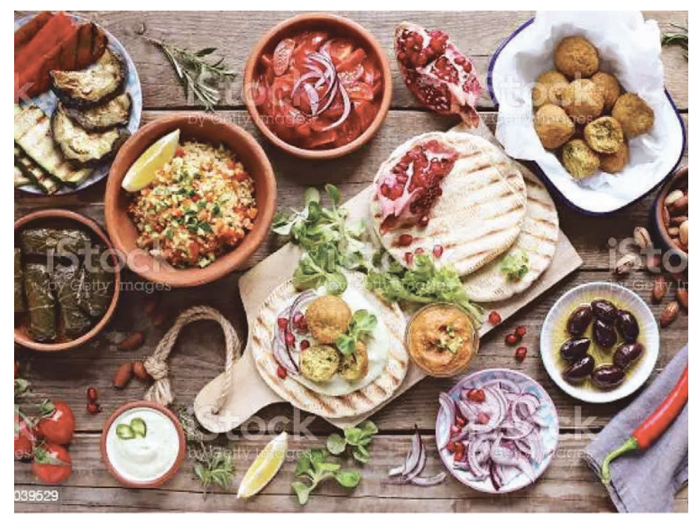
The 29th Middle Eastern Food Festival will take place Sept. 3-4 at Holy Transfiguration Church in McLean.