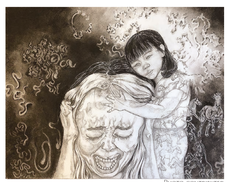
Syu, Josephine. "Untitled" (2022), (Josephine Syu - Josephine) www.ConnectionNewspapers.com