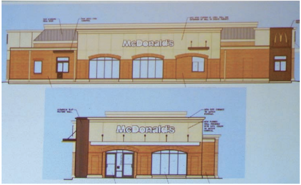
Artist's rendition of the front of the new McDonald's at the Village Center.

He said double ordering lanes will help www.ConnectionNewspapers.com