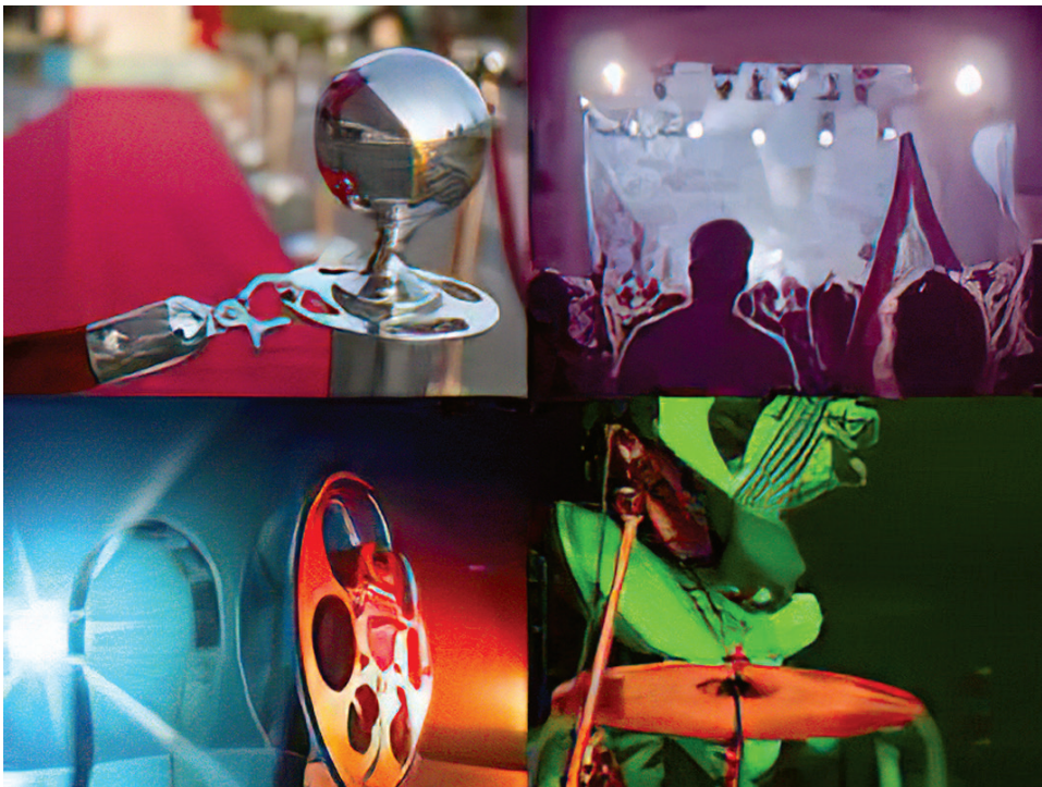
The Concerts on the Green in Great Falls on Sept. 4, 2020 features Hello Cleveland.