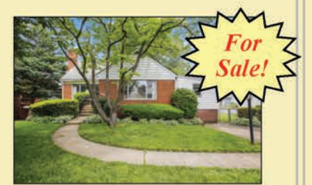
1923 Westmoreland St McLean, 22101 $920,000