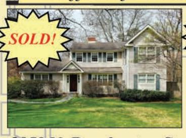
3950 N. Dumbarton St McLean, 22101 $1,400,000