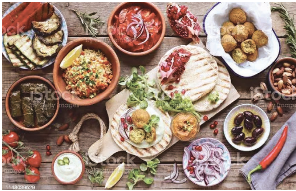
The 29th Middle Eastern Food Festival will take place Sept. 3-4 at Holy Transfiguration Church in McLean.