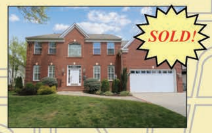
6932 Tyndale Street McLean, 22101 $1,905,000

We're seeing multiple contracts and escalations! Call to chat with JD today!