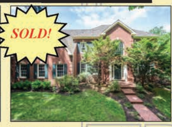
1506 Hardwood Lane McLean, 22101 $1,582,000