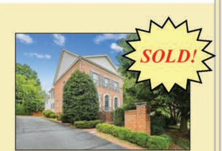
1564 Great Falls Street McLean, 22101 $1,223,000