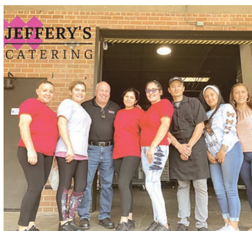
Thank you to the Jeffrey's Catering staff who prepare meals every day for our Meals on Wheels clients.