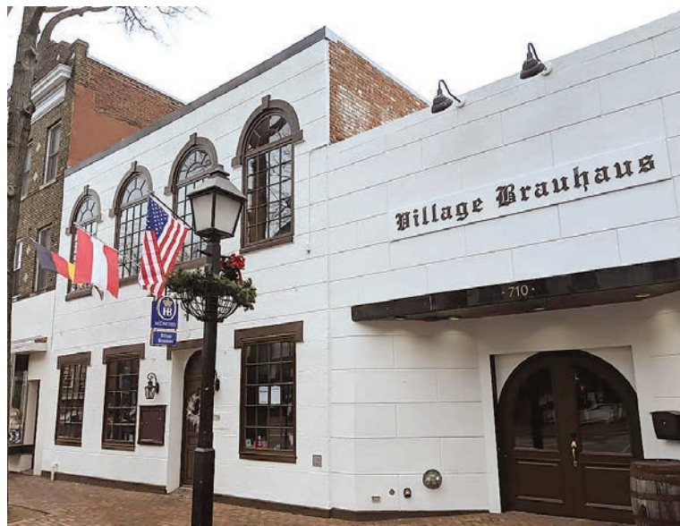
Oktoberfest season is back at Village Brauhaus with live music and specials on food and beverages.

To celebrate Old Town Cocktail Week, Lost Boy is hosting a soiree featuring a new series of cider cocktails. Come prepared to jump