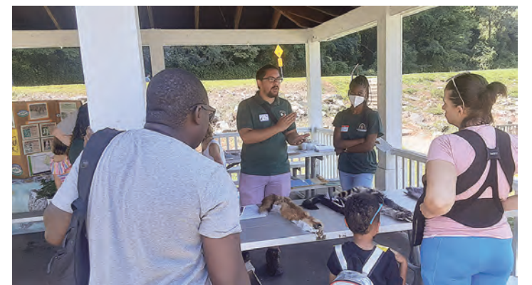
The Friends of Lake Accotink lead a discussion about animals found around the park area.