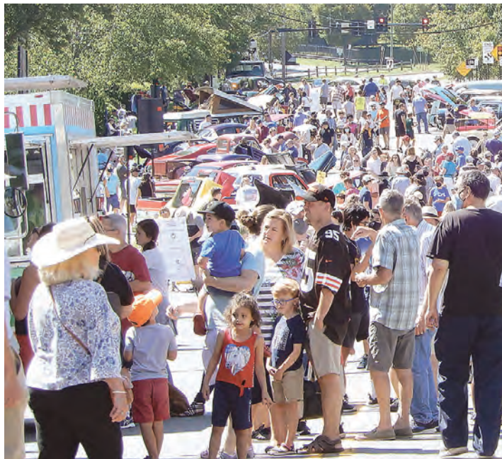
An estimated 6,000 people attended last year's Labor Day Car Show in Fairfax City.

In that area, there will be food and beverages for sale. Lions Club members will be grilling and selling hot dogs, hamburgers and Italian sausage. Both Rita's Italian Ice