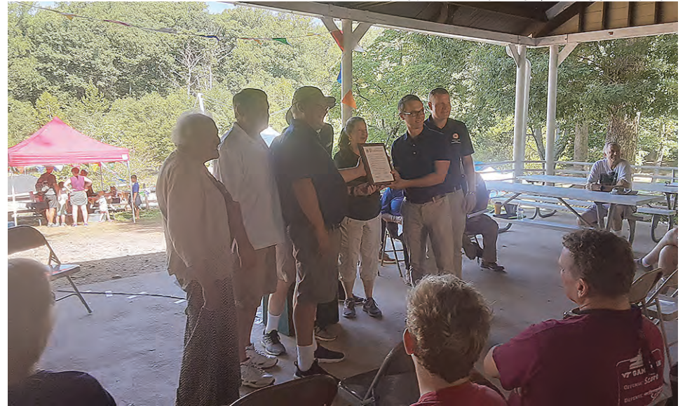
The day was proclaimed "Lake Accotink Park Day."