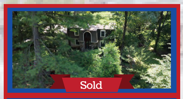
$700,000 - Great Falls 10423 Deerfoot Dr: 5BR, 2FB, 1 HB Sold quickly before it went on the market

DON'T MISS YOUR OPPORTUNITY TO TAKE ADVANTAGE OF THE CHANGING MARKET! CALL US TO DISCUSS OUR PLAN FOR BUYING OR SELLING 703-774-9830