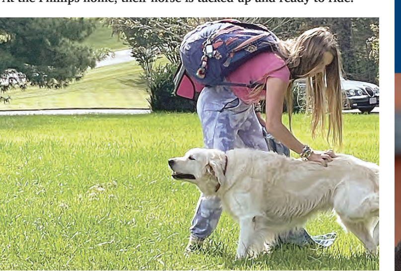
Nothing like a good back scratch to convey love. www.ConnectionNewspapers.com