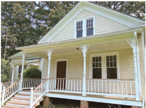
Old Forestville Schoolhouse

All Events sponsored by The Art of Great Falls