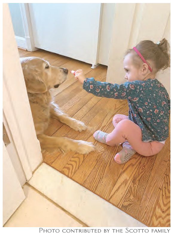
Pooch Cassidy is a good sport, getting a makeover with play lipstick.