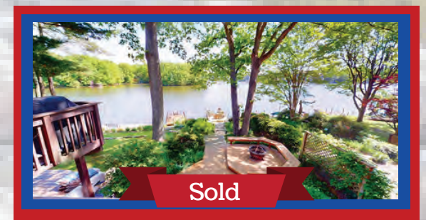
$978,000 - Reston 2012 Lakebreeze Way: 4BR, 3FB, 1HB Won the contract in a multiple offer situation without the highest priced offer.

We've raised over $2,000,000 for Military Support Organizations through our Military Appreciation Mondays Event!