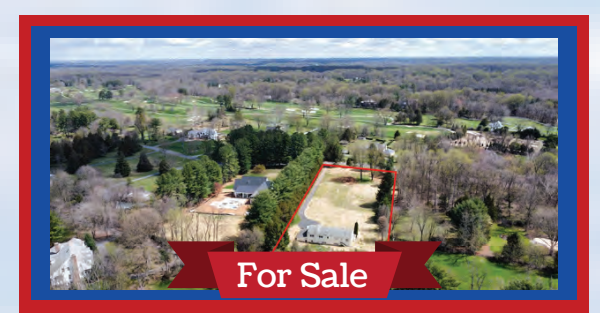
$1,575,000 - Great Falls 510 Arnon Meadow Private, flat 2.4 acre lot in the heart of Great Falls.