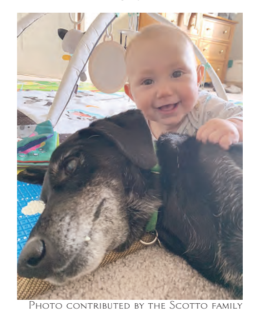
India, the grey-muzzled Scotto family dog, shows her little human sibling how