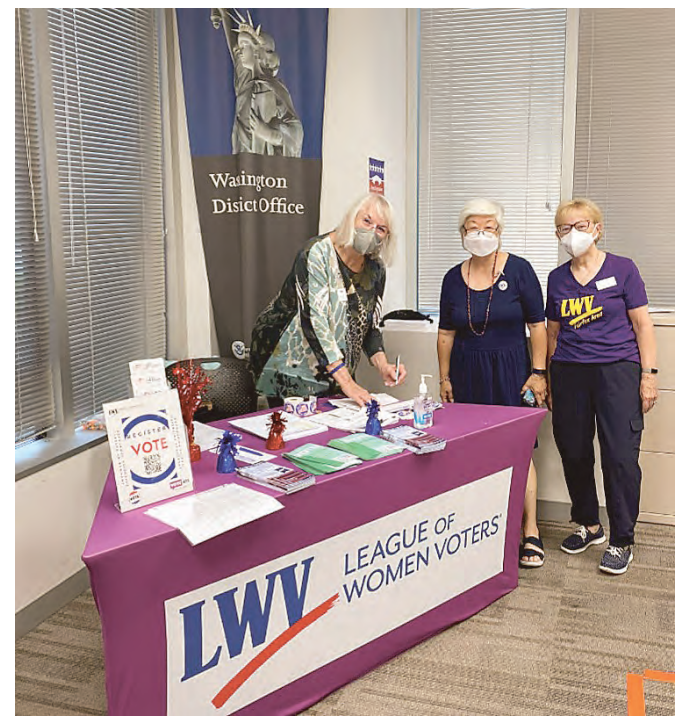
Since April, more than 160 local League volunteers have spent close to 600 hours registering over 2,300 new citi-