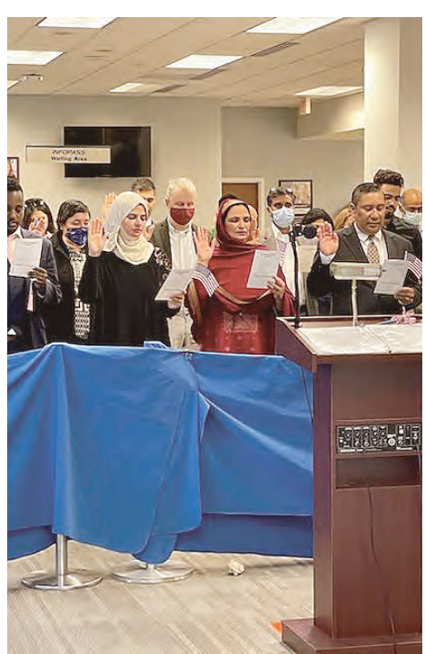
Many new citizens have prepared for years to meet the stringent requirements to take the oath of citizenship,