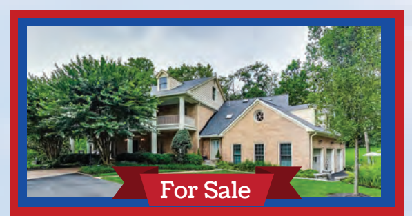
$2,800,000 - Great Falls 11316 Inglish Milld Dr: 9BR, 6FB, 1HB Learn more and take a virtual tour at www.InglishMill.com