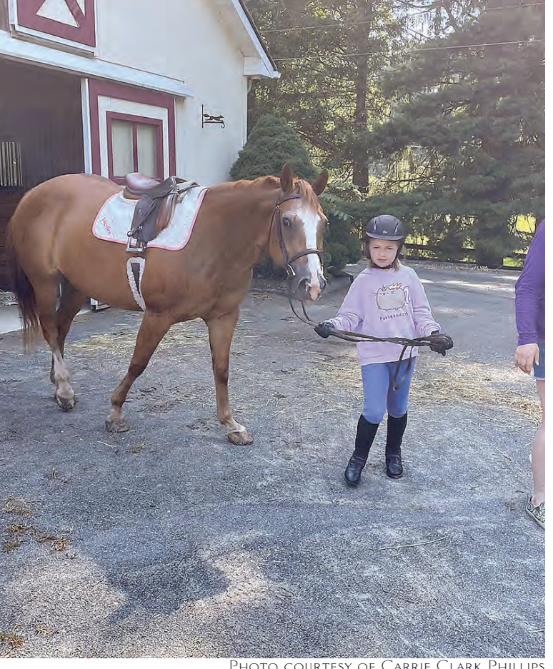
At the Phillips home, their horse is tacked up and ready to ride.