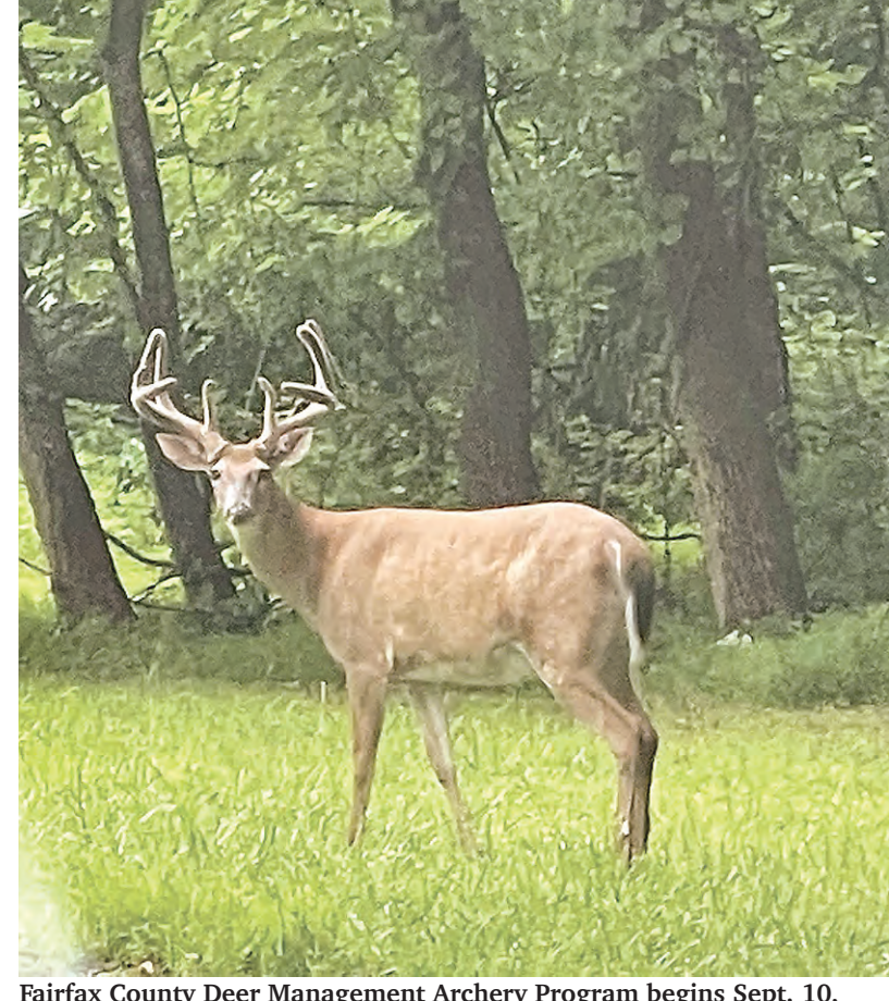
Fairfax County Deer Management Archery Program begins Sept. 10, 2022, and runs through Feb. 18, 2023.

Archers are also required to have completed additional training through the International Bowhunter Education Program to participate in the Fairfax County Deer Management Program. All archers must also pass a criminal background check to be eligible for the program. Only hunters that have gone through this screening and selection process