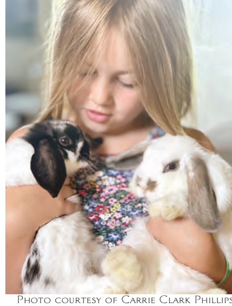
In the Phillips household, live lop-eared bunnies make good pets.