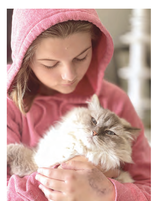
The Phillips family includes the fluffiest kitty with the longest whiskers.