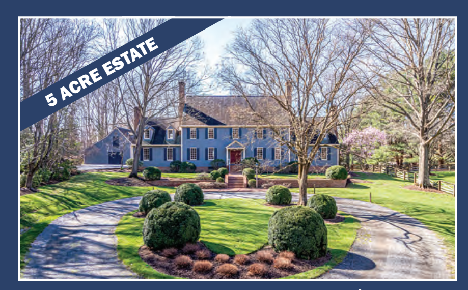
Great Falls $3,130,000