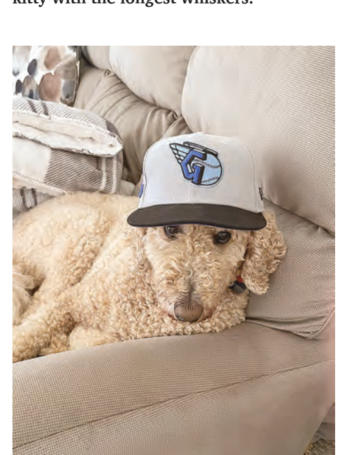
A lap of bunny love is commonplace for the Phillips family. Goldendoodle Ellie dons Hunter's baseball cap.