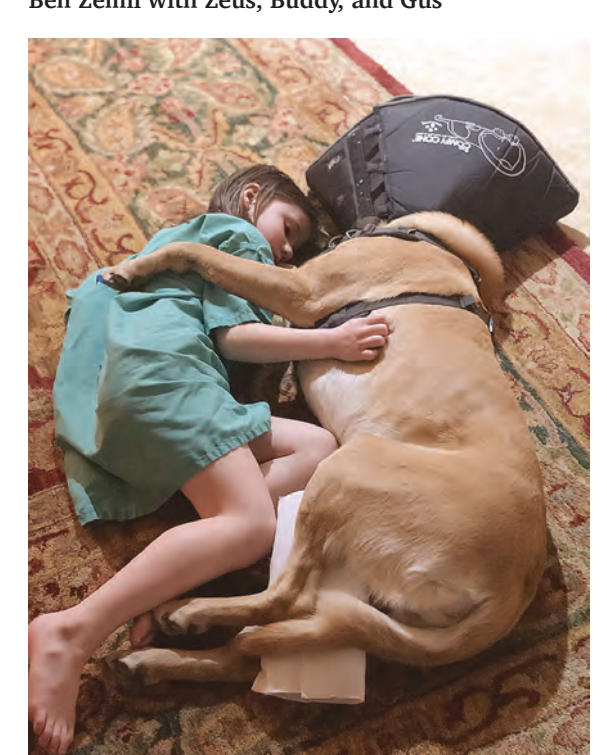
Photo contributed Budding veterinarian Coco Burkholder comforts Sandwich after surgery.