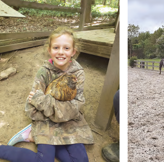
The Scherm family named their chickens after the First Ladies of the United States. Elsa embraces Roz (Carter).