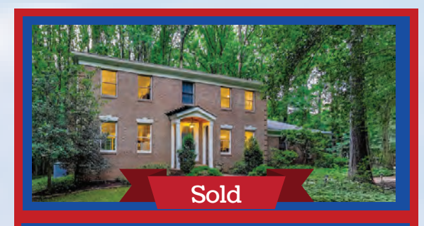
$1,525,000 - Great Falls 714 Gouldman Ln: 4BR, 3FB, 1HB Sold for $225,000 above asking price!