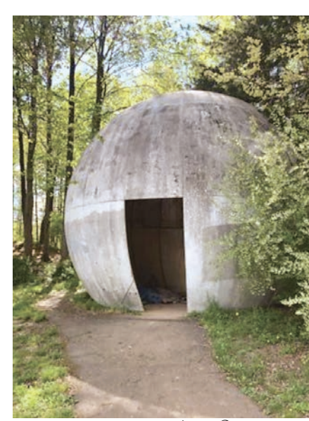
A Nike Missile site in Fairfax County in preparation for defense against enemy aircraft during the Cold War-Great Falls, Fairfax County

Arlington, Alexandria, VA, and Potomac, MD, visit The Connection's website to view our other Newcomers & Community Guides by neighborhoods.