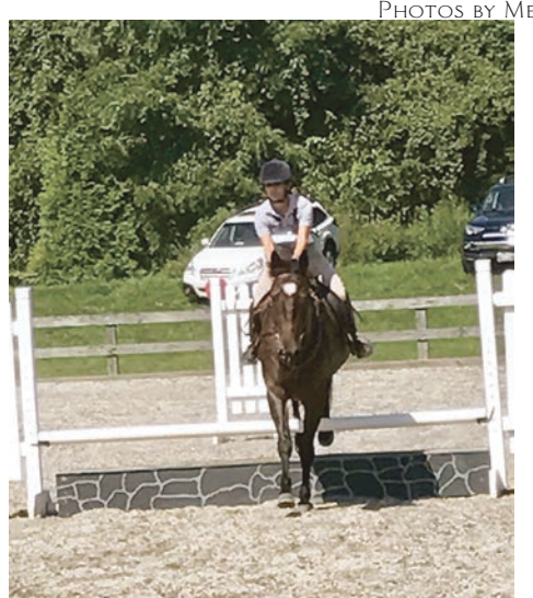
Equestrian Facilities, Turner Farm Park,Runnymede Park, 19925 Springvale Road, Great Falls, VA 22066Herndon, Va. 20170SEPTEMBER 14-20, 2022

Laughlin Avenue Plaza in McLean is a great place if you are looking to grab a cup of coffee and chat or are just looking for a spot to rest in downtown McLean. This 8 • VIENNA/OAKTON / MCLEAN CONNECTION