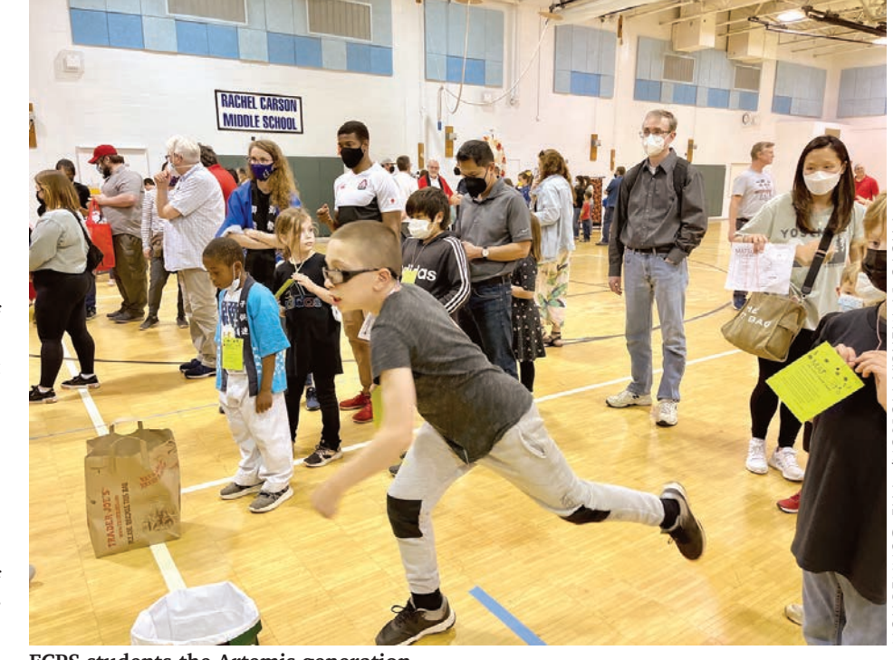
FCPS students-the Artemis generation.

Q2: The universe and the world beyond belong to all. Beyond being an astronaut or an engineer, how can students see a place for themselves in spacefaring? Our children will ask inwardly and aloud, 'Is there