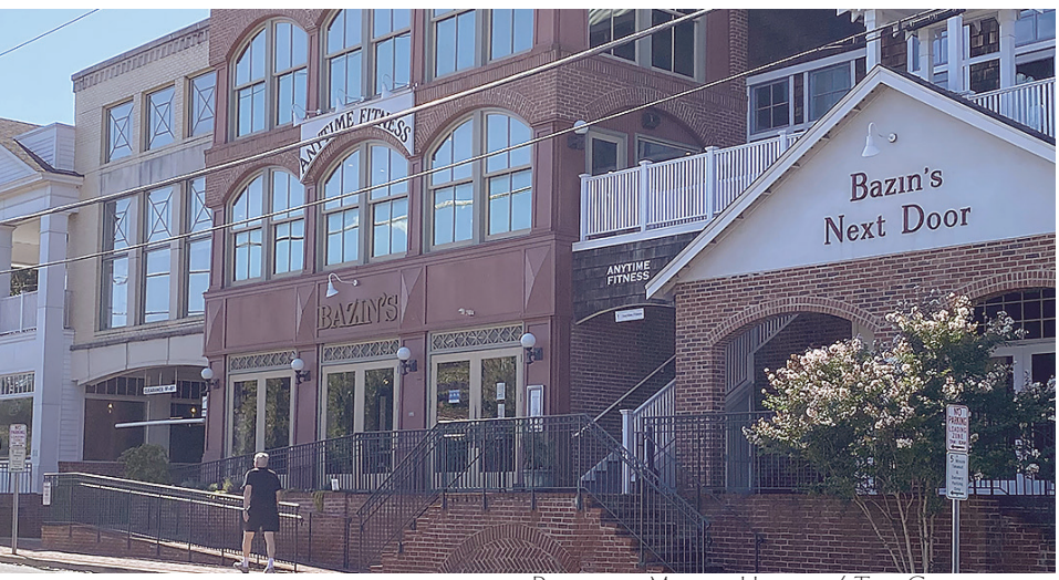
Historic Church Street

The Freeman Store and Museum, formerly the Lydecker Store, is a historic general store located in the Town of Vienna.