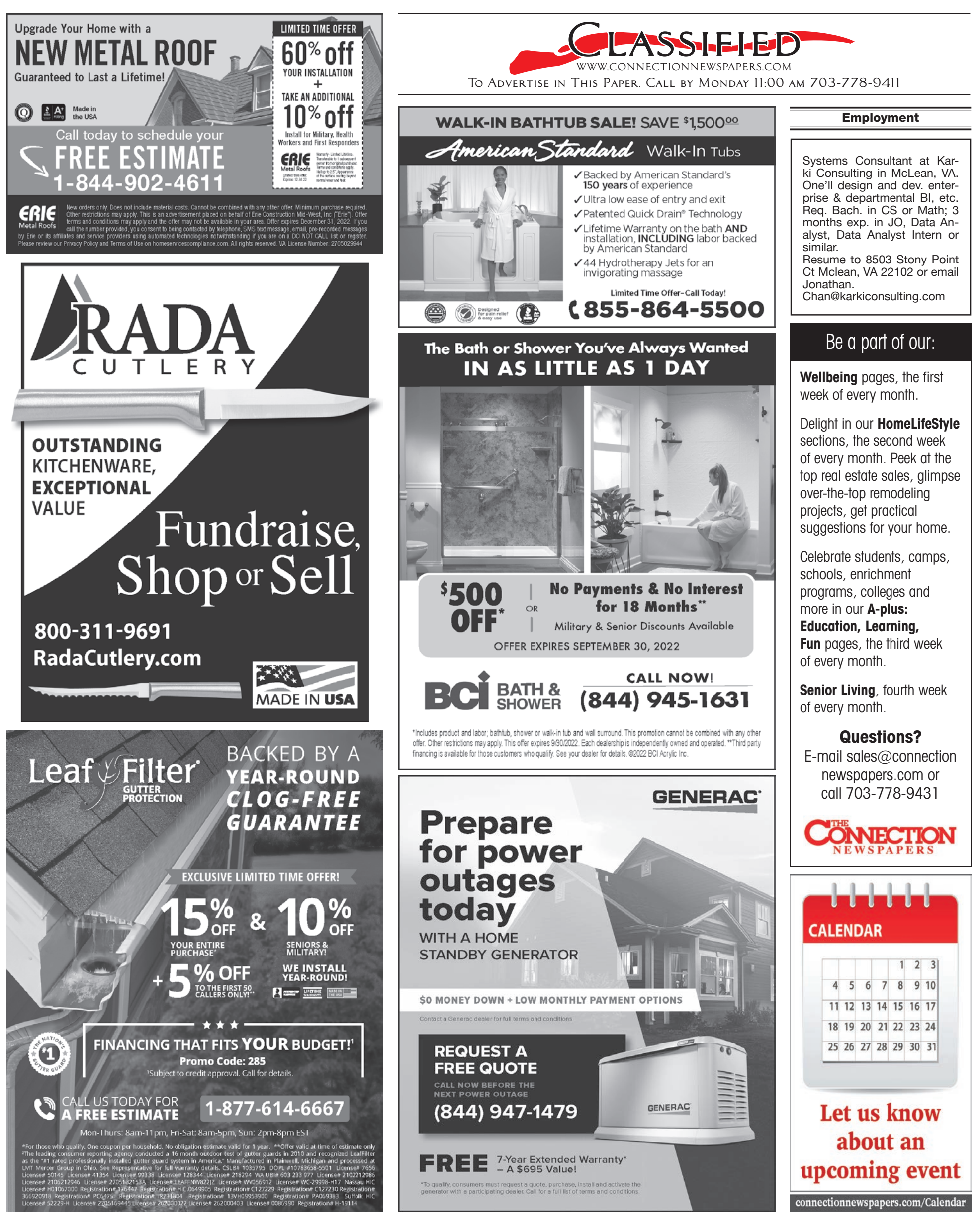
14 ♦ Vienna/Oakton / McLean Connection ♦ September 14-20, 2022