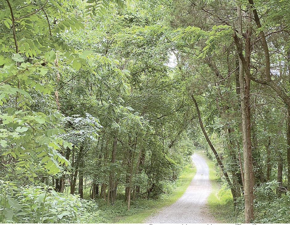
Backcountry at Frying Pan Park in Herndon

JV's Restaurant: This Fairfax County institution at 6666 Arlington Blvd is one of the few places in the County where you can hear www.ConnectionNewspapers.com