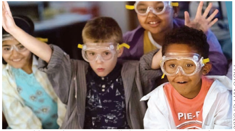
FCPS positions enhancements to eliminate gaps in equity and achievement for all students.

room for me (diversity-wise and employment-wise)?' What will you say?