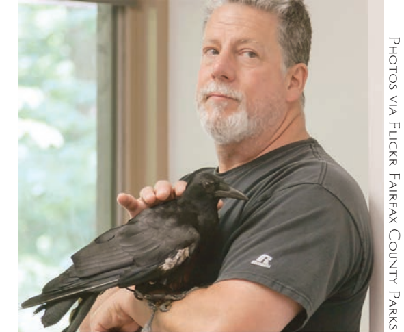
Learn about birds at Hidden Oaks Nature Center.