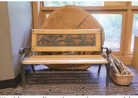
Wood from a tulip poplar tree that was struck by lightning was cut to make a bench.