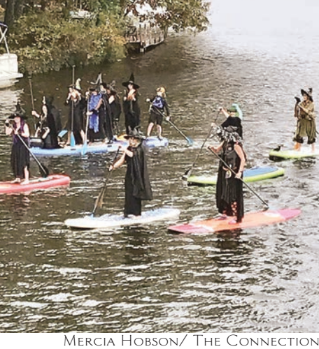
Reston's Lake Anne, where all are welcome, including witches paddleboarding toward the dock for Halloween fun.