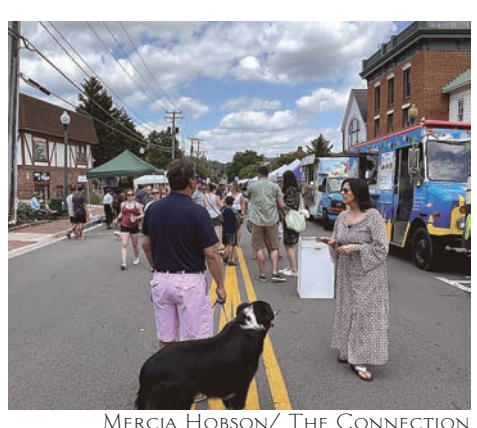
Vienna's Church Street at Viva! Vienna! held Memorial Day weekend 2022

Lake Anne – Lake Anne and its Village Center are often referred to as the heart and soul of Reston. This is the first of Res-