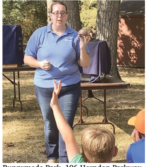
Runnymede Park, 196 Herndon Parkway, Herndon, Va. 20170

unique, terraced park features a water-integrated sculpture with a seating area and is within walking distance of downtown shops, restaurants, and parks. It is located adjacent to the Palladium in McLean and is an ideal gathering place for community residents. -1445 Laughlin Ave., McLean, VA 22101