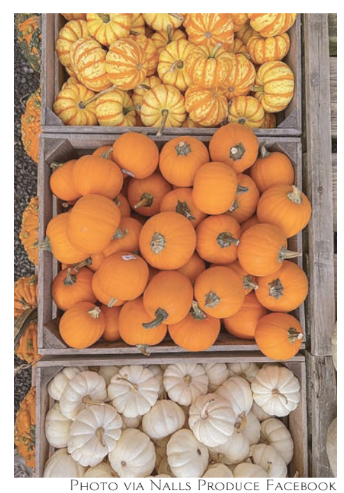
It's Fall, and that means love a pumpkin at Nalls Produce