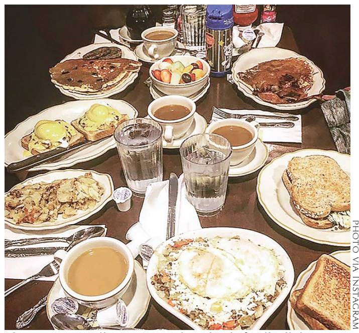
The McLean Family Restaurant is a classic family dining institution. It serves breakfast until 3 p.m., and its flexible menu can find the right meal "for the pickiest of eaters," according to its website.

StarNut Gourmet located at 1445 Laughlin Ave, McLean, is a similar local eatery for breakfast and lunch. It's a family-run establishment that is warm and inviting.