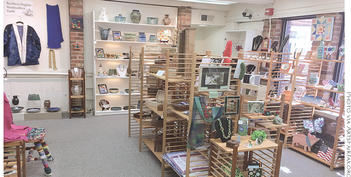
Craft Gallery of Artisans United at The Packard Center in the Annandale Community Park 4022 Hummer Road, Annandale, VA.

10 VIENNA/OAKTON / MCLEAN CONNECTION SEPTEMBER 14-20, 2022