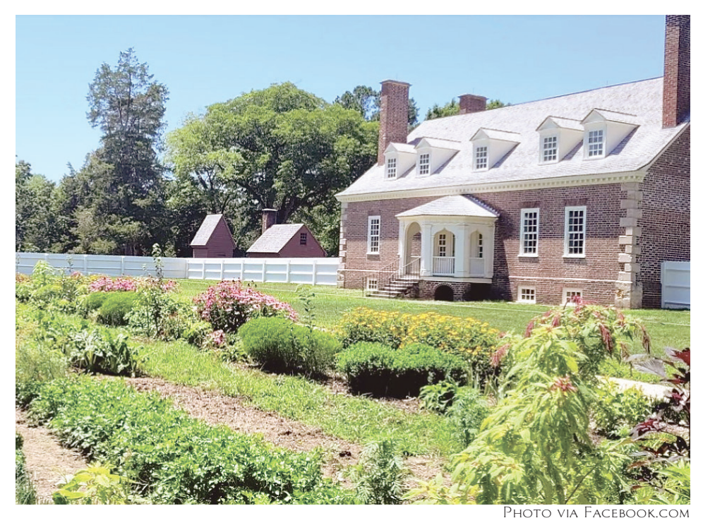
Gardens at Gunston Hall