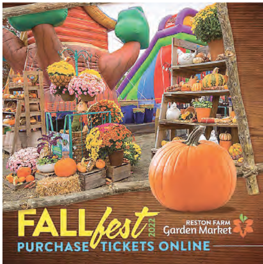
The Reston Farm Garden Market Fall Festival will take place Sept. 24-Oct. 30 in Reston.

Canine Companions. Furry friends and their families are invited to join us for a day of fun, festivities, contests, graduate speakers, dog demonstrations, and more. Register for free at www.canine.org/DogFestWashingtonDC to receive a FREE DogFest bandana for your dog. Canine Companions provides expertly trained service dogs to adults, children, and veterans with disabilities FREE of charge. Celebrate the community of people and dogs that make it possible for Canine Companions to show that the most advanced technology capable of transforming the lives of people with disabilities has a cold nose and a warm heart. www.canine.org/DogFestWashingtonDC