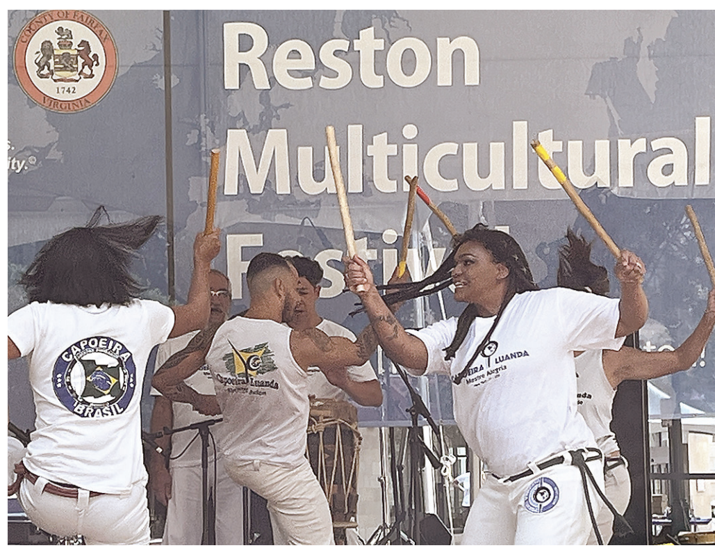
Capoeira Luanda performs Brazil's fast and graceful Capoeira at the Multicultural Festival 2022. It is a blend of dance, martial arts, and acrobatics developed by enslaved West Africans in Brazil in the 16th century.