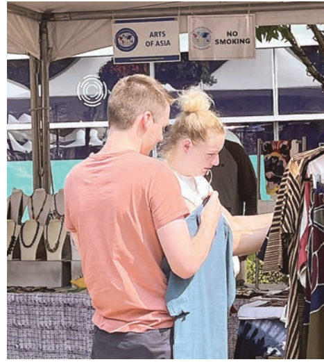
Shoppers browse the textile artisan wares of vendors.