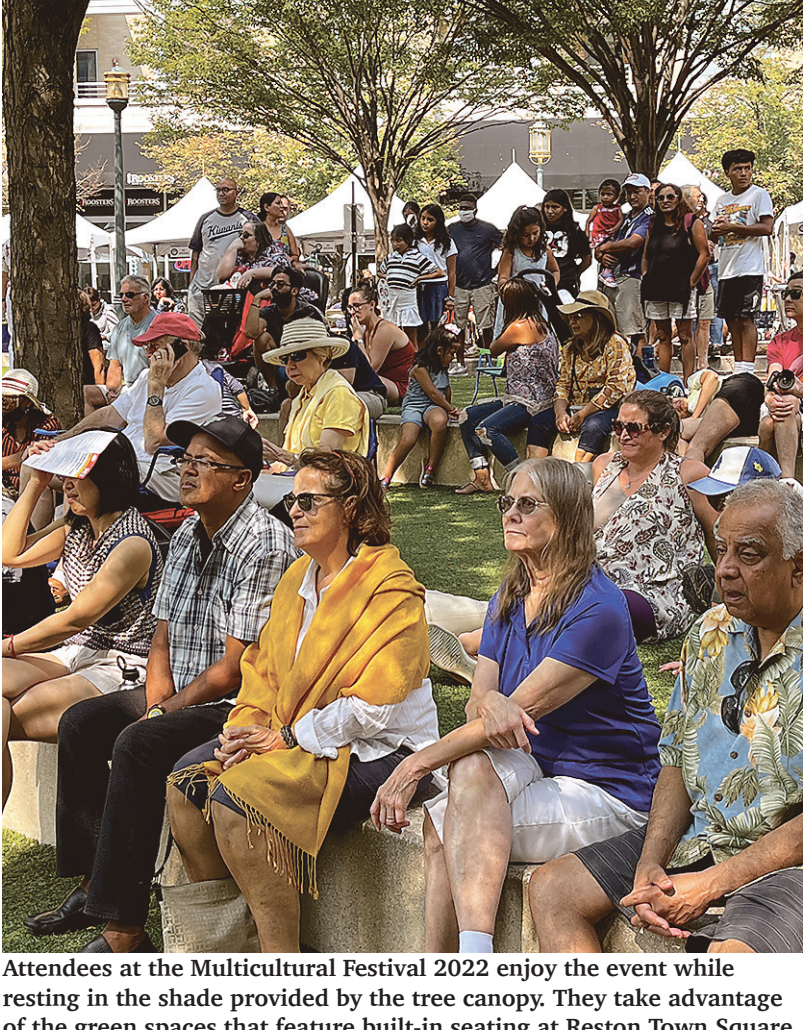
resting in the shade provided by the tree canopy. They take advantage of the green spaces that feature built-in seating at Reston Town Square Park, located at 11900 Market Street in Reston Town Center.