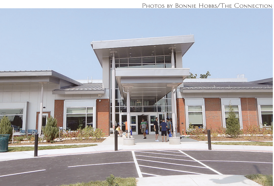
A front view of part of the new Sully Community Center.