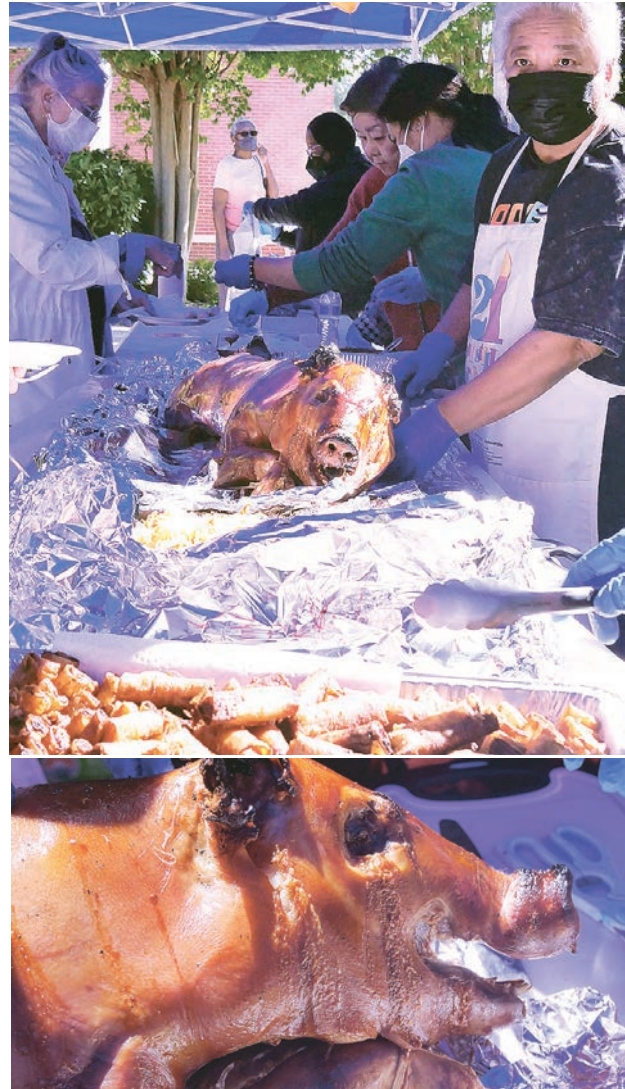
Roasted pig's head is the center of attention at the Philippine table where a plate of lechon, pancit and spring rolls is offered for 12 tickets.