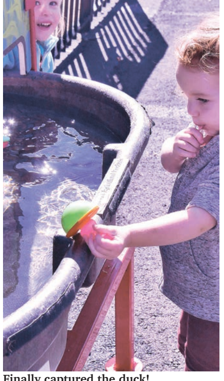
Finally captured the duck!

St. Ann's parish held its first lawn fete on an empty lot in 1947 when they were for-