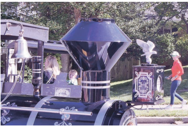
A miniature locomotive provided by Big Country Amusement, chugs filled with waving children around the street outside the fair.