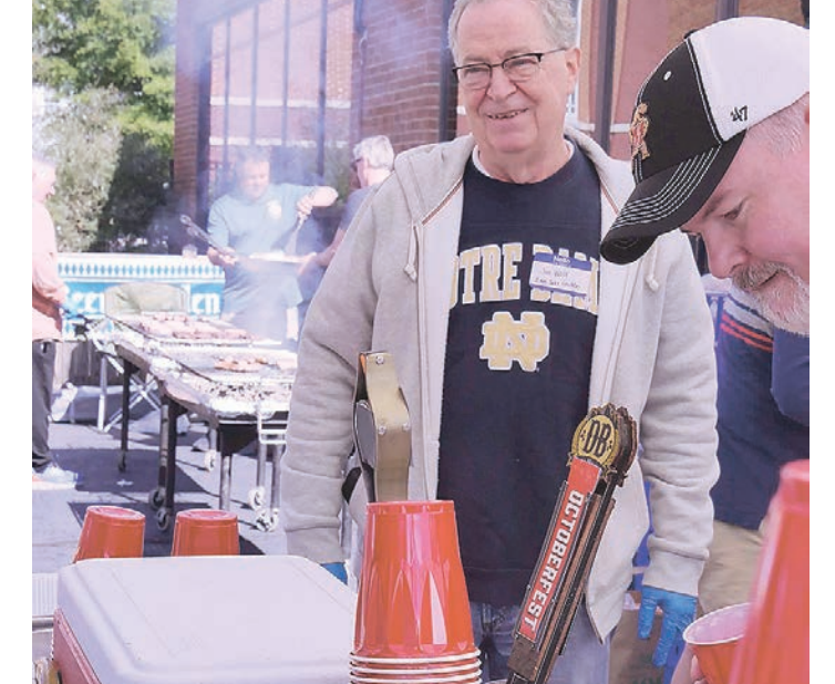
Beer Garden is doing a brisk business with pitchers of keg beer and grilled brats.