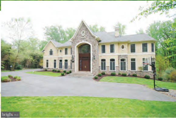
5 10315 Riverwood Drive — $2,449,800