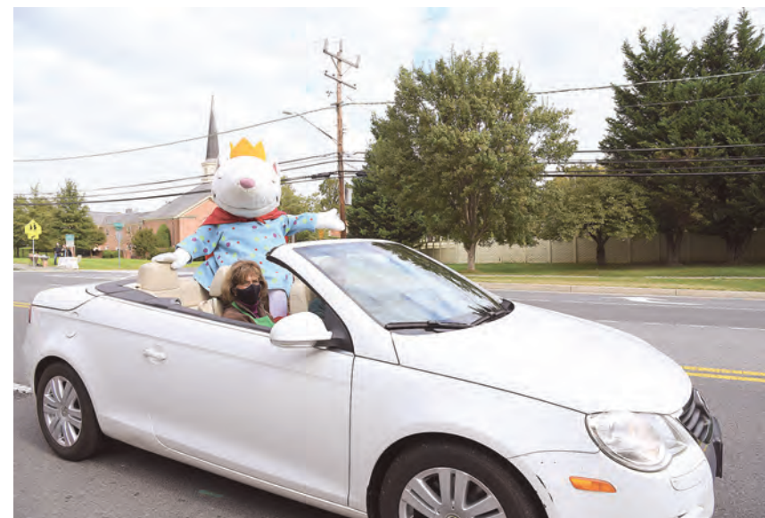
Story book character Lilly appears with Friends of the Library Potomac.

Questions? Check in with Potomac Chamber of Commerce https://www.potomachamber.org/