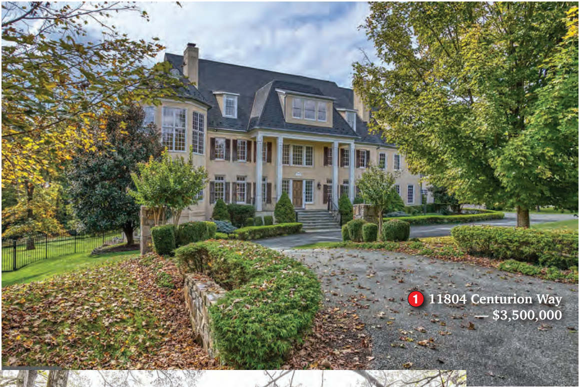
1 11804 Centurion Way — $3,500,000

IN JULY, 2022, 58 POTOMAC HOMES SOLD BETWEEN $3,500,000-$370,000.