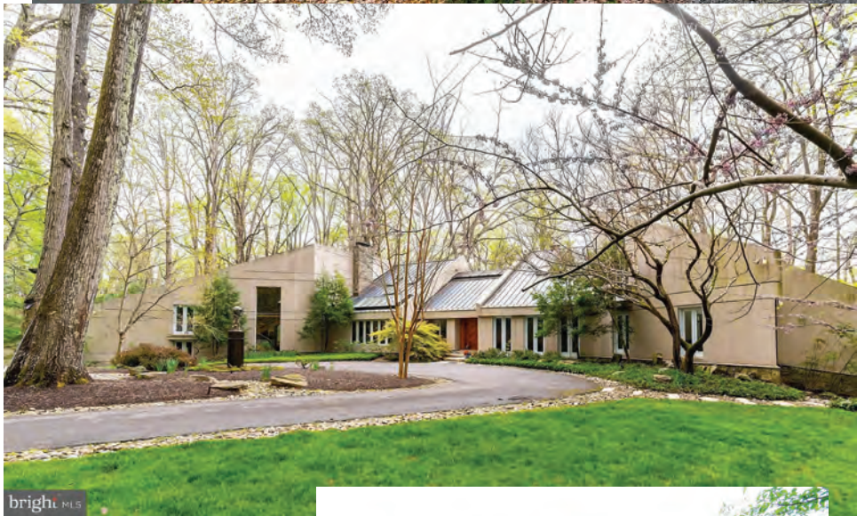
3 11601 Springridge Road — $2,600,000