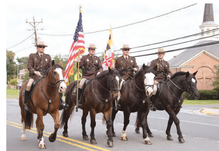
Maryland mounted police provided the equine presence for this year's Potomac Day Parade.