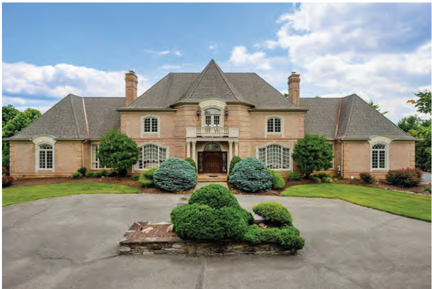
2 9305 Belle Terre Way — $2,625,000