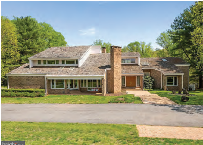
6 11008 Balantre Lane — $2,320,518