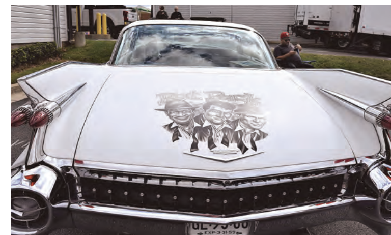
Rat Pack for the car show.