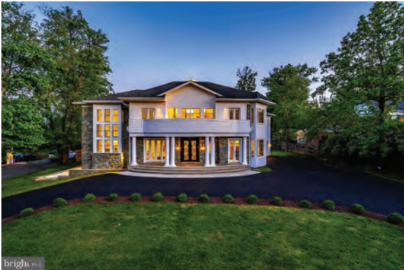
4 9318 Cranford Drive — $2,580,000