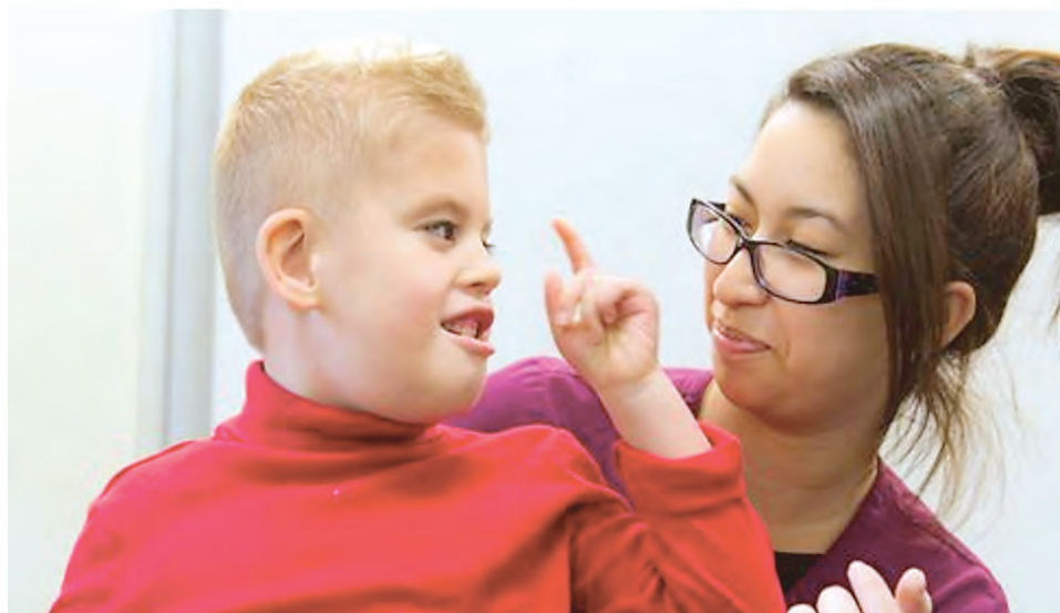
FCPS.EDU/ACADEMICS Occupational therapists work to address a student's ability to access and participate in school activities.

practices for students with disabilities had been identified. However, teachers and support staff who interact with students face difficulty implementing programs effectively. A poorly implemented program can fail students just as easily as a poorly designed one. AIR's finding was important to Campbell. "If the programs are not implemented with the same evidence-based science, then the outcomes are not going to be the same," she said.