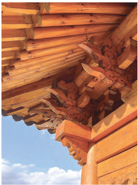
The pavilion, constructed the traditional way, without nails or screws, is of a design shown to withstand earthquakes in Asia. The Korean Bell Garden, part of Meadowlark Botanical Gardens, is celebrating its 10th anniversary.

ginea’s State bird, the Cardinal. Also shown are ten traditional symbols of longevity: the sun, mountains, water, clouds, stone, pine trees, the white crane,