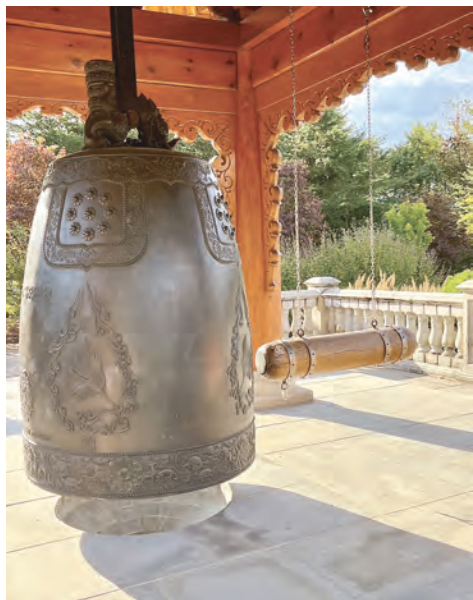
The Korean cast bronze bell, named “Peace and Harmony”, suspended from the beams of the pavilion, is struck by the wooden beam on the side that produces a sound that lasts more than three minutes. The Korean Bell Garden, part of Meadowlark Botanical Gardens, is celebrating its 10th anniversary.

turtle, mushrooms, and deer. The bronze cast bell, created in Korean by artisan Won Kwang-sik, was made using designs from the