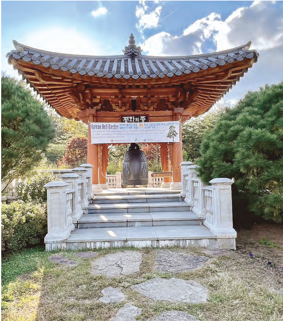
The Korean Bell Garden Pavilion, a significant element of Meadowlark Botanical Gardens, provides a cultural link for the many Korean Americans living in Northern Virginia. The Bell Garden is celebrating its tenth anniversary.