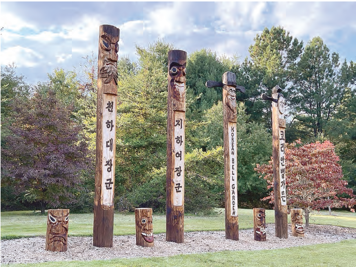
Traditional jangseung, or Korean totem poles, stand near the bell pavilion as they would have stood to protect a Korean village.

After the tree planting, the assemblage moved to the “Peace and Harmony” bell pavilion to strike the bell in celebration of the garden’s anniversary and the ongoing relationship of the two