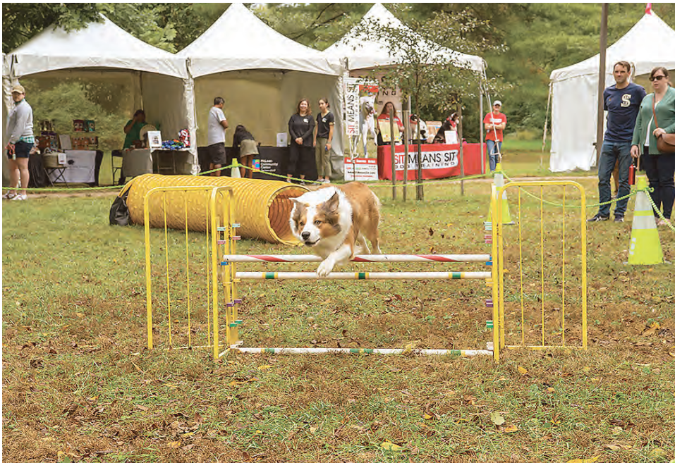
The McLean Pet Fest takes place Sunday, Oct. 16, 2022 at McLean Central Park.

Ingleside Ave., McLean. The Boy Band Project transports you back to a time when the boy band phenom dominated pop culture and TRL was appointment television. Delivered with their own special mix of handsomeness, tongue-in-cheek humor and talent from Broadway's "Wicked," "Hairspray" and "Mamma Mia" (and more), these boys recreate the sounds and choreography of your favorite boy bands, from NKOTB to One Direction.