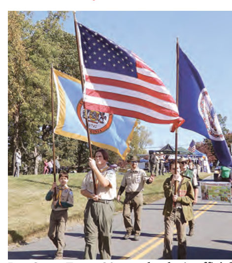
Boy Scout Troop 30 was the day's official