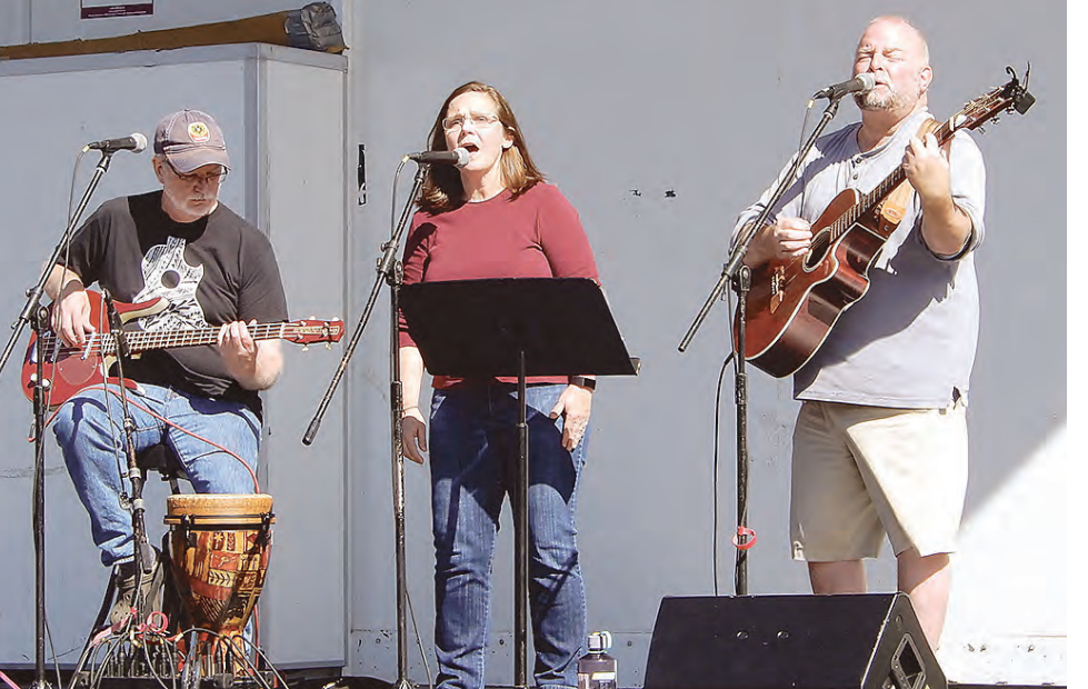
The Liz Deal Trio performing onstage.