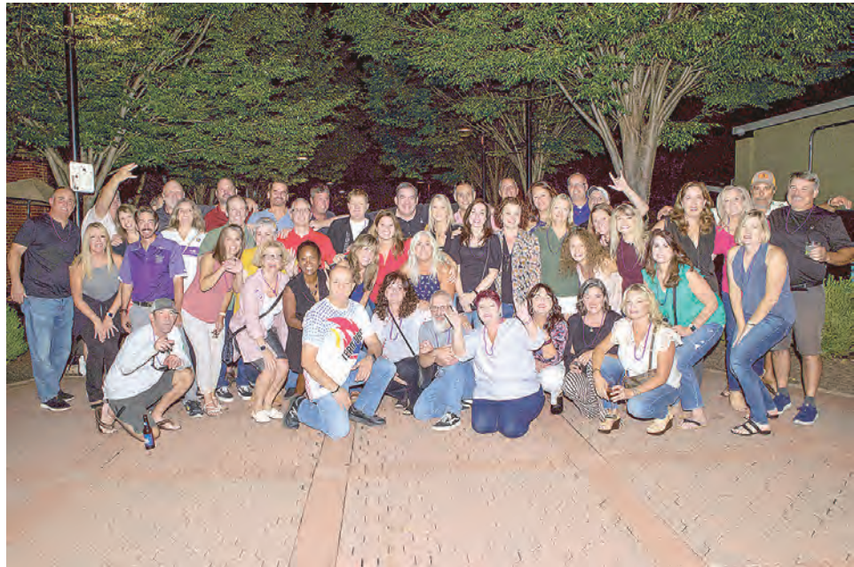
Class of 1987 at Rockwood in Gainesville, VA