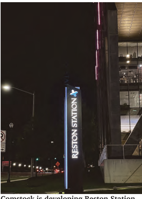
through a public-private partnership. Reston Station is adjacent to the current terminus station of Metro's Silver Line of Phase I extension to Dulles International Airport.