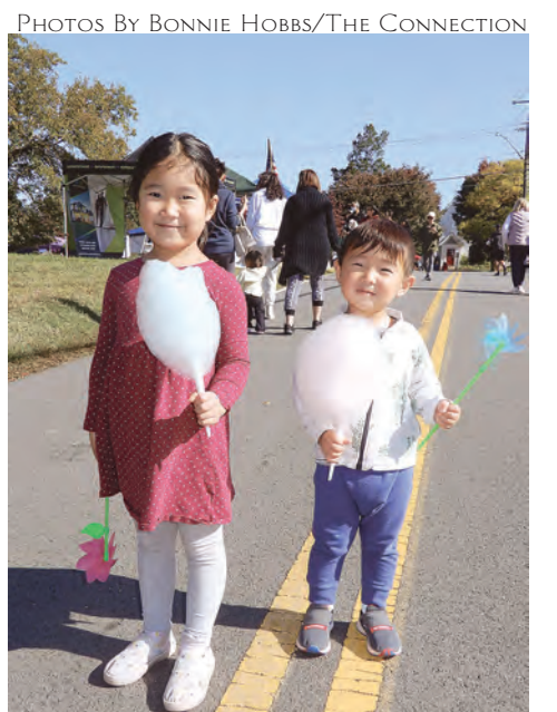
2, with cotton candy and flowers at