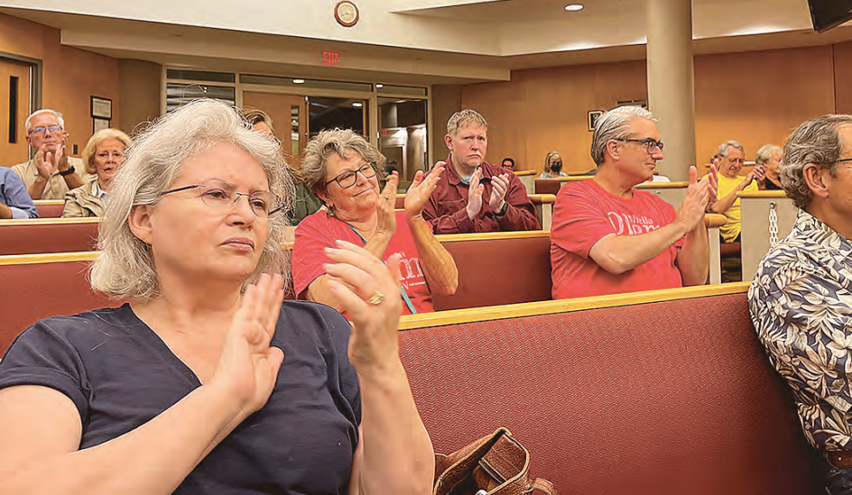
Audience at the live broadcast mayoral debate

"As mayor, I know that part of my job is to