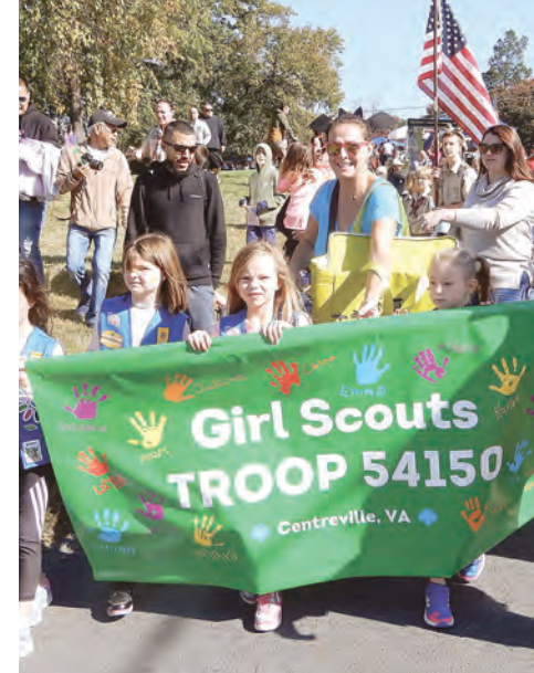
Daisy Scouts on parade.