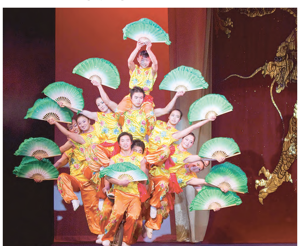
The Peking Acrobats will appear at The Alden Theater in McLean on Sunday, Oct. 23.

suspicion in a Catholic school in the Bronx in the 1960s. The play tells the story of principal Sister Aloysius's suspicions about an inappropriate relationship between a priest and a young male student. Visit the website: www. viennatheatrecompany.org