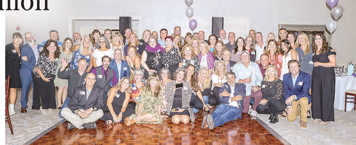
Chantilly Class of 1987 at Stonewall Golf Club