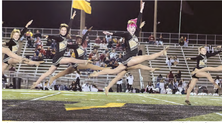
The Westfield High School Dance Team performs at halftime of their homecoming game with Oakton