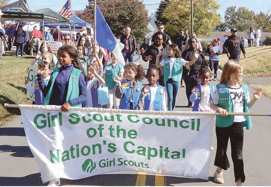
Girl Scouts marching in the parade.