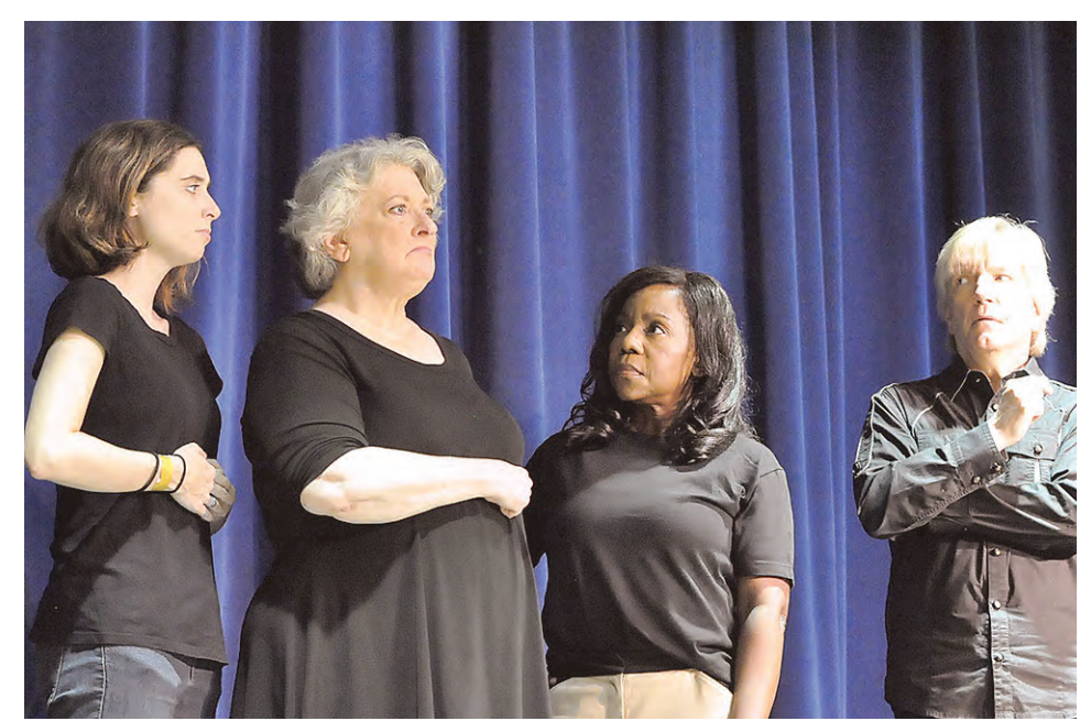
The Vienna Theatre Company will present "Doubt: A Parable" Oct. 21-Nov. 5 in Vienna.