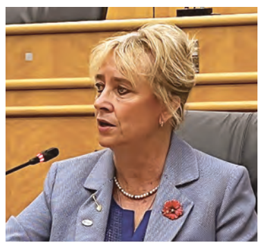
Candidate Sheila Olem serves most recently as mayor since January 1, 2021.