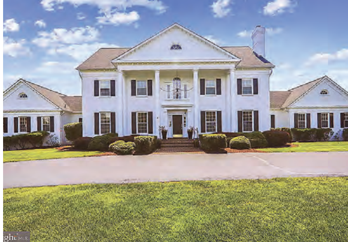
4 12012 Great Elm Drive — $2,025,000