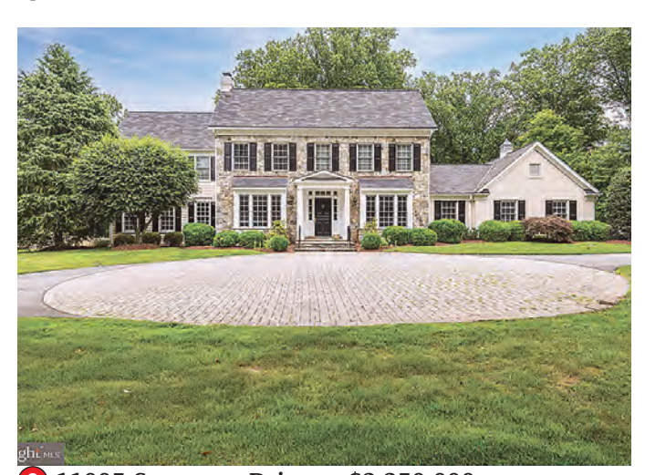
3 11005 Stanmore Drive — $3,350,000