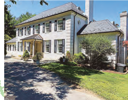
5 9115 Paytley Bridge Lane - $1,950,000