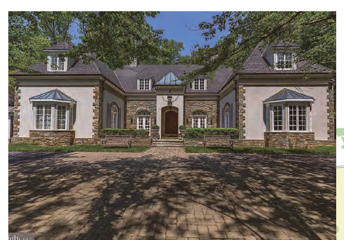
2 11218 River View Drive — $3,500,000