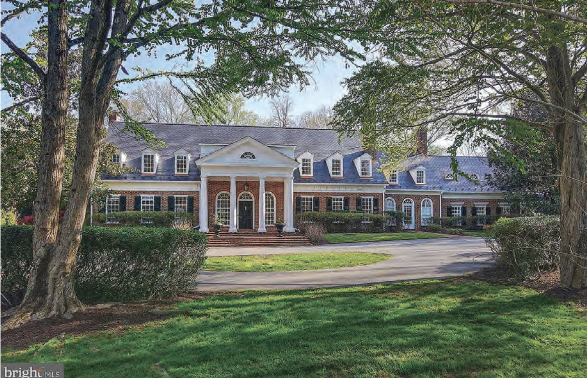
11811 Piney Glen Lane — $3,600,000