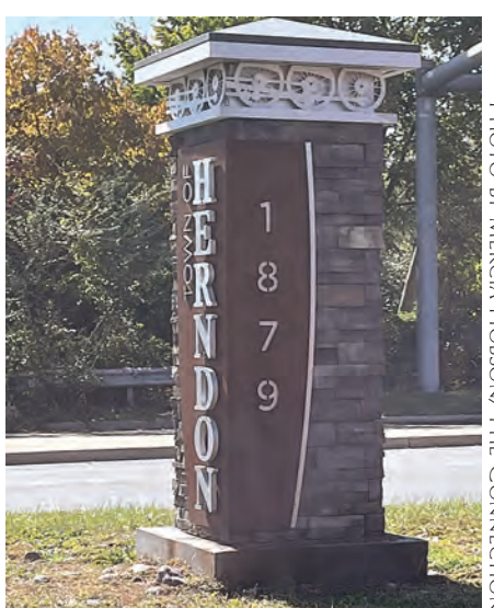
The Town of Herndon installed gateway signs to welcome residents and visitors as they enter the town limits.

Herndon needs real leadership to make changes. Leadership that listens to people