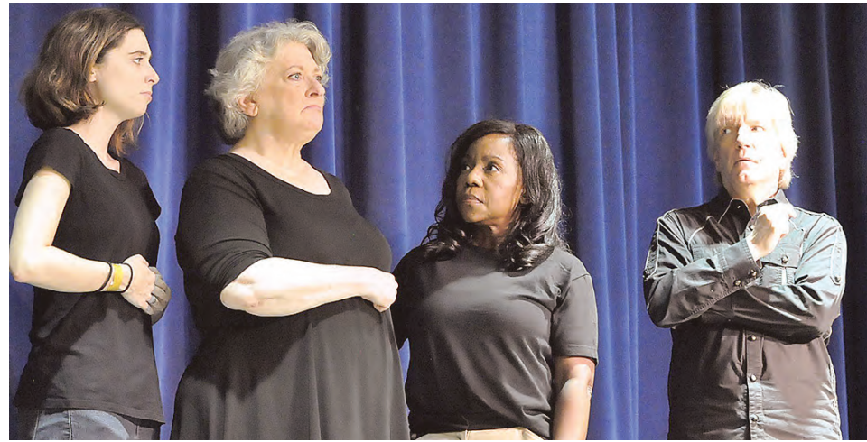
The Vienna Theatre Company will present "Doubt: A Parable" Oct. 21-Nov. 5 in Vienna.